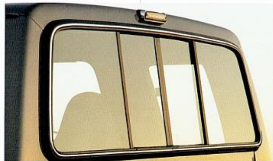
For increased ventilation, the sliding rear window has been a popular F-Series option.