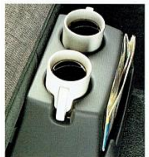
Also new for 1992, the removable mini-console is included as part of the optional Light/Convenience Group on the Regular Cab models—along with an under-hood light, front door map pockets and more.