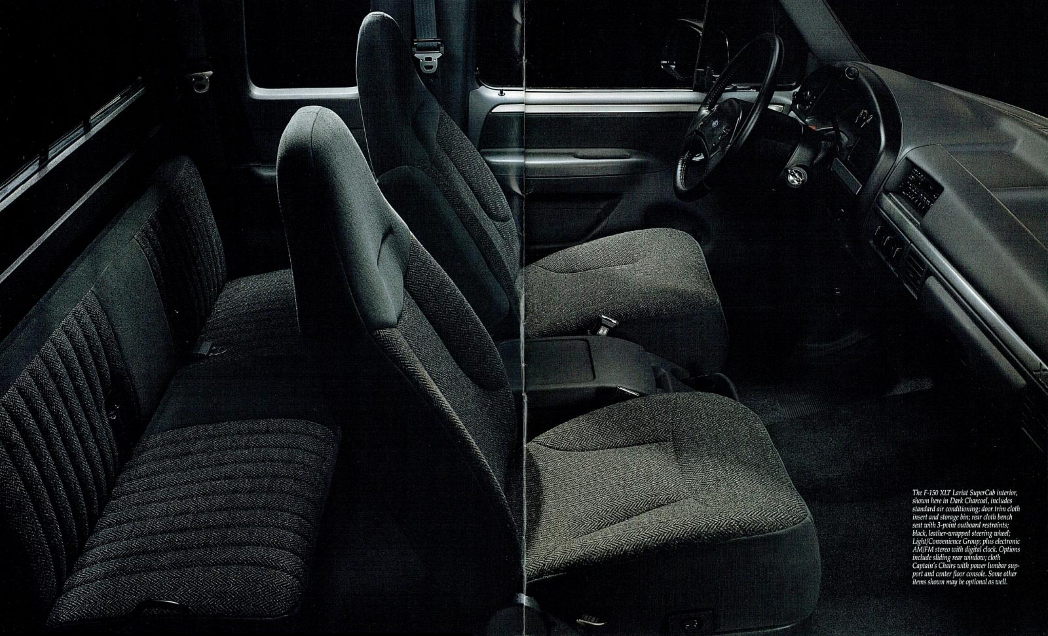
The F-150 XLT Lariat SuperCab interior, shown here in Dark Charcoal, includes standard air conditioning; door trim cloth insert and storage bin; rear cloth bench seat with 3-point outboard restraints; black, leather-wrapped steering wheel; Light/Convenience Group; plus electronic AM/FM stereo with digital clock. Options include sliding rear window; cloth Captain's Chairs with power lumbar support and center floor console. Some other items shown may be optional as well.