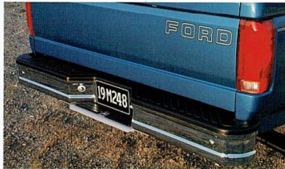
The step bumper option, shown above, makes it easy to access your pickup bed.