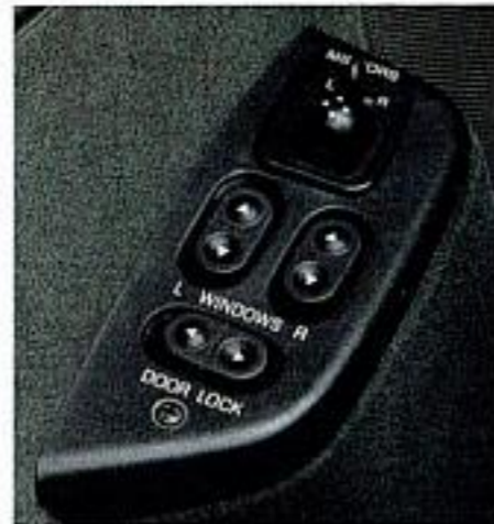
Controls to operate the optional power windows, power door locks and mirrors are conveniently located on the door-trim panel. A good example of the driver-friendly design of the 1992 F-Series.

Finally, we've installed three-point outboard safety restraints on the SuperCab optional rear bench seat—something that won't go unappreciated.