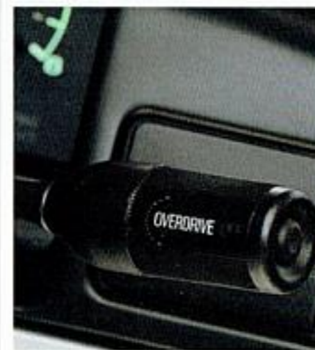
The EAOD driver-activated overdrive cancel switch is mounted on the shift lever. This switch is designed to prevent upshift to the overdrive gear—a particularly useful feature in hilly terrain to obtain third gear engine braking on downgrades.