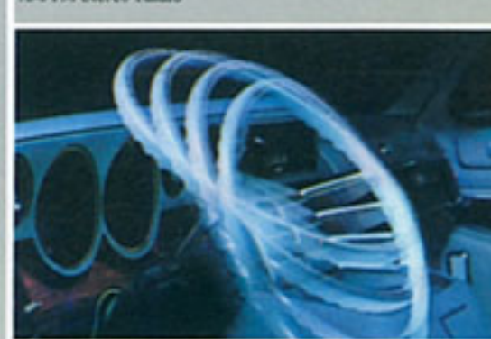
Tilt Steering Column