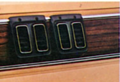
Rear Air Conditioning