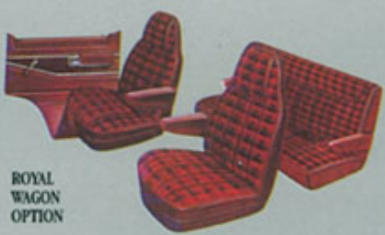
ROYAL WAGON OPTION

Driver and front passenger low-back bucket seats with deluxe vinyl trim are standard in the Royal Wagon Package. In Blue, Cashmere or Red. A three-passenger bench seat is included.