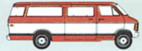
Paint Procedure PXS