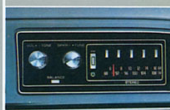
AM/FM Stereo Radio