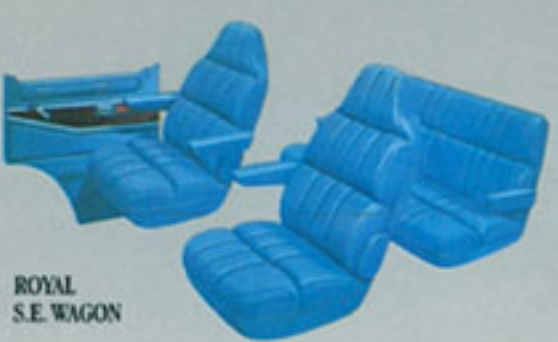
ROYAL S.E. WAGON

The Royal Wagon Package offers two optional high-back Command bucket seats in plaid cloth-and-vinyl trim. They include non-swivel bases, or optional swivel bases so that they can be rotated rearward. In Blue, Cashmere, Red or Silver. A three-passenger bench seat is included.