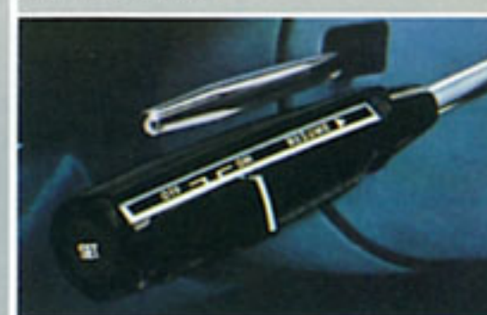
Automatic Speed Control