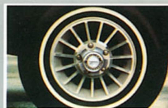
Aluminum Road Wheel

High-back Command bucket seats, in deluxe cloth-and-vinyl trim. In addition to the standard reclining feature, they can be ordered with optional swivel bases so that they can be rotated rearward. In Blue, Cashmere, Red or Silver. A three-passenger bench seat is included.