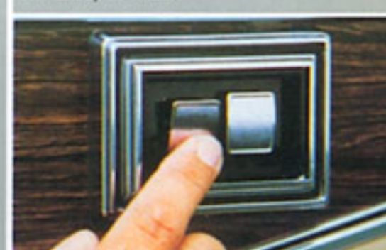
Front Power Windows