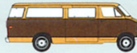
Paint Procedure PXW