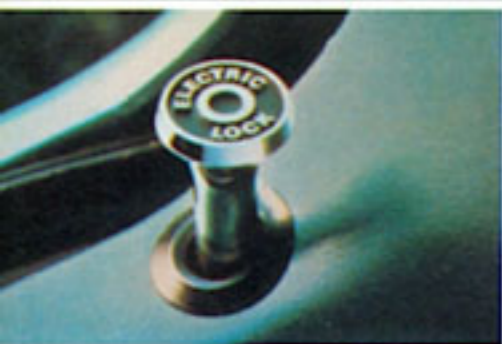
Electric Door Locks