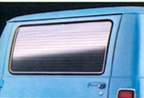
Rear Window Defroster