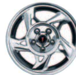
16" Chrome Tech torqued cast-aluminum. Available on GT and GT1.