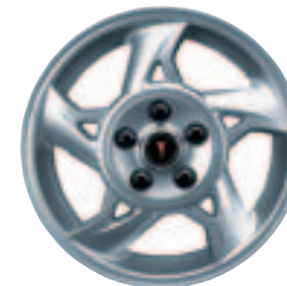
16" painted cast-aluminum. Standard on GT and GT1.