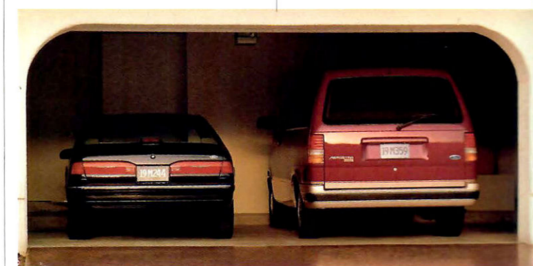
Sized-right Aerostar fits into most garages with sedan-like ease.