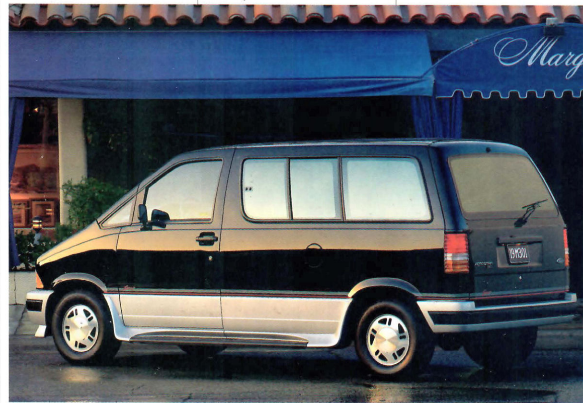
Top: Aerostar XL Plus with optional two-tone Electric Red Clearcoat Metallic with Medium Platinum Clearcoat accent.