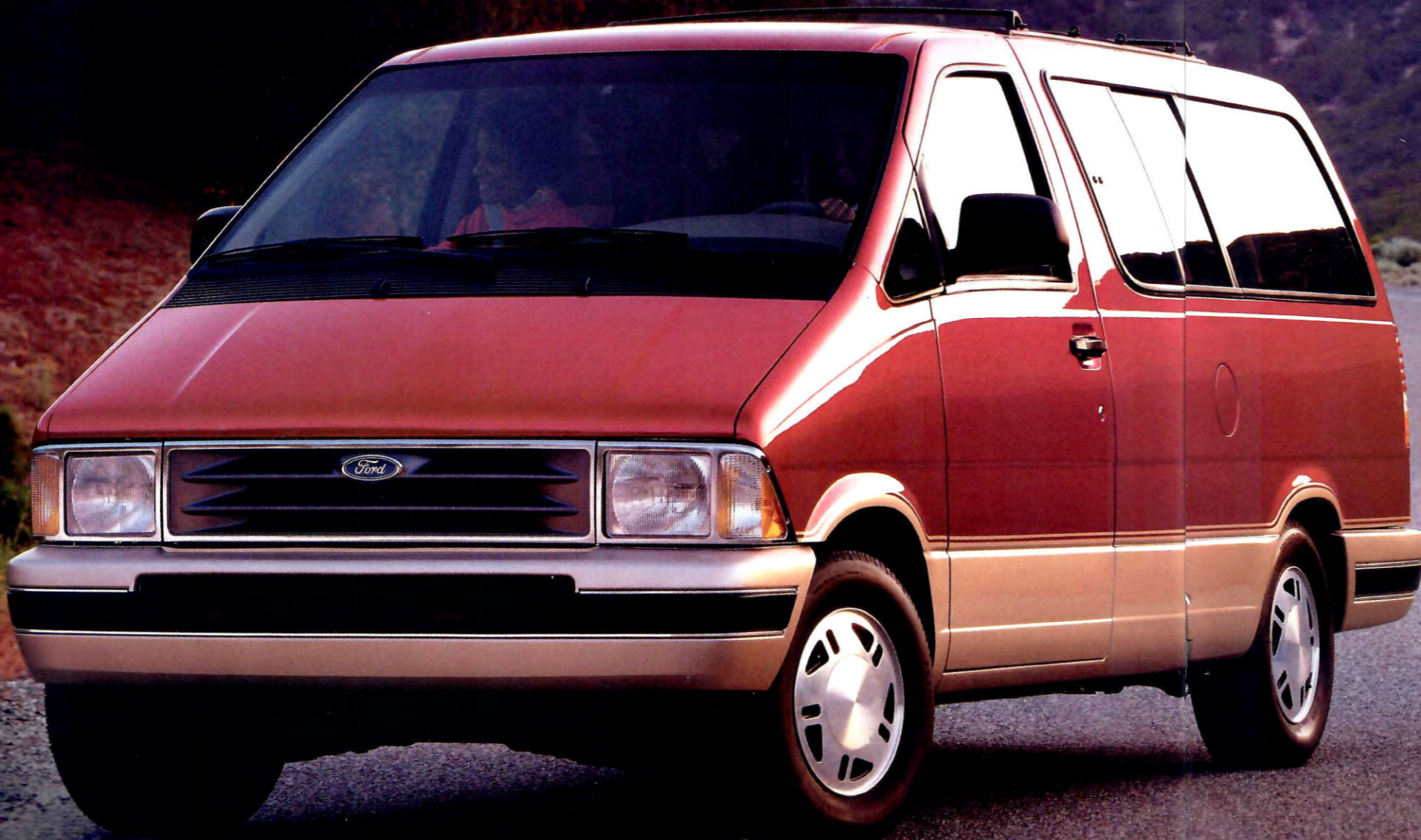
Left: The unique Eddie Bauer paint scheme includes a Mocha Frost Clearcoat Metallic lower accent, shown here with Electric Red Clearcoat Metallic. Additional upper body choices are Medium Mocha Clearcoat Metallic, Currant Red, Twilight Blue Clearcoat Metallic, Deep Emerald Green Clearcoat Metallic, Raven Black and Oxford White.

The Eddie Bauer is a very special Aerostar. The reclining captain's chairs feature power lumbar supports. The 2- and 3-passenger rear benches fold down to form a bed — ideal for overnight stops on trips (or choose the quad captain's chairs, available at no extra charge). Special cloth trim covers the seats. The floor mats are carpeted (front mats are monogrammed) and the steering wheel is wrapped in leather.