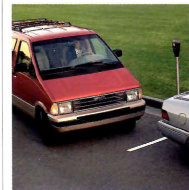
Regular-length Aerostar's compact exterior helps it get in and out of the tight spots — a big benefit when space is limited.

See the back cover for packages. Content is subject to change and your dealer is always your best source for current product information.