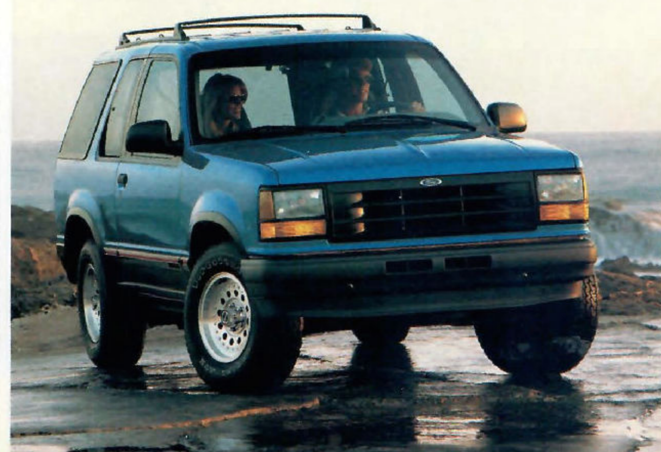
The Eddie Bauer 2-Door Sport model is yet another way to express your independence in Explorer. Shown here in Brilliant Blue Clearcoat Metallic. Some equipment shown on these pages is optional.

The Explorer 4x4 features the push-button ease of our Touch-Drive electric shift transfer case, with convenience unmatched by any