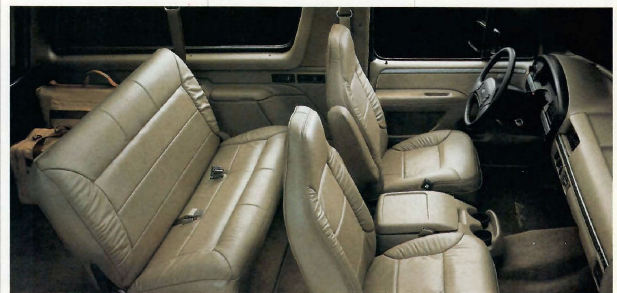
Eddie Bauer Interior shown in Mocha. Some equipment shown on these pages is optional.

For openers, we've given it a more modern look by re-styling the front end.