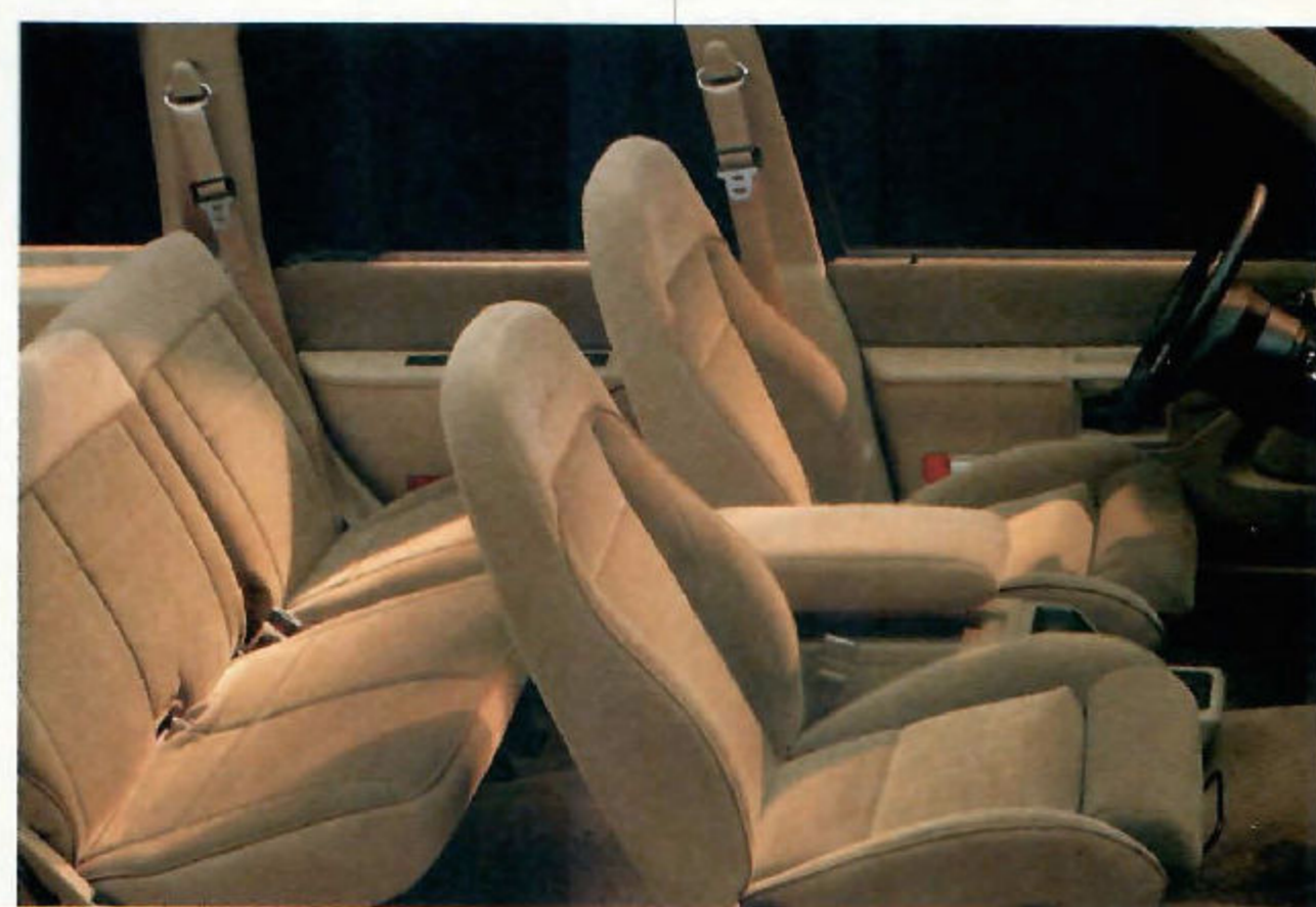
Explorer Eddie Bauer 4-Door above is in Cayman Green Clearcoat Metallic/Mocha. The Eddie Bauer interior is in Mocha (see your dealer for availability date of the cloth seat sew style shown).

Test-drive America's No. 1 compact utility vehicle today, at your nearest Ford Dealer.