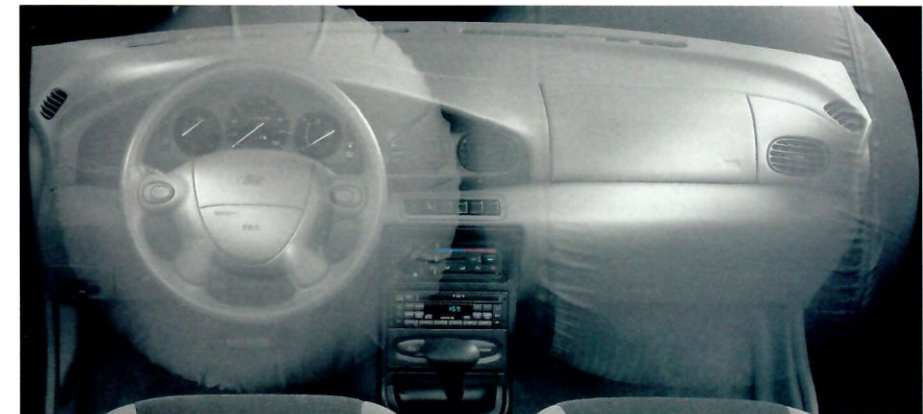
Right: The standard driver and front passenger air bag supplemental restraint system is provided for use in addition to the lap/shoulder belts. It's the first such system offered by an automobile in Aspire's class.

Another thoughtful feature is Aspire's optional air conditioning system. Available with all models, it's CFC free for the benefit of the environment. It helps to prevent further ozone depletion while it keeps things cool and pleasant for passengers.