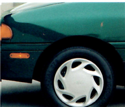
Aspire's 5-mile-per-hour bumpers are designed to protect lamps, cooling system, exhaust and other body components in the event of a minor impact.