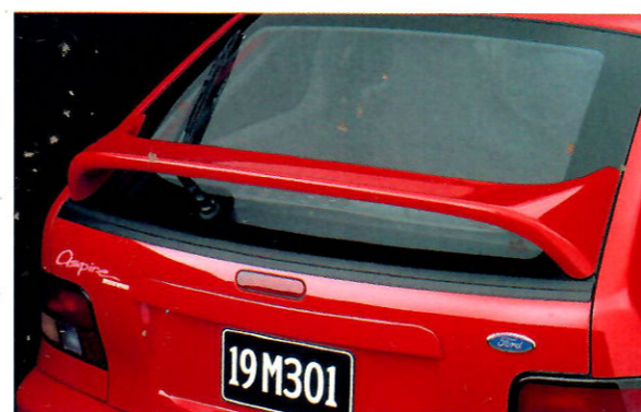
A rear spoiler complements the sporty flair of the Aspire SE.