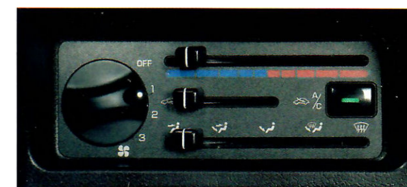
The cool comfort of air conditioning is optional with all Aspire models. And it's free of CFCs.