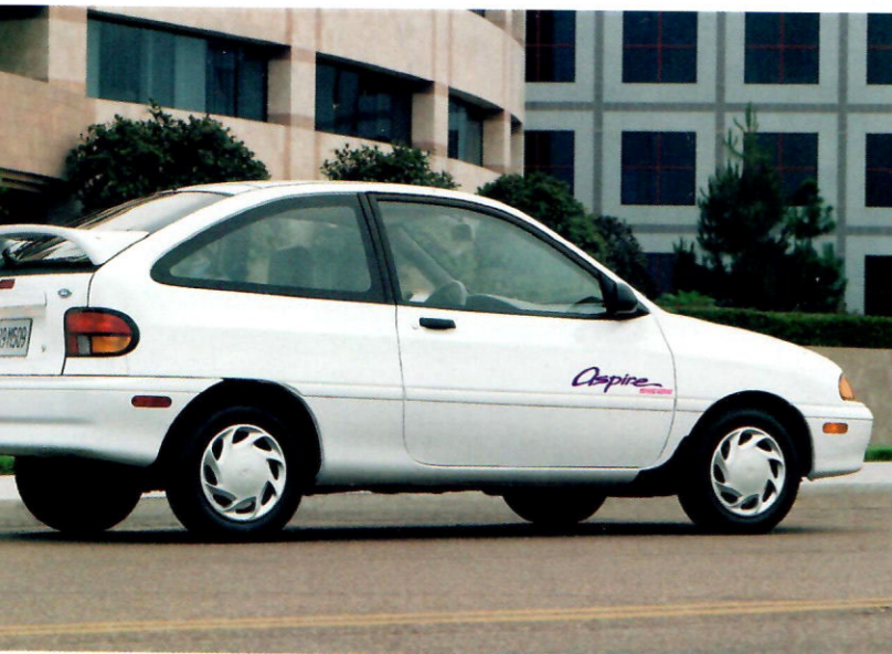
Aspire SE shown in Crystal White. The sport-minded 3-door features fog lamps and a rear spoiler.

pension includes a stabilizer bar to help prevent vehicle sway. The torsion-beam rear suspension (with a stabilizer bar built in) is engineered to maintain the proper camber angle whether turning or going straight. Its simple, space-efficient design also allows a low trunk floor for increased luggage capacity.