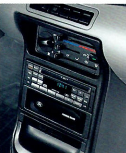
Shown above: The passenger seat back has a memory feature (3-door models) for personalized comfort (top). The standard full-length console features handy cup holders (center). Radio and climate controls are conveniently located in the console's front panel (bottom).

Another thoughtful feature is Aspire's optional air conditioning system. Available with all models, it's CFC free for the benefit of the environment. It helps to prevent further ozone depletion while it keeps things cool and pleasant for passengers.