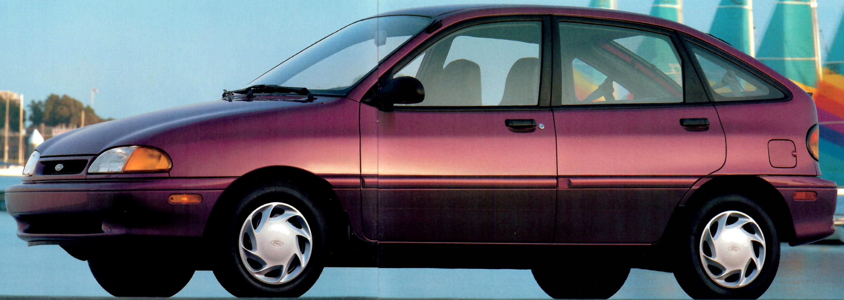
Aspire 5-Door in Wild Iris Clearcoat Metallic.