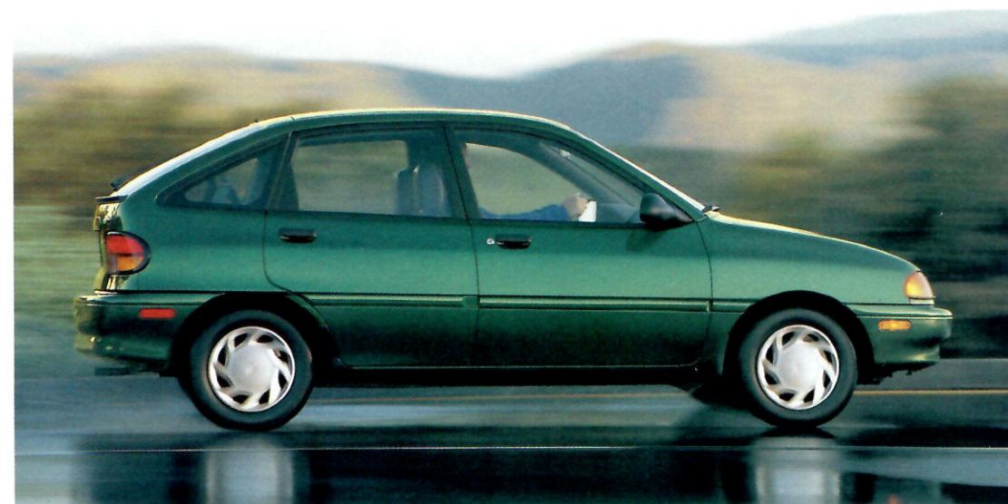
Front-wheel drive gives Aspire good traction in adverse driving conditions such as snow or mud. Optional anti-lock brakes help to provide more controlled stops when hard braking may otherwise cause the wheels to lock up.

released repeatedly in the same way you were probably taught to "pump your brakes." But the speed of the anti-lock braking system far exceeds human capability, providing the driver a much greater degree of steering control in hard braking situations on a variety of slippery surfaces.