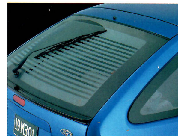
The optional rear window wiper/washer helps clear the view behind in inclement weather.