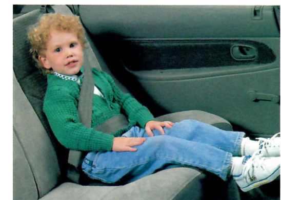
Rear seat passengers are provided full lap/shoulder safety belts which offer better overall protection than simple lap belts.

Aspire's "childproof" rear door locks on 5-door models help keep curious little fingers out of mischief. When the locks are activated, the rear doors can't be opened from inside. And as a measure to help increase visibility, Aspire is the first in its class to offer dual outside mirrors as standard.