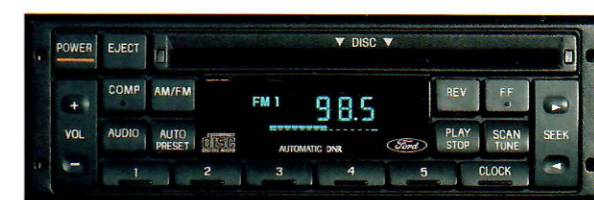
Enjoy the superb reproduction technology of digital sound with Aspire's optional AM/FM stereo radio with compact disc player.