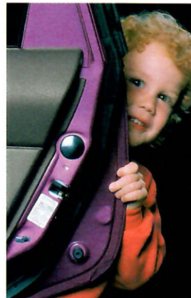
Above: Aspire 5-door models feature childproof locks in the rear doors which, when activated, prevent accidental opening.