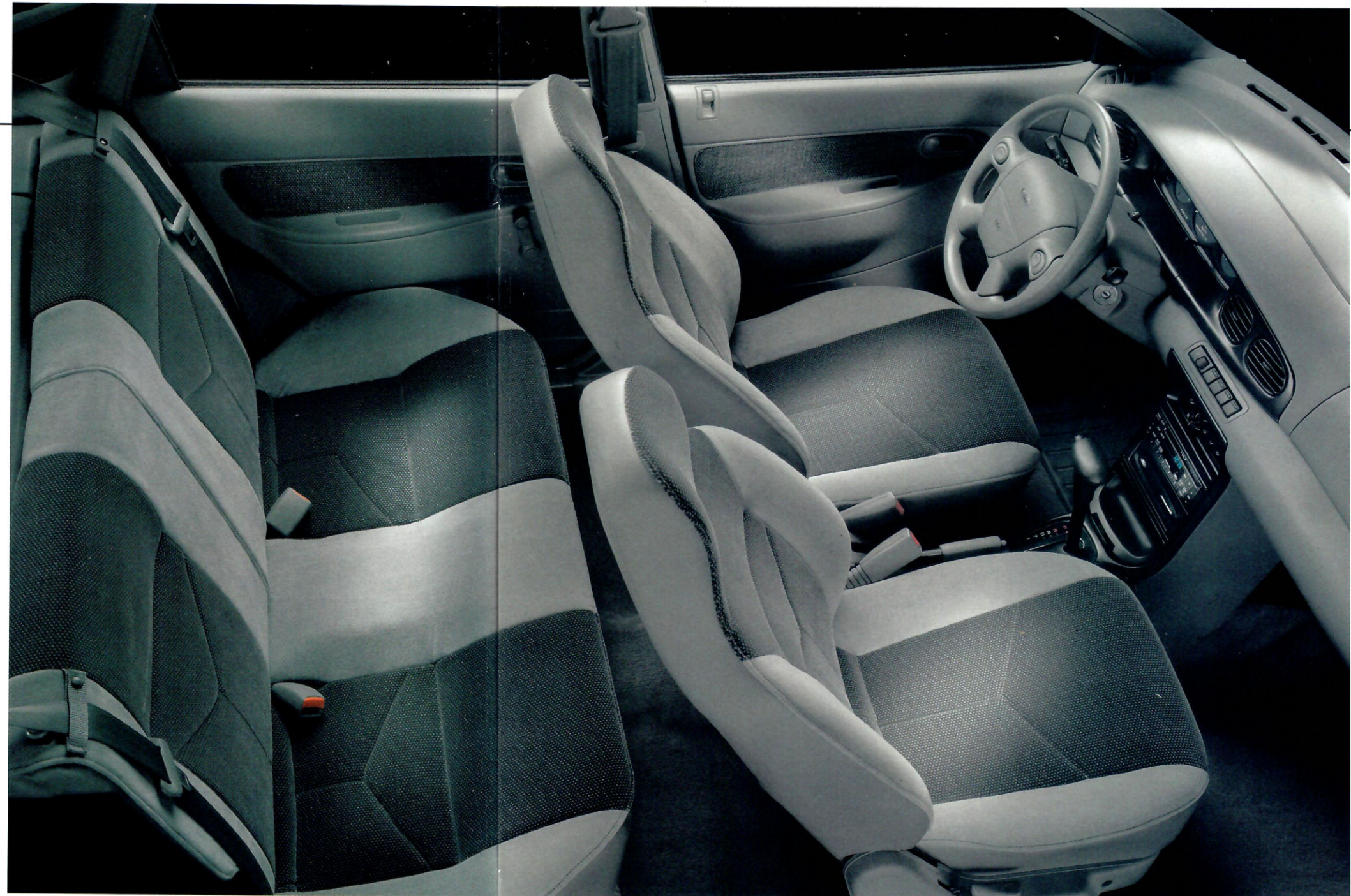
Left: Aspire interior shown with the interior decor and convenience group and other optional equipment.