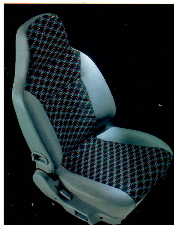
Aspire SE features front sport cloth and vinyl reclining bucket seats which include the convenience of a passenger-side memory seat back.

Courtesy lamps Color-keyed carpeting on floor and in luggage compartment Color-keyed luggage compartment with molded side trim Soft-feel shift knob Inside hood release Cigarette lighter and front and rear ashtrays Maintenance-free battery