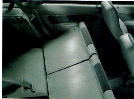
Aspire 3-Door's rear seat back (split seat backs in SE and with interior decor and convenience group) can be folded forward to accommodate stowage.