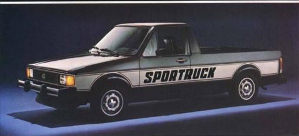
VW Sportruck in Black with Autumn Tan interior and white name stripe.