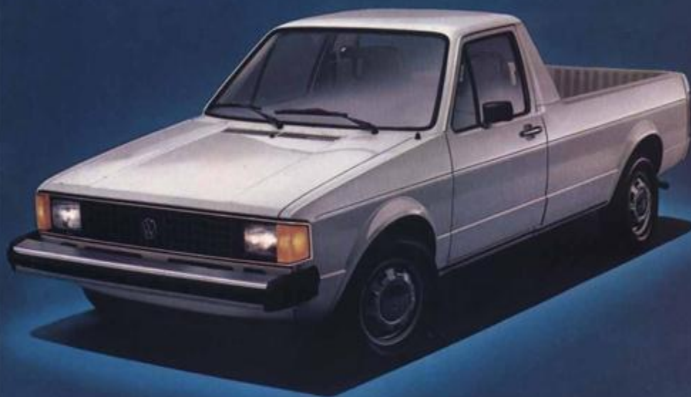
1981 VW Pickup Truck in Cashmere White, with Midnight Blue leatherette interior