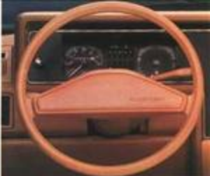
The fully instrumented dash of the VW Pickup.