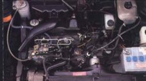
Optional 1.6L Diesel engine for frugal hauling.

Specifications, standard equipment and options subject to change without notice.