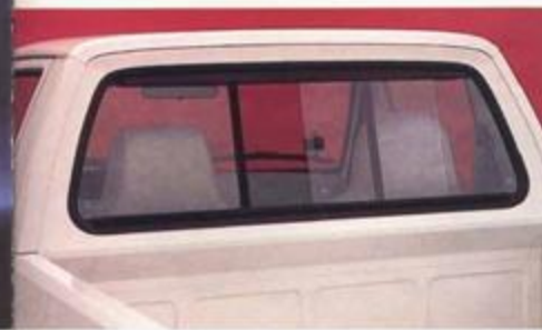
Let in a breeze with optional sliding rear window.