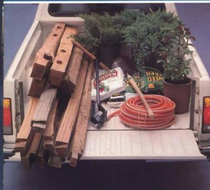
It carries just about everything you need to carry—whenever you need to carry it. Sliding rear window, optional.

Front wheel drive, power assisted front disc brakes, independent front suspension, std.