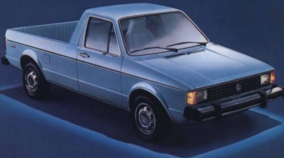
1981 VW Pickup Truck "LX", Lago Blue. Midnight Blue leatherette interior.

VW Pickup Truck. Built tough for heavy hauling. But it drives like something else.