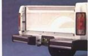
No tools needed to remove the tailgate.