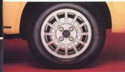
Sporty light alloy wheels.