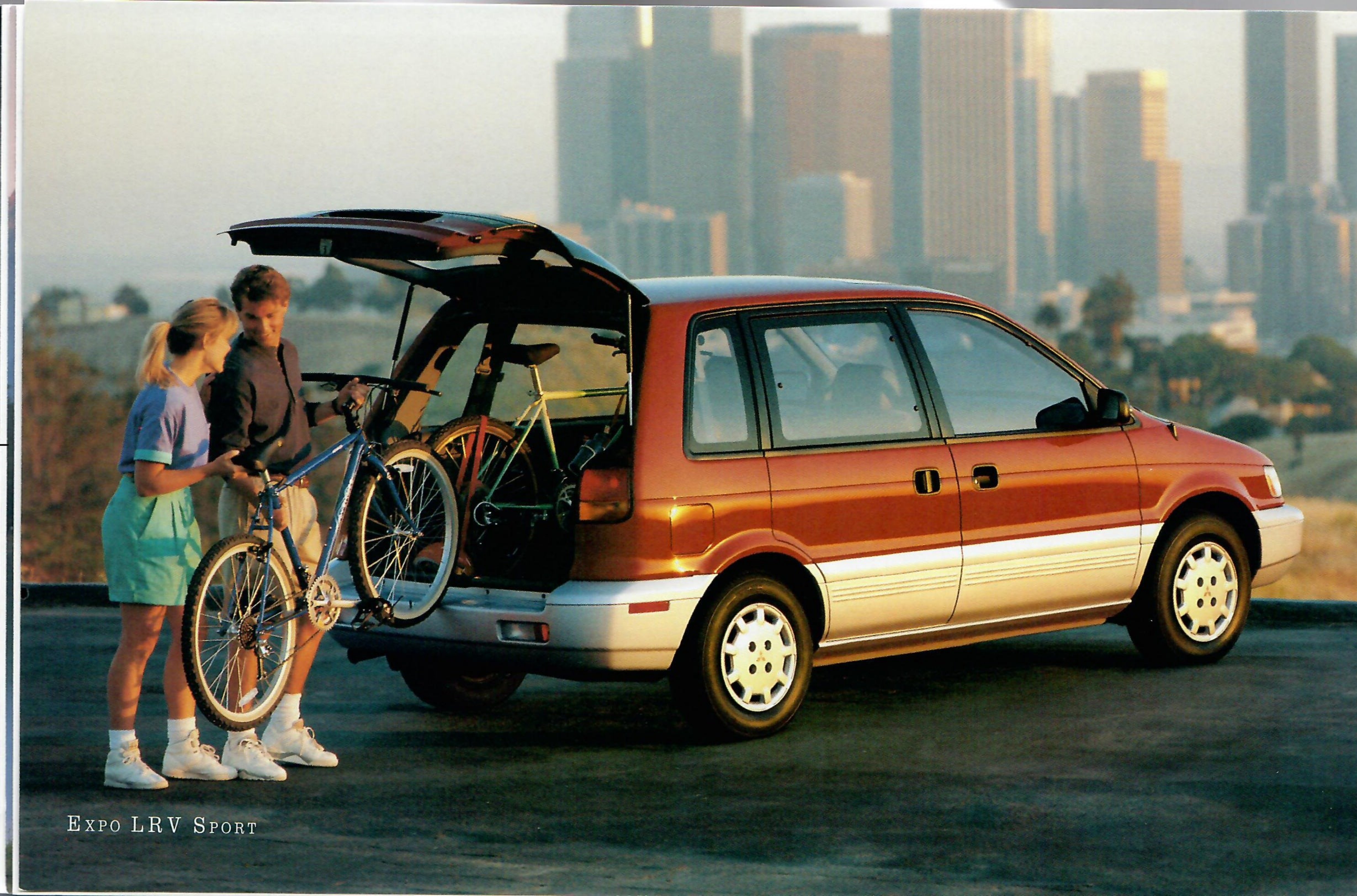
EXPO LRV SPORT