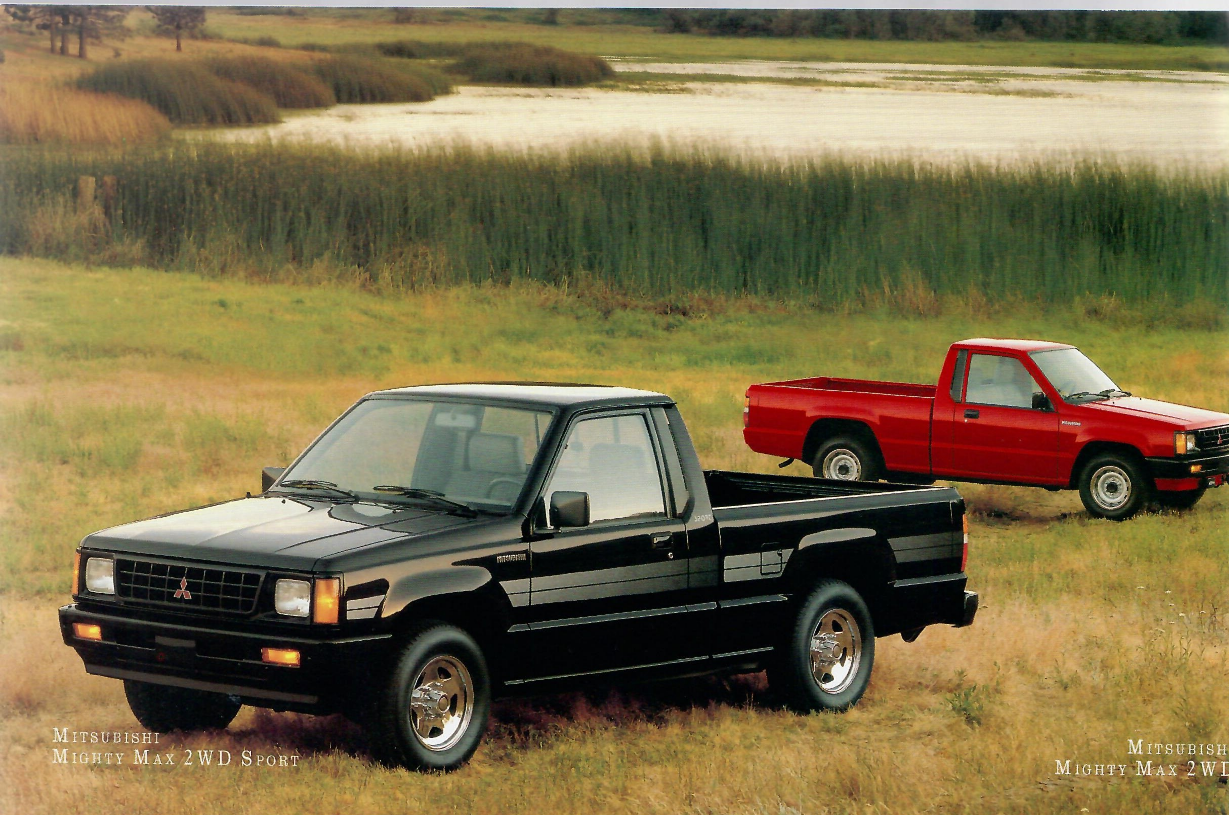
MITSUBISHI MIGHTY MAX 2WD SPORT