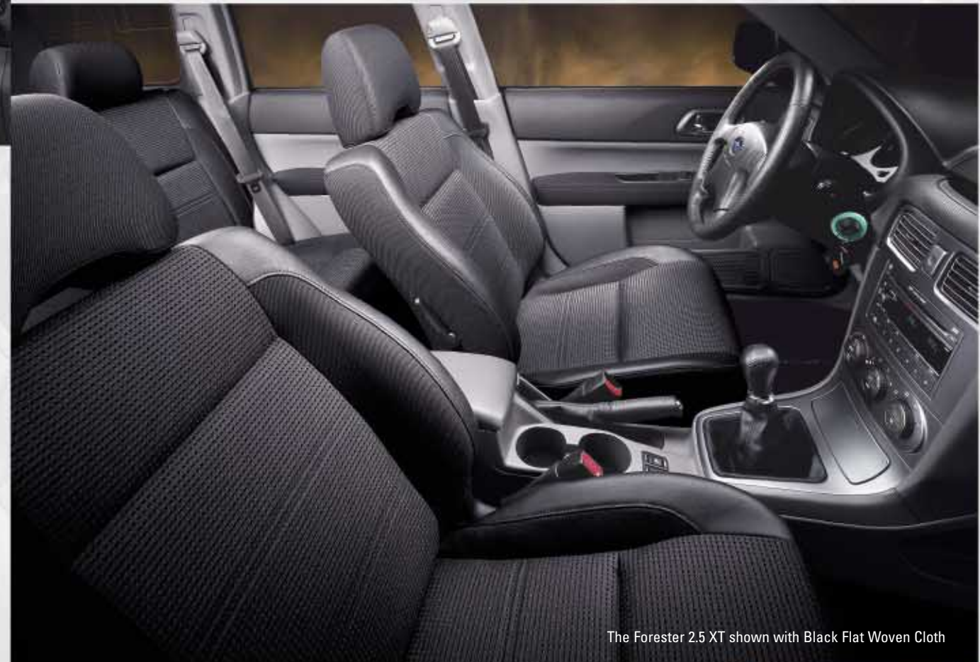
The Forester 2.5 XT shown with Black Flat Woven Cloth

* Always wear seatbelts. Children should be properly restrained in the rear seat.