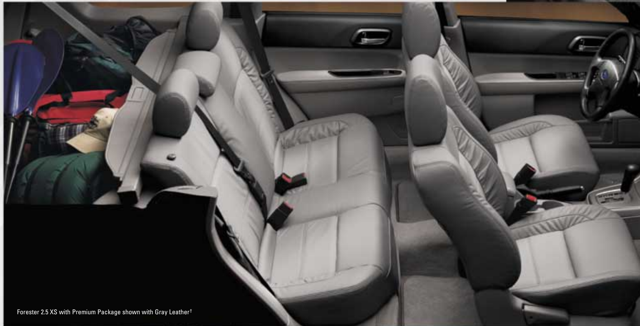
Forester 2.5 XS with Premium Package shown with Gray Leather †

The Premium Package model provides an expansive power sliding moonroof for an open-air environment.