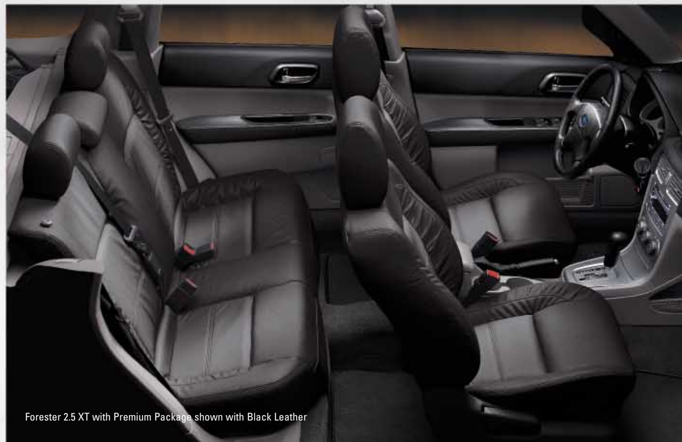
Forester 2.5 XT with Premium Package shown with Black Leather

The Premium Package model provides an expansive power sliding moonroof for an open-air environment.