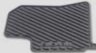
All-weather mats are patterned to match cargo bin and tray.