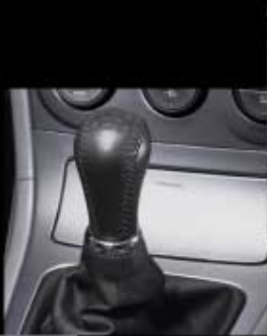
Handsome perforated leather-wrapped shifter handle on standard 5-speed manual transmission.