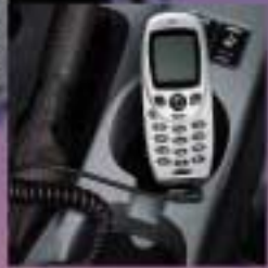
Perfect for charging your cell phone, the center console features an auxiliary 12-volt power outlet.