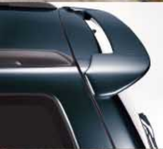
The optional painted rear spoiler adds a sporty touch to the Forester.