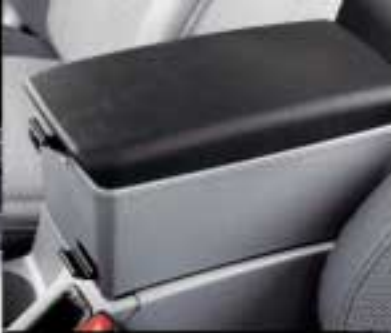
Optional armrest extension provides out-of-sight storage for your phone plus added comfort on long trips.