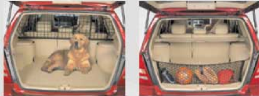
Vertical cargo net provides handy storage to help keep items in place within cargo area.

* Not for use with child seats requiring tether straps.