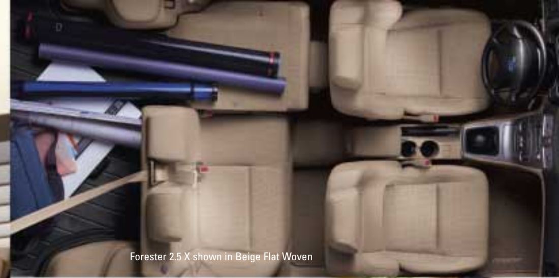
Forester 2.5 X shown in Beige Flat Woven

Optional auto-dimming mirror/compass darkens when headlights are detected from the rear of the vehicle.