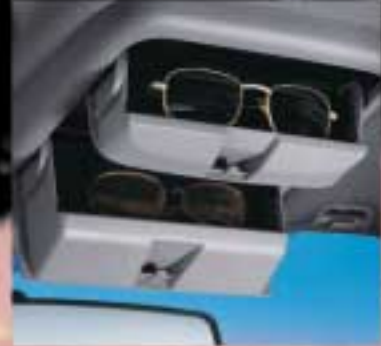
The overhead console features dual pop-down storage bins for easy access to your sunglasses.