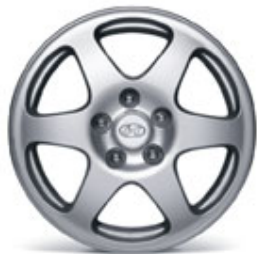
16-INCH ALLOY WHEEL