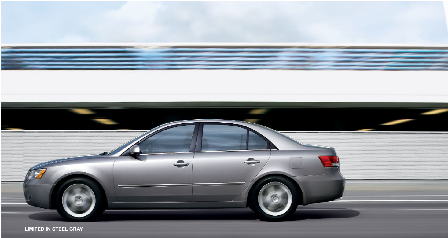
LIMITED IN STEEL GRAY

As much as we like to talk about how the Sonata looks and drives, we never lose sight of the fact that safety comes first. At Hyundai, we're committed to the well-being and peace of mind of everyone who steps into one of our vehicles. The 2007 Sonata comes equipped with standard safety technologies that are unsurpassed in its class and a reinforced body structure that will help protect you and your loved ones for years to come.