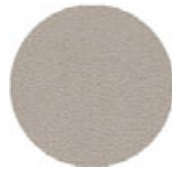
LIMITED BEIGE LEATHER