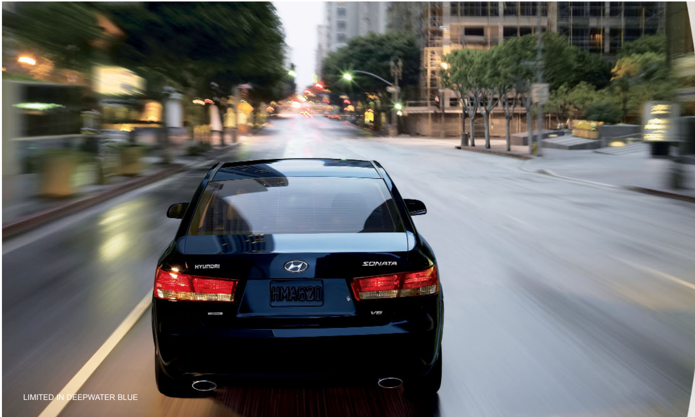
LIMITED IN DEEPWATER BLUE