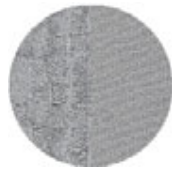
PREMIUM GRAY CLOTH