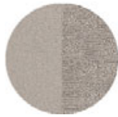
PREMIUM BEIGE CLOTH