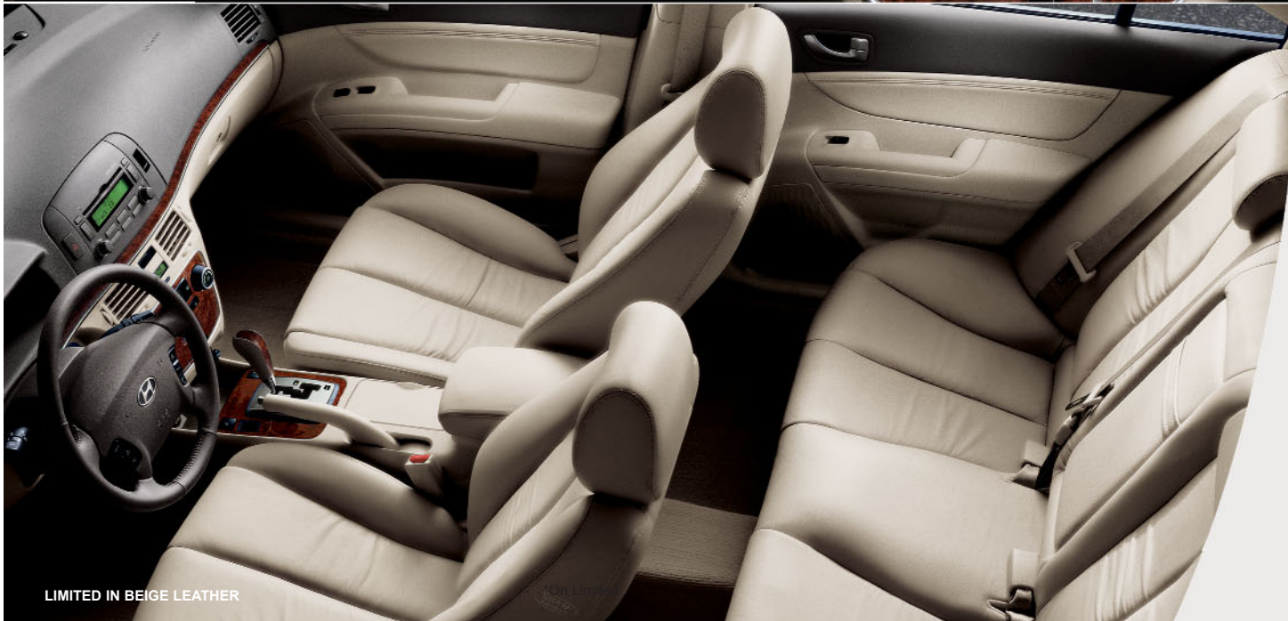
LIMITED IN BEIGE LEATHER