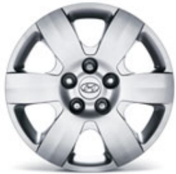
16-INCH WHEEL COVER