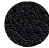
LIMITED BLACK LEATHER*