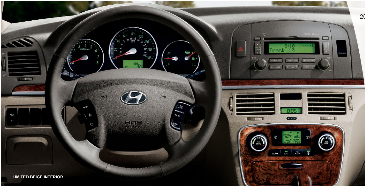
LIMITED BEIGE INTERIOR