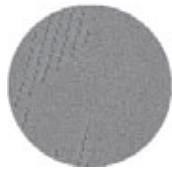
GLS GRAY CLOTH