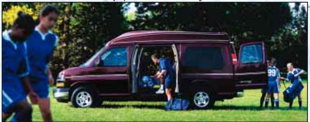
1500 Chevy Express 1500 AWD shown in Berry Red Metallic with available features and a conversion provided by an independent supplier.

Families have counted on Chevy™ vans for more than 35 years for vacation travel. Now Chevrolet® is continuing this tradition with the best full-size van in its history. Introducing the new Chevy Express®. It's the only full-size van to offer a swing-out driver-side passenger door and the first and only full-size van with an All-Wheel-Drive model.* And, for the ultimate in family travel, it's good to know that Express is designed with a strong foundation, making it ideal for an upfit from an independent conversion company.†