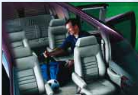
Chevy Express interior with available features and an available conversion provided by an independent supplier.