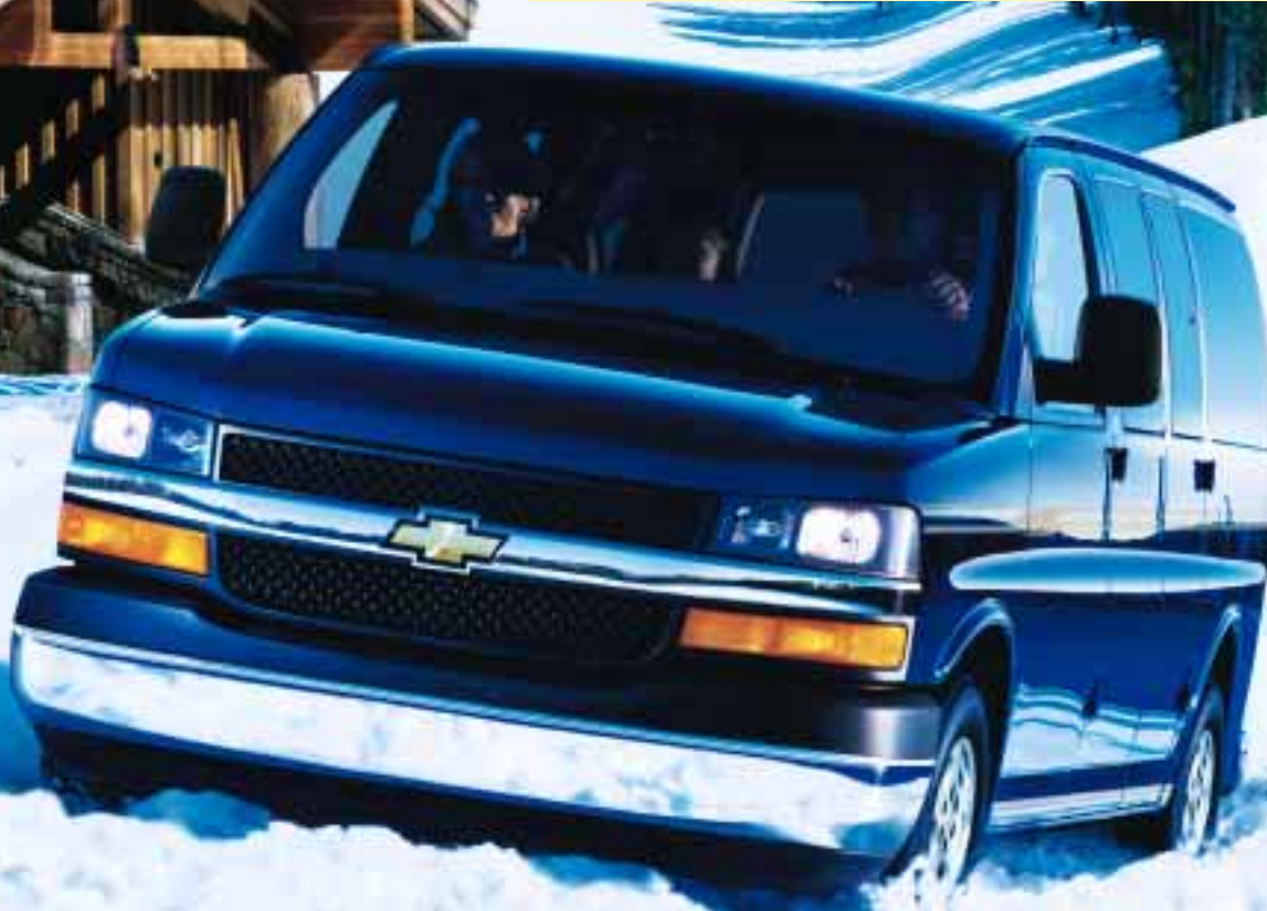
1500 Chevy Express LS AWD shown in Indigo Blue Metallic with available features.

Families have counted on Chevy™ vans for more than 35 years for vacation travel. Now Chevrolet® is continuing this tradition with the best full-size van in its history. Introducing the new Chevy Express®. It's the only full-size van to offer a swing-out driver-side passenger door and the first and only full-size van with an All-Wheel-Drive model.* And, for the ultimate in family travel, it's good to know that Express is designed with a strong foundation, making it ideal for an upfit from an independent conversion company.†