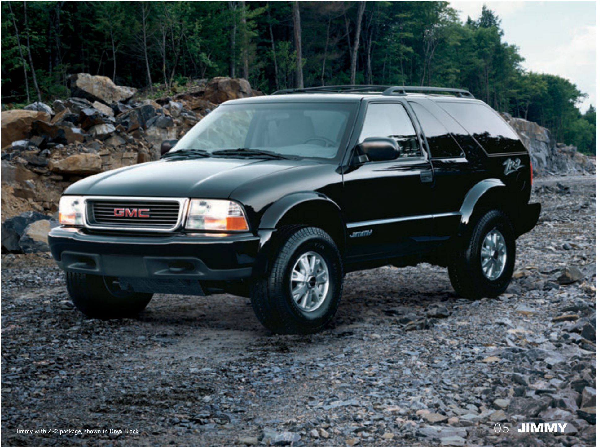
Jimmy with ZR2 package, shown in Onyx Black.