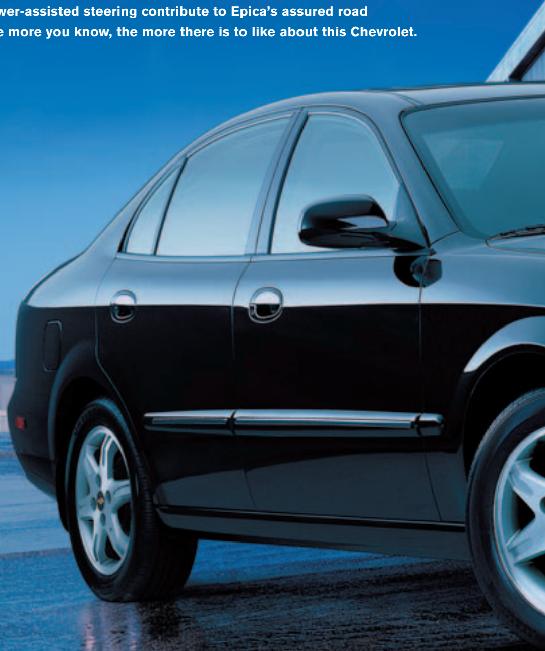
Epica LTZ, shown in Granada Black Mica with sporty 16-in. alloy wheels.

FEEL FREE TO CHECK ITS REFERENCES. The sophistication of Epica's styling is not just window dressing. It is, in fact, an accurate representation of the quality and content of Epica's engineering, which features the 155 hp dual overhead cam six-cylinder engine, mated with a four-speed automatic transmission. Four-wheel independent suspension, four-wheel disc brakes with ABS, and speed-sensitive power-assisted steering contribute to Epica's assured road manners. Epica. The more you know, the more there is to like about this Chevrolet.