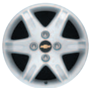
A - 16" Alloy

*Available at extra cost. **Interim availability.