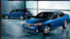
MALIBU & MALIBU MAXX

FUEL EFFICIENCY: GM offers more cars than any other automaker in Canada that get better than 7.0 L/100 km in highway driving. GM has also won more EnerGuide fuel-efficiency awards than any other car company.