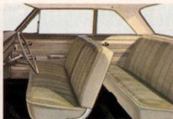
Chevy 11 100 2-Door Sedan interior in fawn.