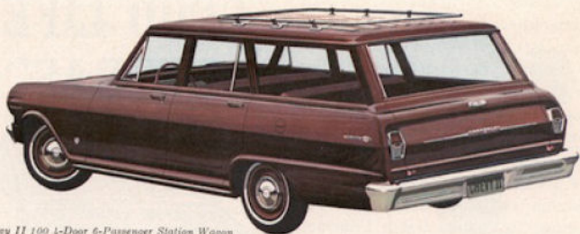
Chevy II 100 1-Door 6-Passenger Station Wagon in Palomar Red shown with Roof Luggage Carrier*.

Pick the pecks you'd like to pack and slip them into the high, wide load space of a new Chevy II Wagon. As wagons go, Chevy II packs more of the load-toting ability you want into a trim easy-to-handle package. Just