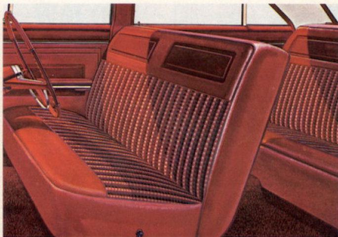
Nova 4-Door Sedan interior in red.