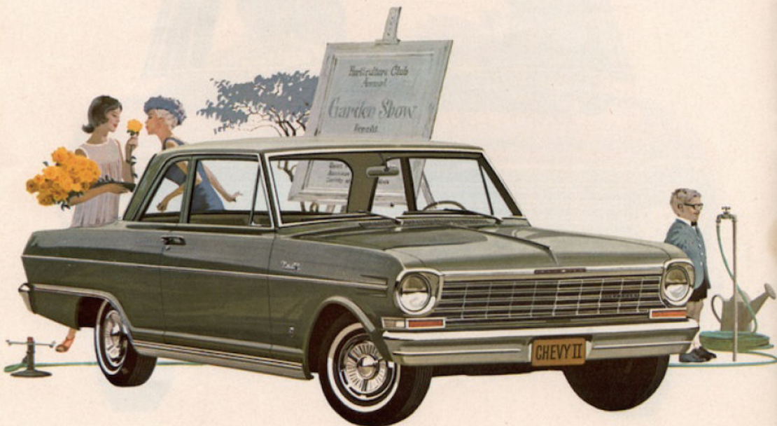
Nova 2-Door Sedan in Meadow Green.