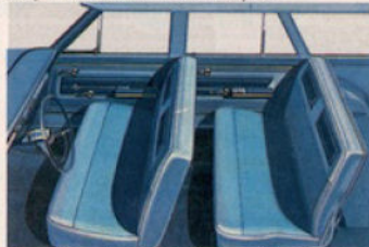
Nova 1-Door 6-Passenger Station Wagon interior in blue.