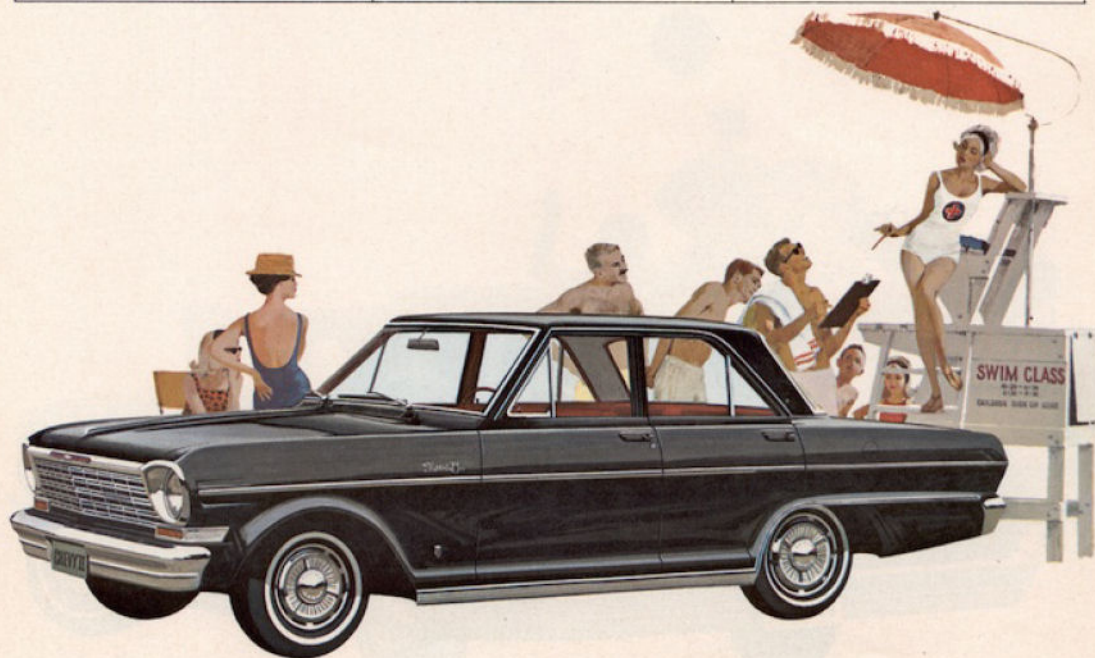
Nova 1-Door Sedan in Tuxedo Black. Optional wheel covers* shown on all Nova models.