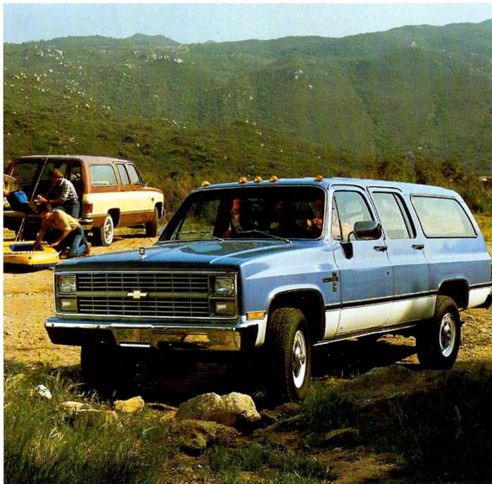
K20 Suburban Silverado in Light Blue Metallic and Frost White.

People and cargo choices. With its optional second and third seats, the Suburban moves up to nine people with plenty of leg and elbow room.