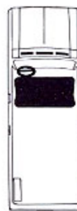
Suburban with standard front seat.

The Suburban's available 4-wheel drive system features automatic locking front hubs. Even with 4WD, the Suburban's entry height is a convenient 21.6 to 23.6 inches, depending on model, with over a full 7.0 inches of ground clearance.