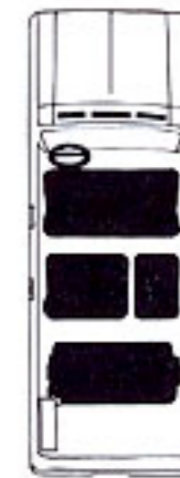
Optional second and third seat for nine-passenger seating.