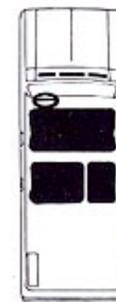
Optional second seat added.