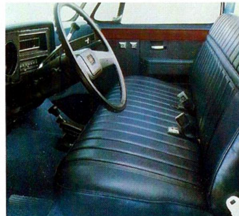
Scottsdale interior shown in Blue.