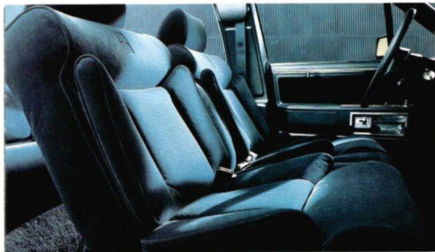
Town Car Signature Series in Dark Shadow Blue Clearcoat Metallic. Interior in Shadow Blue cloth. Some features shown may be optional.

There's only one small problem with demanding this kind of luxury, style, room and comfort in an automobile. It limits your choices to just one car. The 1988 Lincoln Town Car.