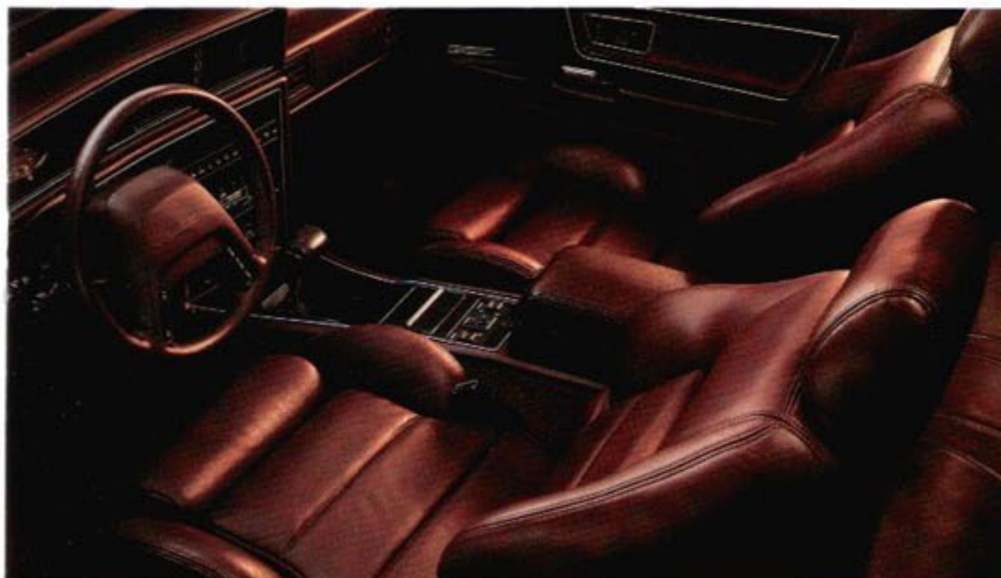
Mark VII LSC in Dark Cabernet Clearcoat Metallic. Interior in Cabernet leather. Some features shown may be optional.

Lincoln Mark VII LSC. The performance of a sports coupe. The luxury of a Lincoln.