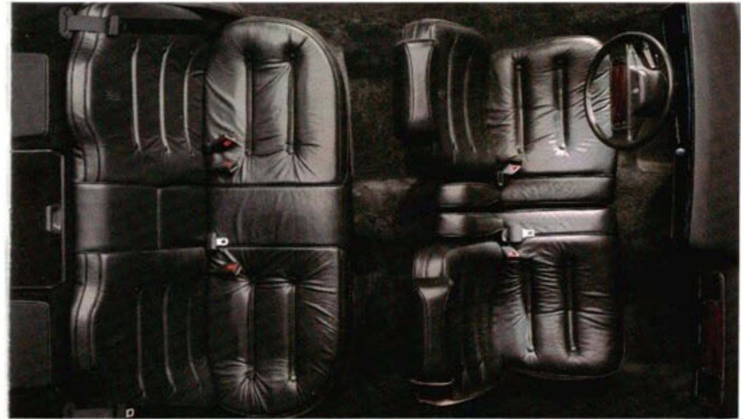
Continental Signature Series in Midnight Black Clearcoat. Interior in Titanium leather. Some features shown may be optional.