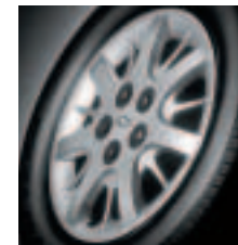
16" DELUXE BOLT-ON COVERS. STANDARD ON LS.