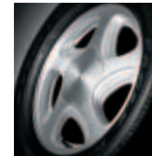
16" SPORT CAST-ALUMINUM. STANDARD ON SS.