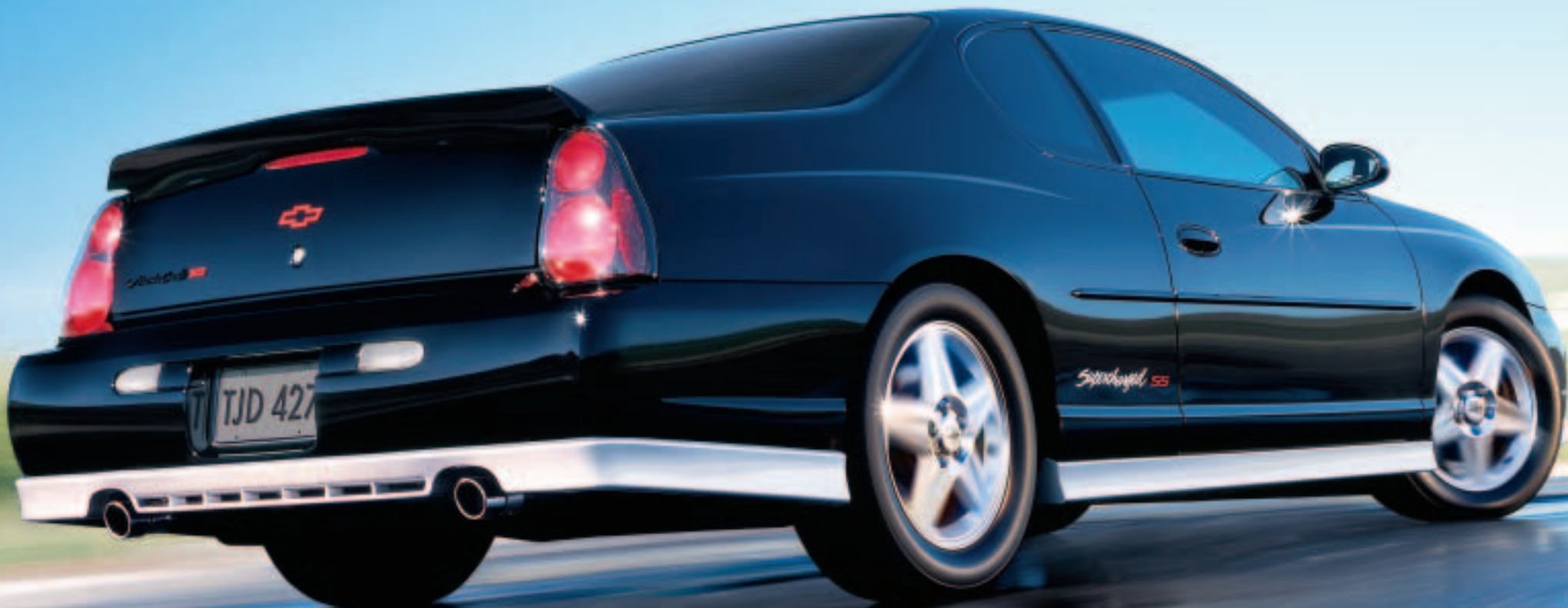
Monte Carlo Supercharged SS shown in Black with Galaxy Silver ground effects. Limited availability.

2004 Chevy Monte Carlo Spacious, seductive, powerful. That's the attitude of every sculpted inch of Chevy™ Monte Carlo.® LS or SS, you get the largest interior in its class.* If it's performance you crave, the Supercharged SS is sure to satisfy, thanks to a healthy 240 horses, 280 lb.-ft. of torque and a Performance suspension that lets you feel the exhilaration. Commutes never felt so good.