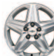
17" DIAMOND-CUT CAST-ALUMINUM. STANDARD ON MONTE CARLO SUPERCHARGED SS.