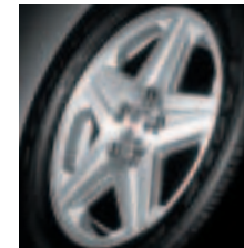
16" DIAMOND-CUT CAST-ALUMINUM. INCLUDED WITH LS AND SS SPORT APPEARANCE PACKAGES AND WINNER'S CIRCLE APPEARANCE AND LS COMPETITION YELLOW SPORT APPEARANCE PACKAGE.