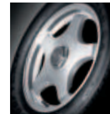
16" FIVE-SPOKE-STYLED CAST-ALUMINUM. OPTIONAL ON LS.