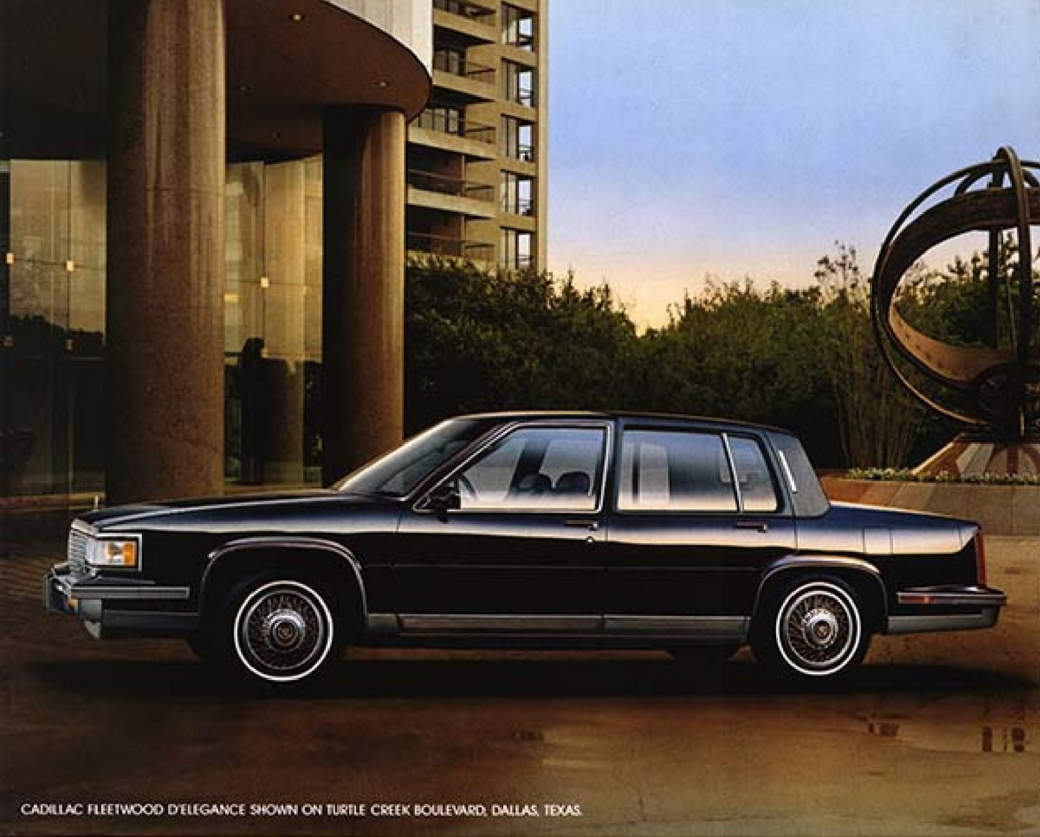
CADILLAC FLEETWOOD D'ELEGANCE SHOWN ON TURTLE CREEK BOULEVARD, DALLAS, TEXAS.

The Fleetwood name has always been reserved for very special Cadillacs like this.