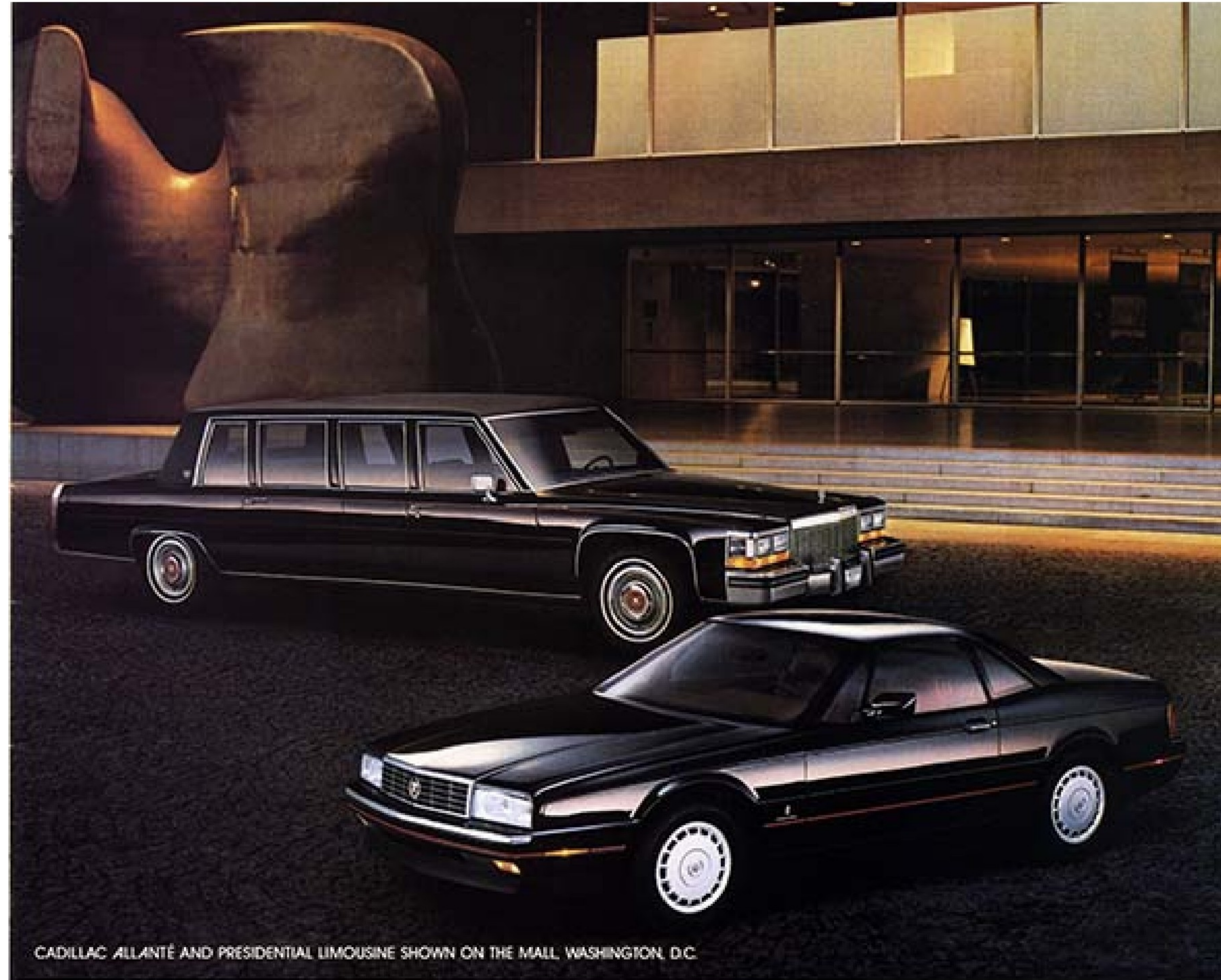
CADILLAC ALLANTÉ AND PRESIDENTIAL LIMOUSINE SHOWN ON THE MALL, WASHINGTON, D.C.

Cadillac, America's luxury car leader for 39 consecutive years, is proud to present the 1988 Cadillacs in distinctive American locales.