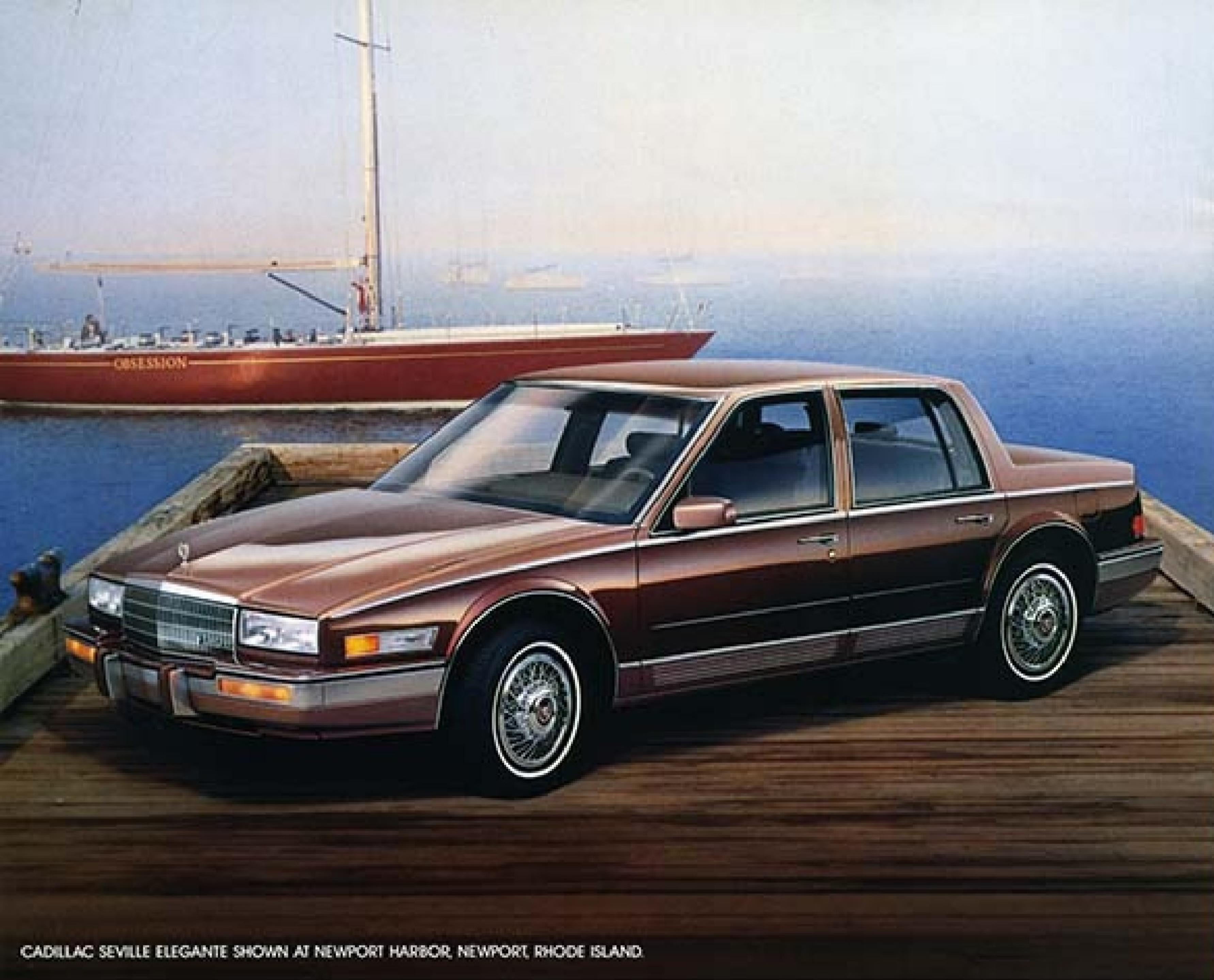
CADILLAC SEVILLE ELEGANTE SHOWN AT NEWPORT HARBOR, NEWPORT, RHODE ISLAND.

In this, the age of the luxury sedan, Seville has carved out its own niche by bringing together sophisticated styling, refined performance and renowned comfort in the most elegant of Cadillac's four-door automobiles.