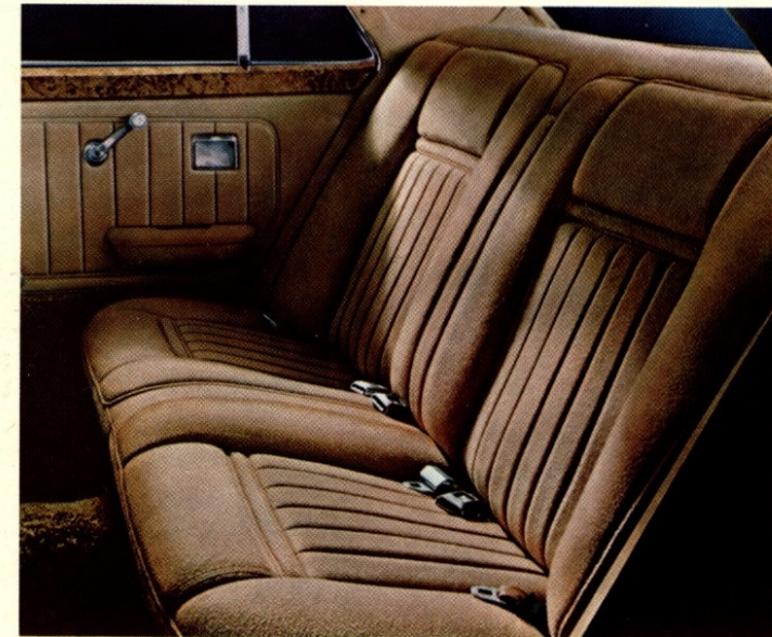
Mercury Monarch's rear contoured seats offer passengers rewarding comfort together with plush luxury.

Seldom has such a high level of interior luxury been presented in a car of such precision size. Monarch Ghia's seats are deeply contoured; the front seat backs individually reclinable. In front, you settle back in deep, glove-soft bucket seats with extra thickness and foam padding to cushion you in long distance comfort. Underfoot is thick shag carpeting. Instrument panel registers afford "comfort control" ventilation as you drive. Handsomely set off against vinyl woodgrain, instruments and digital clock are positioned for ideal visibility. Rear door hinges are canted to permit graceful entry and exit. Note the handsome detailing of map pockets, assist handles, grab bars and deep-padded door panels with large, cushioned armrests — all engineered with your comfort in mind.