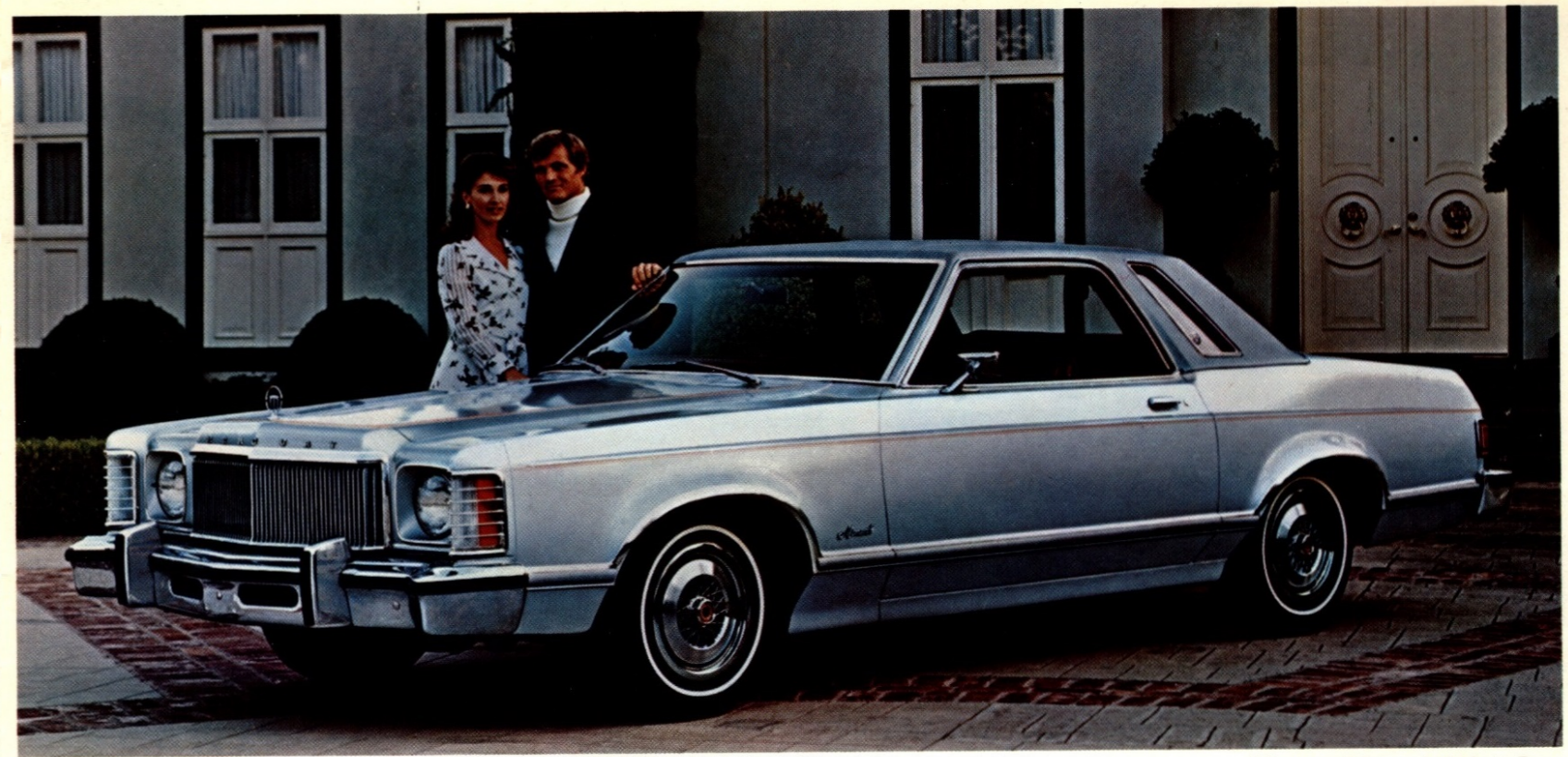
Mercury Monarch Ghia 2-Door

250-IV "Six" engine • 3-speed manual transmission • Front disc brakes • Solid-state ignition • High-level ventilation • Inside hood release • Foot-operated parking brake • WSW steel-belted radial tires • Odense grain bodyside molding • Energy absorbing bumper system with front and rear bumper guards • Articulated windshield wipers • Deluxe sound and ride package • Dual note horn • Digital clock • Luxury steering wheel • Day/night interior mirror • 22-oz. cut-pile carpeting • Left-hand remote control outside mirror • Odense grain vinyl roof • Unique Ghia wheel covers • Deluxe colour-keyed seat belts • Carpeted luggage compartment • Ford Motor Company Safety Design Features.