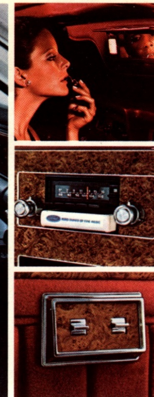
Options shown: illuminated visor vanity mirror, AM/FM stereo radio with tape, power windows and power glass moonroof.