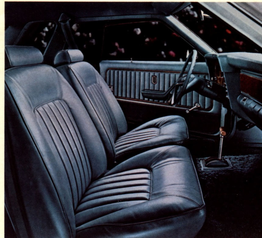
Mercury Monarch standard interior with optional floor mounted shift.

instrument panel with high-gloss vinyl woodgrain, there is a look of rich luxury about this interior (shown right). Individually reclinable bucket seats are upholstered in supple vinyl, available in black, dark red, silver blue, green and tan. A Decor Option is also available in super-soft vinyl seat trim with map pocket and assist rails. This interior includes 22-oz. cut-pile shag carpeting, luxury steering wheel and day/night mirror.