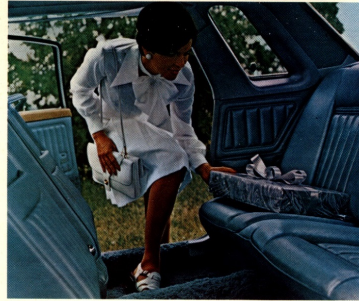
The Mercury Monarch 2-Door Sedan affords remarkable ease of entry and exit, this is a luxury touch unusual in a car of this size.