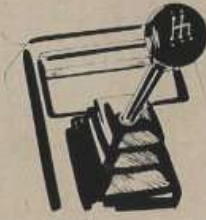
4-Speed Manual Transmission