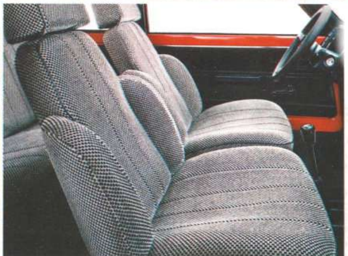
Vehicles illustrated with optional extras: Air conditioning not available in Canada. Bio-formed reclining seats form part of the new, optional Sport Package (GTL only).