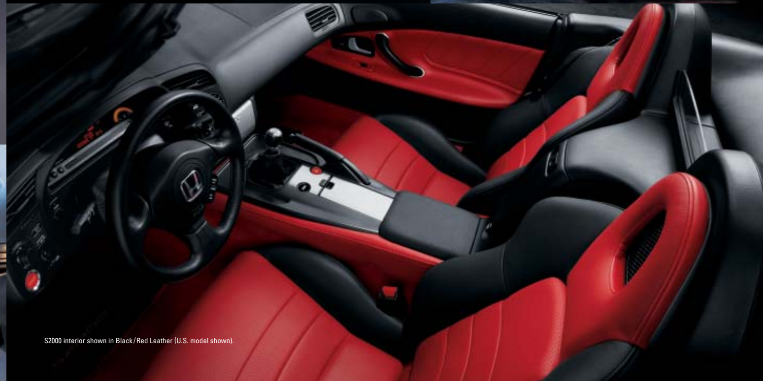
S2000 interior shown in Black/Red Leather (U.S. model shown).