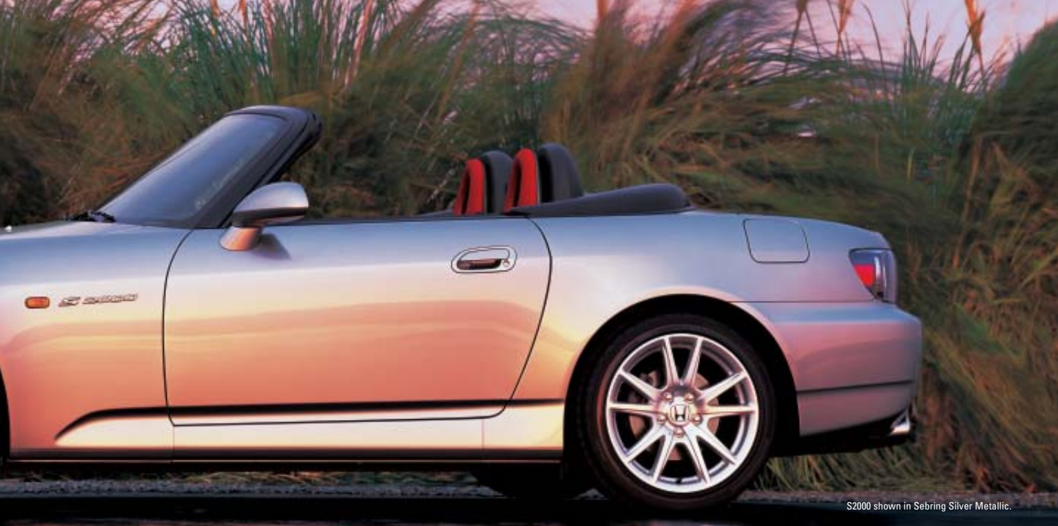
S2000 shown in Sebring Silver Metallic.