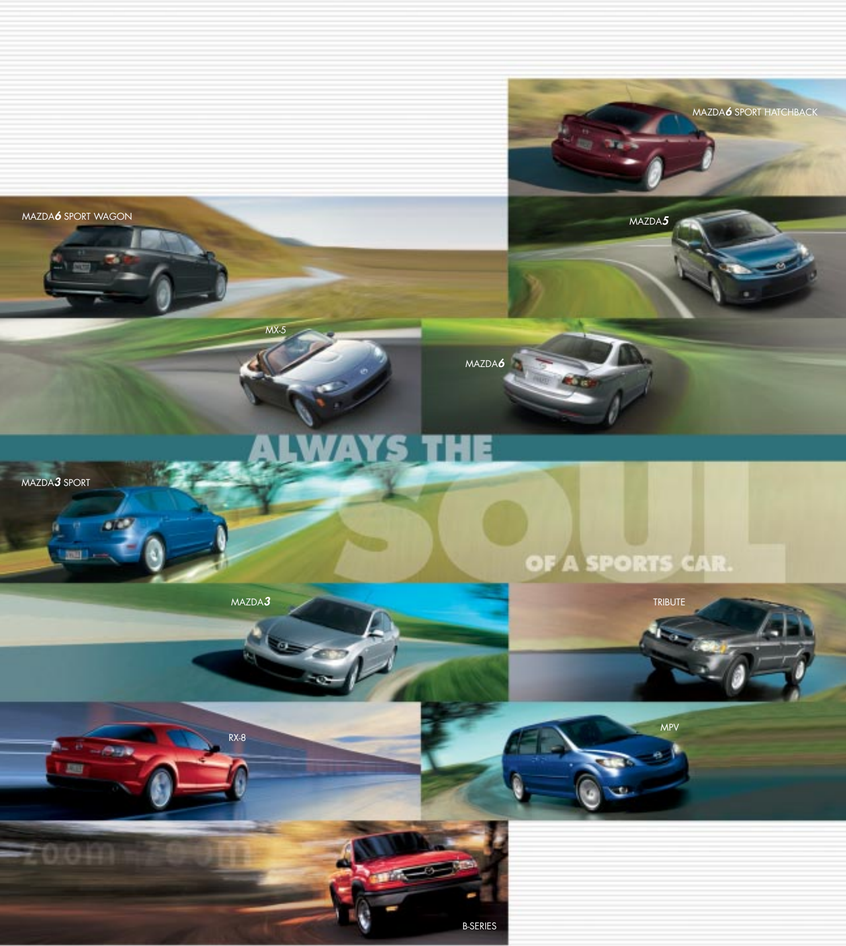
MAZDA6 SPORT WAGON