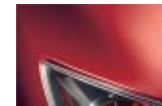
VELOCITY RED MICA