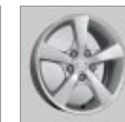
16" alloy wheels