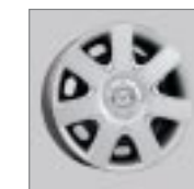
15" steel wheels