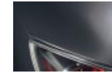
CARBON GREY MICA