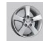
15" alloy wheels