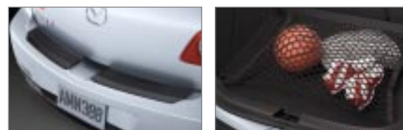
Pictured above from left to right: Rear bumper step plate, cargo net.