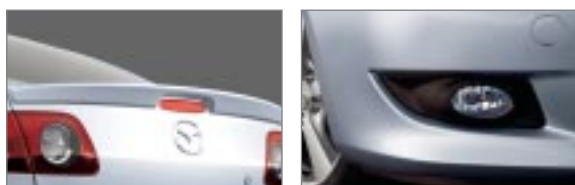
Pictured above from left to right: Rear lip spoiler, fog lights.