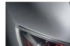
TITANIUM GREY METALLIC