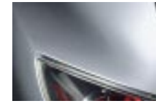
SUNLIGHT SILVER MICA