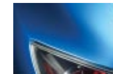
WINNING BLUE MICA