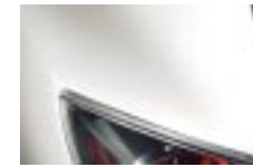
SNOW FLAKE WHITE PEARL