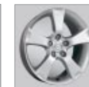
17" alloy wheels