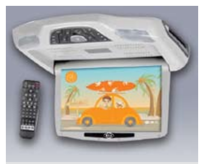
10" DVD Entertainment System