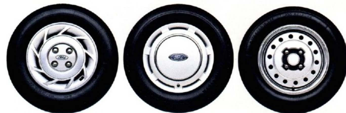
◀ Left to right: Polycast wheels (optional with LX); luxury wheel covers (optional with LX, included with LX Special Value Packages); semi-styled steel wheels (standard with Pony and LX).