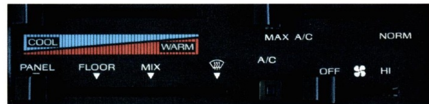
◀ Air conditioning is optional with all series (not available with Pony) and is included with the optional GT Special Value Package.