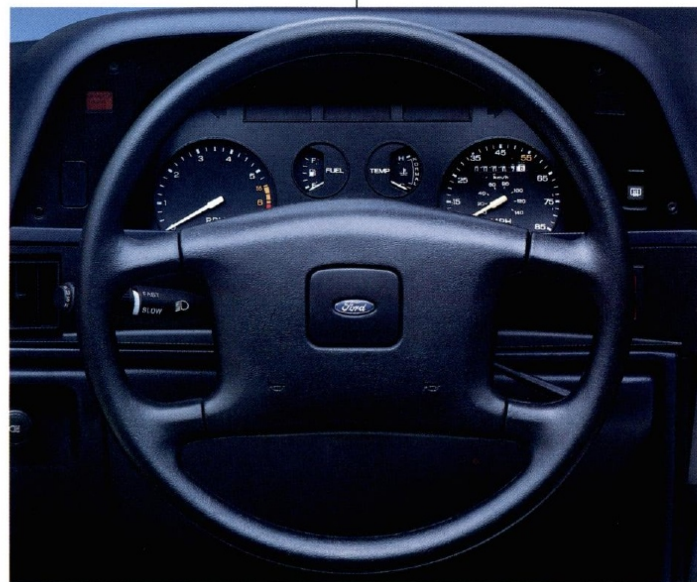
▲ Above and at right: Escort LX with the optional Automatic Transaxle Special Value Package in Regatta Blue trim. It includes the instrumentation group and other desirable equipment at an attractive discount. (Tilt steering wheel is part of the package in some states, optional in others. See your dealer.) Also shown is the optional splitfold rear seat.

Ventilation is essential to comfort. Escort's power ventilation system has four blower speeds to regulate heating and cooling through vents located under and in the instrument panel. Demisters help keep the side windows clear.