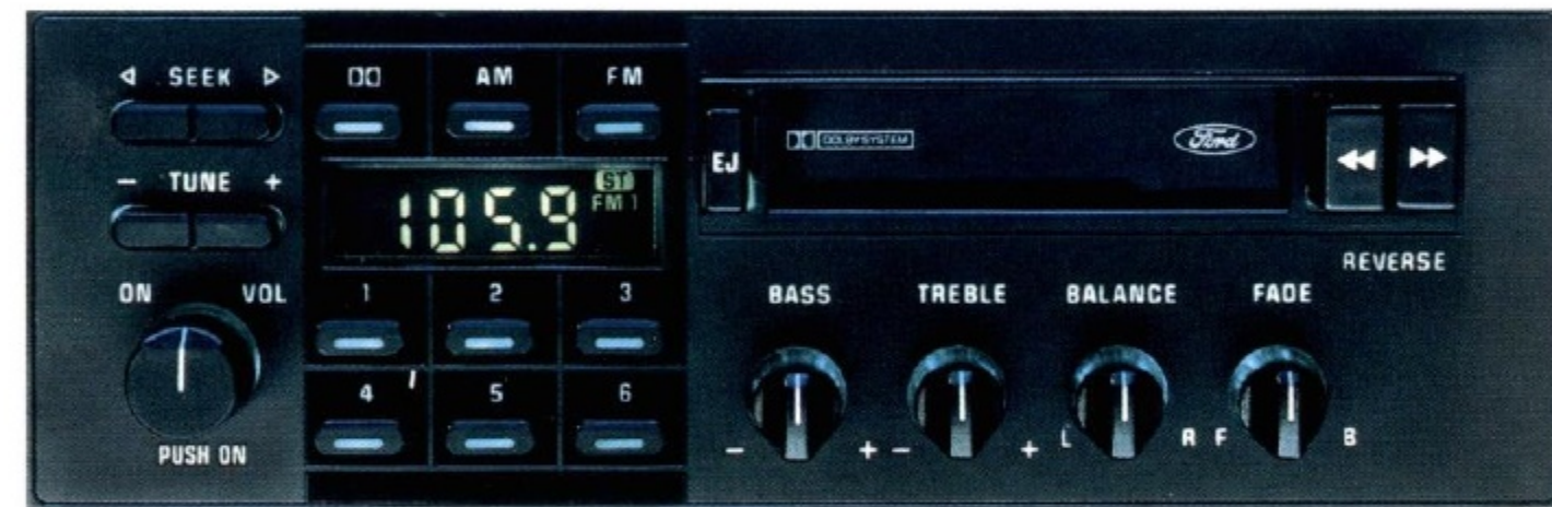
◀ The AM/FM stereo radio with cassette tape player, a popular option, is included in the optional Escort GT Special Value Package.

All Special Value Packages are listed in detail on page 13. Package content may vary slightly in some parts of the country. Your dealer can verify package content.