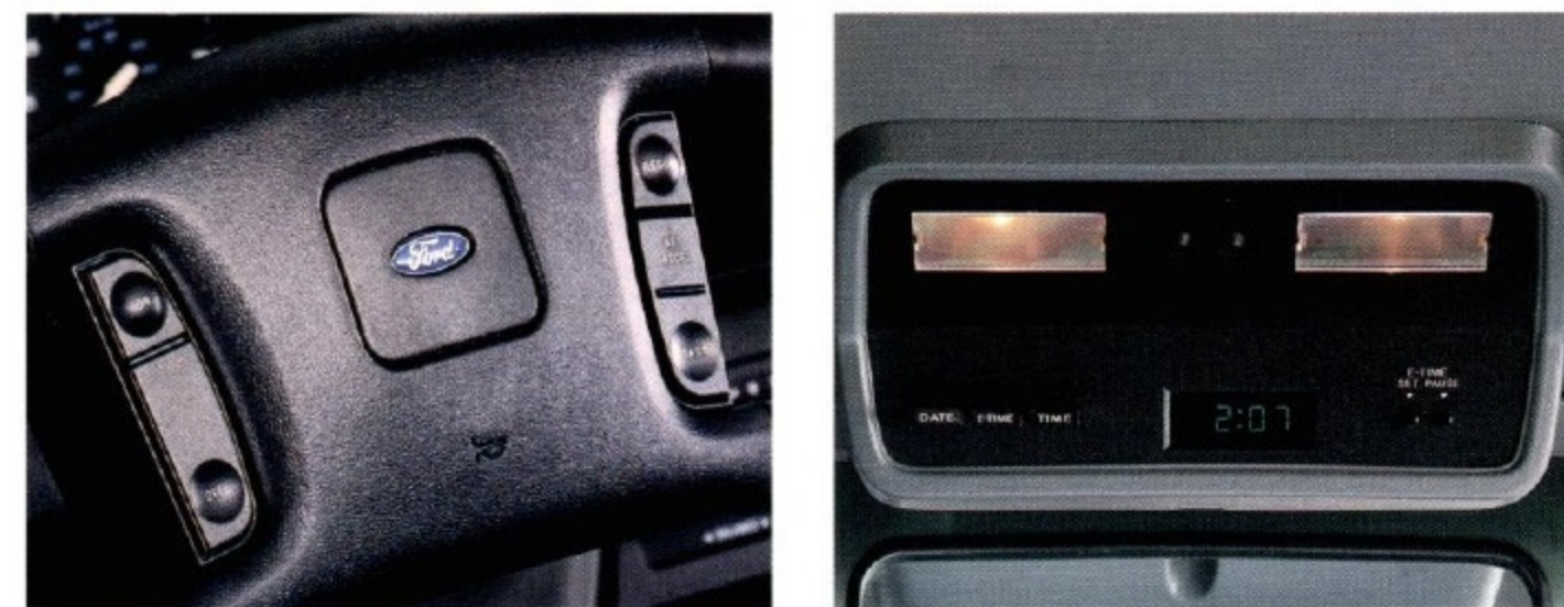
◀ Speed control is especially useful for those who do highway or freeway driving. It's optional with LX and included with the optional GT Special Value Package.