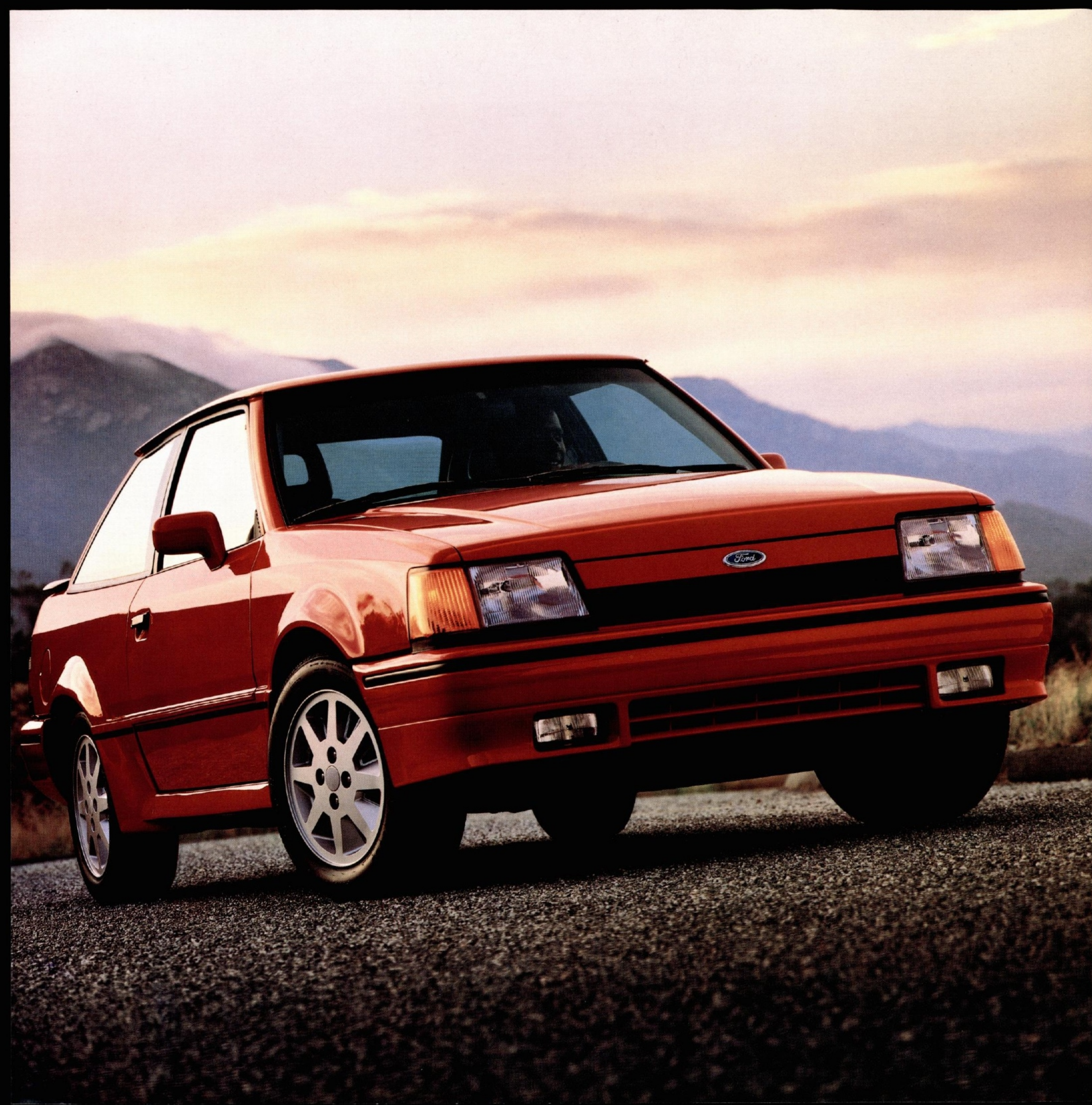
► Escort GT's suspension system includes tight-handling components—a big part of GT driving enjoyment. Shown in Bright Red.

GT's rear seat is the split/fold-down type which gives the hatch area flexibility for both passenger and cargo capability. The hatch can be opened by remote control by means of a button located inside the glove box.