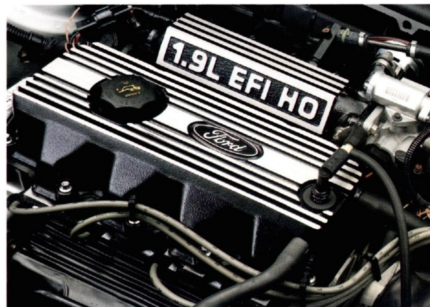
▲ The interior above includes the optional GT Special Value Package, which offers a group of desirable options at an attractive discount.