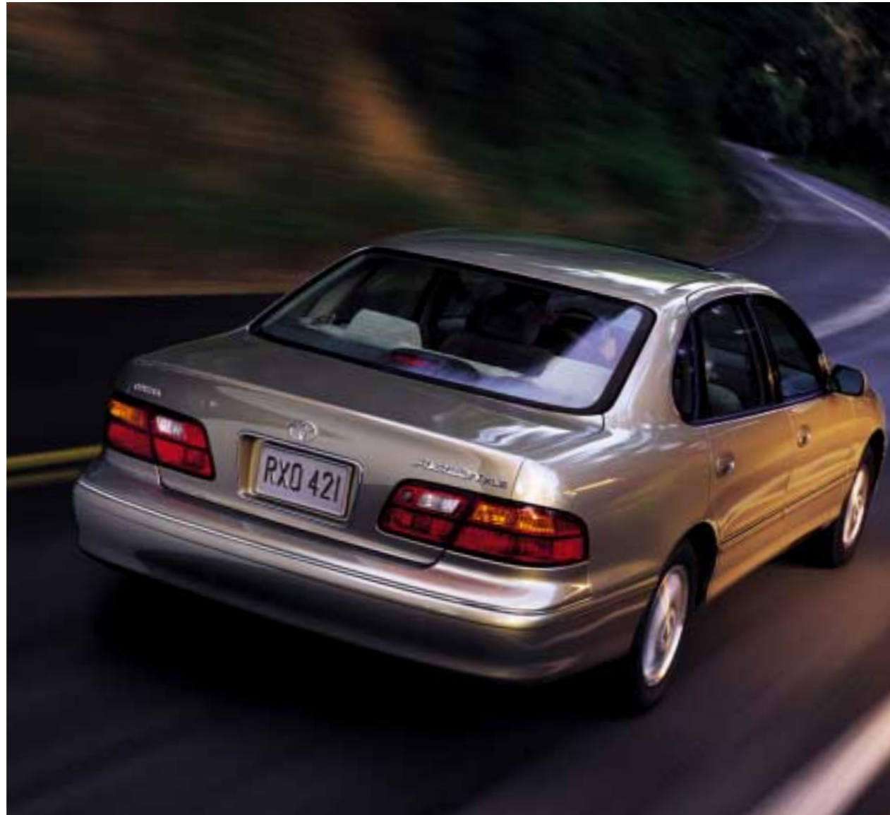
Toyota Avalon XLS Shown in Sable Pearl with Optional Equipment