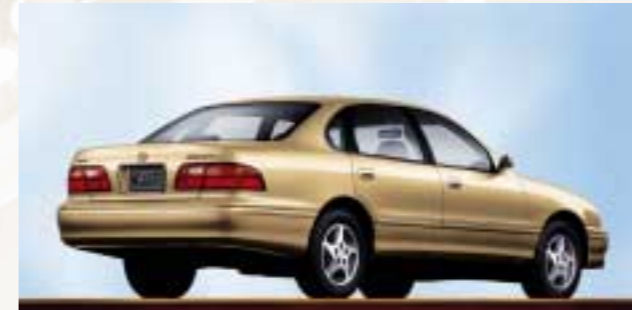
Toyota Avalon XLS Shown in Desert Sand Metallic (Optional Equipment Shown)