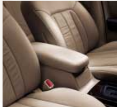
Avalon's Centre Console Provides Convenient Storage of Small Items