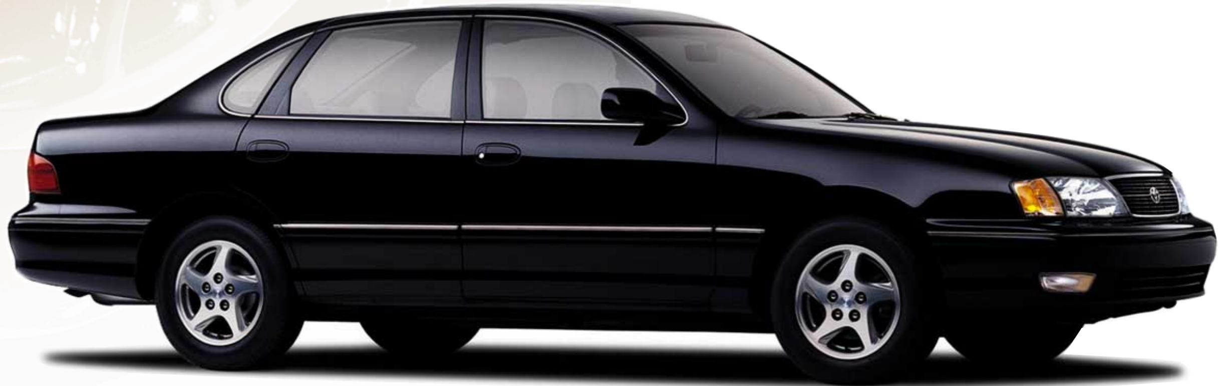
Avalon XLS Shown in Black with Optional Equipment

The 1998 Avalon XLS is Toyota's flagship – sophisticated in concept, design and detailing. Avalon's clean lines flow from the striking headlamps and grille to the sculpted rear quarters.