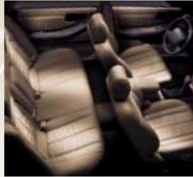
Avalon's Spacious and Luxurious Interior (XLS Shown with Optional Leather)

Avalon XL and XLS are the ideal choice with room for five and exceptional comfort and roominess. An extensive equipment list includes power front bucket seats, air conditioning, cruise control, power windows, power door locks, heated power mirrors and a premium 7-speaker AM/FM cassette. XLS ups the ante further with auto climate control, compact disc player, "Soft Touch" heating/ventilation controls, outside temperature gauge, plus a theft deterrent system with engine immobilizer and keyless entry. The driver and front passenger airbags are complemented by seatbelt pretensioners/force limiters, new for '98. Avalon's generous leg/shoulder room and plush seat fabrics complete the comfortable cabin.