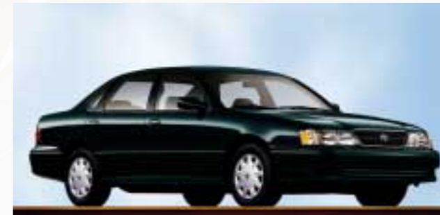
Toyota Avalon XL Shown in Jewel Green Pearl