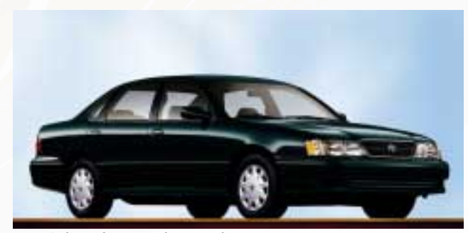
Toyota Avalon XL Shown in Jewel Green Pearl