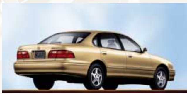
Toyota Avalon XLS Shown in Desert Sand Metallic (Optional Equipment Shown)