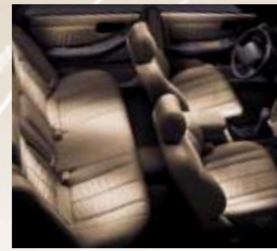
Avalon's Spacious and Luxurious Interior (XLS Shown with Optional Leather)

Avalon XL and XLS are the ideal choice with room for five and exceptional comfort and roominess. An extensive equipment list includes power front bucket seats, air conditioning, cruise control, power windows, power door locks, heated power mirrors and a premium 7-speaker AM/FM cassette. XLS ups the ante further with auto climate control, compact disc player, "Soft Touch" heating/ventilation controls, outside temperature gauge, plus a theft deterrent system with engine immobilizer and keyless entry. The driver and front passenger airbags are complemented by seatbelt pretensioners/force limiters, new for '98. Avalon's generous leg/shoulder room and plush seat fabrics complete the comfortable cabin.