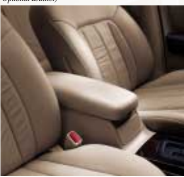
Avalon's Centre Console Provides Convenient Storage of Small Items