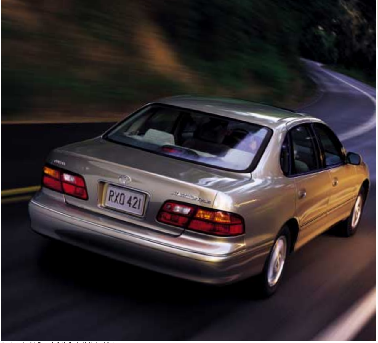
Toyota Avalon XLS Shown in Sable Pearl with Optional Equipment