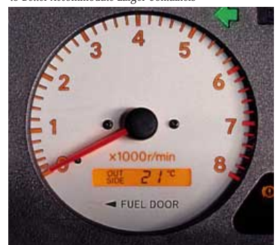
VE Optional Touring Package Includes an Outside Temperature Gauge, Tachometer and Black On White Instrumentation