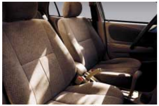
Enjoy the Ambience of Corolla CE's Roomy and Comfortable Interior

In a class of cars that sees mostly compromise, the new Corolla CE truly shines. Elegantly appointed and extremely well equipped, it comes with many of the standard features that make driving more comfortable and pleasant. Inside, the Corolla CE's interior is covered in a finely woven fabric. A tilt steering column adjusts to suit your individual comfort level and as you drive, you will be entertained by an AM/FM cassette with four strategically placed speakers. From it's convenient 60/40 split and fold-down rear seat and power door locks to its remote-controlled mirrors, the Corolla CE will impress you with its outstanding quality and exceptional refinement.