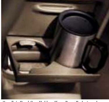
Corolla's Dual Cup Holders Have Been Redesigned to Better Accommodate Larger Containers