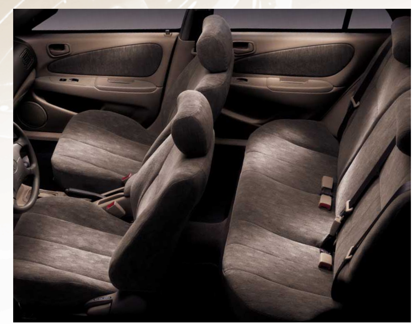
Corolla LE's Spacious and Comfortable Interior, Shown in Bone