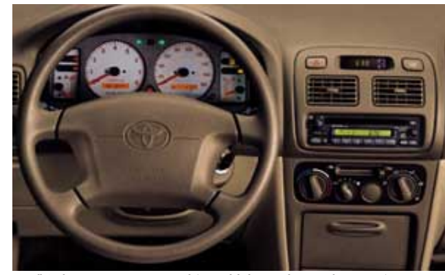
Corolla's Elegant New Instrument Panel (VE Model Shown with Optional Equipment)