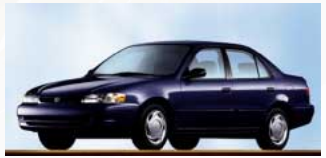
Toyota Corolla CE Shown in Brilliant Blue Pearl