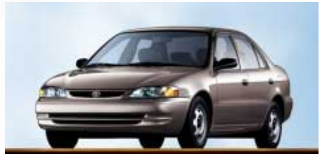
Toyota Corolla VE Shown in Sandrift Metallic