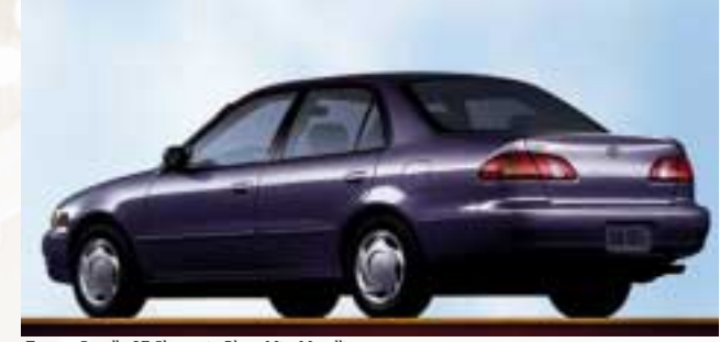
Toyota Corolla LE Shown in Plum Mist Metallic

Over 30 years ago, the first Corolla rolled off the assembly line and into the hearts and minds of North American drivers. Since then over 21 million Corollas have been sold worldwide. 100% of all Corollas sold in Canada are assembled in Canada, using Toyota's world-renowned production methods. Today, Corolla is recognized everywhere as the most trusted nameplate in automotive history. It's a proud legacy. And now there's an all new Corolla to carry it confidently into the future. Sleeker and more aerodynamic than ever before, it's the culmination of three decades of continuous engineering refinement as well as Toyota's dedication to quality, dependability and reliability. The all new 1998 Toyota Corolla. Available in three value-packed models – Corolla LE, CE and VE.