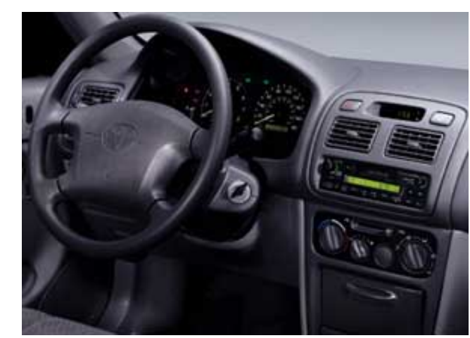
Corolla's Beautifully Formed and Functional Cockpit (CE Model Shown with Optional Equipment)