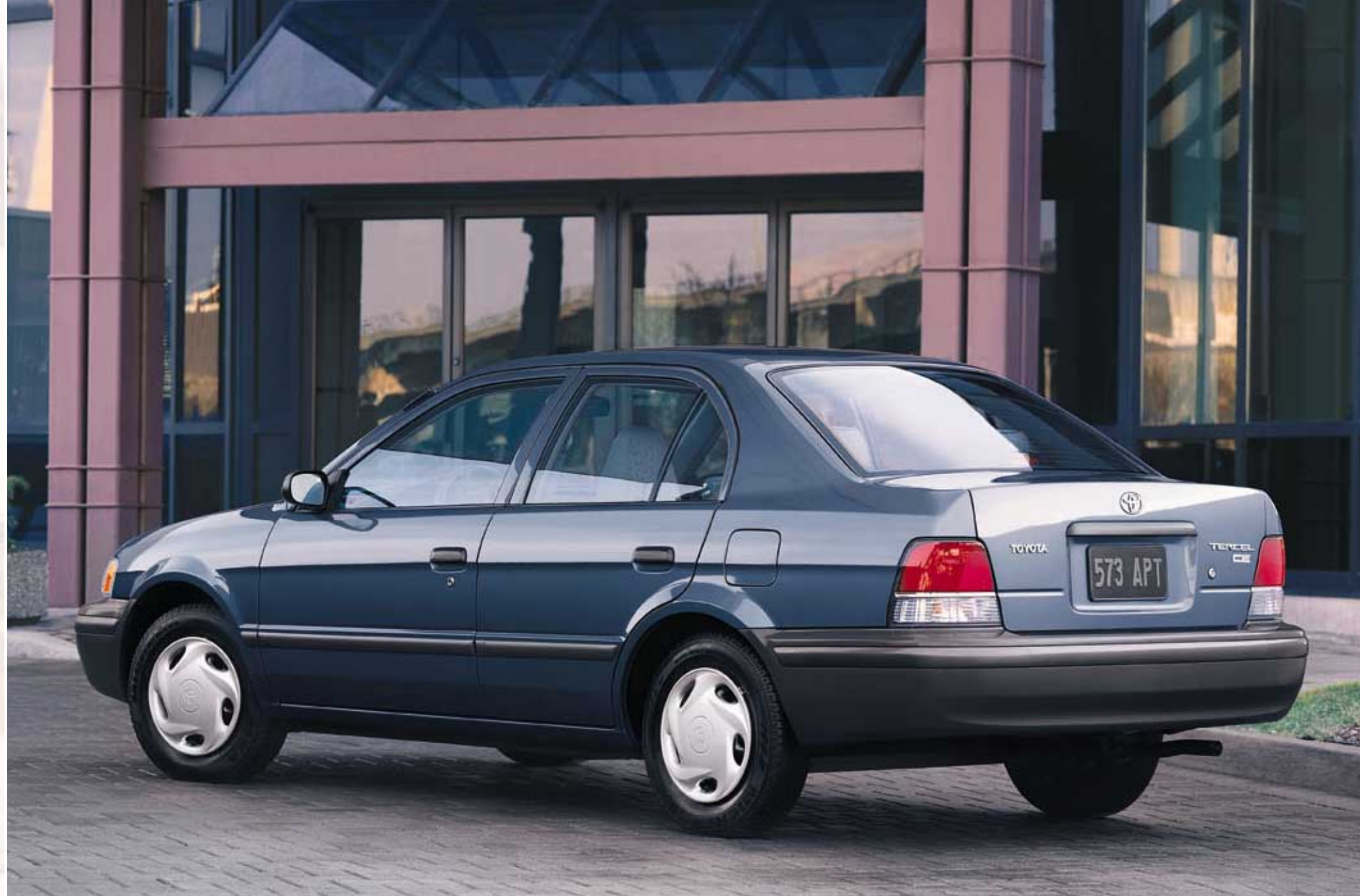
Tercel 4-Door CE shown in Vista Blue Mica with optional equipment