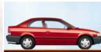
TERCEL 2-DOOR CE

Tercel delivers all the power you want, protects you with advanced safety features and offers enough space in its roomy interior to seat five in comfort.