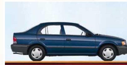
TERCEL 4-DOOR CE

The clean, aerodynamic design gives Tercel CE a distinctive, sporty presence and an exciting sense of motion and speed. Comfortable five-passenger seating and a quiet, roomy interior. A fun-to-drive feeling comes from a responsive 1.5 Litre DOHC 16-valve 4-cylinder engine that produces 93 horsepower with outstanding fuel economy. The user-friendly instrument panel places all gauges and controls in an open design that's easy to see and use. The 1999 Tercel is our most affordable sedan and its performance and practicality make this Toyota an exceptional value. But you can expect and deserve a lot for your money.