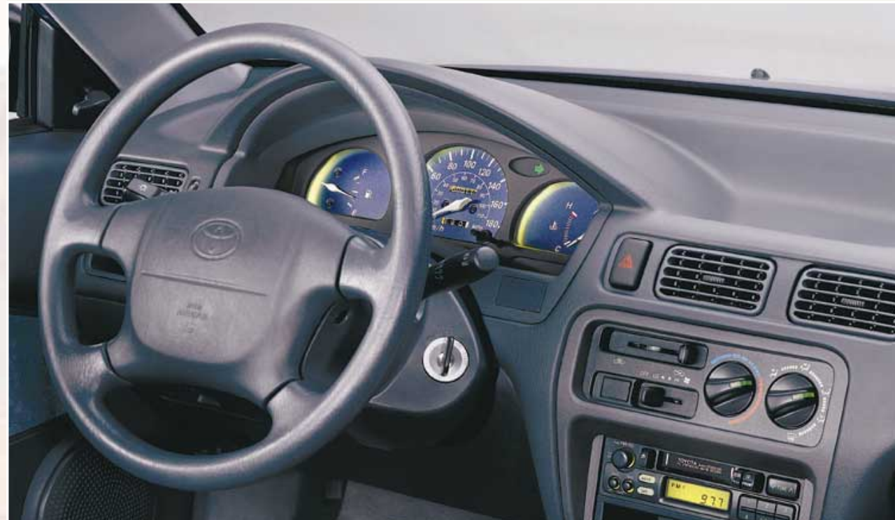
4-Door CE interior shown in Grey (optional equipment shown)

The driver front seatbelt is equipped with a pretensioner that includes a force limiter. In a frontal collision, the pretensioner immediately reduces slack in the seatbelt, helping reduce