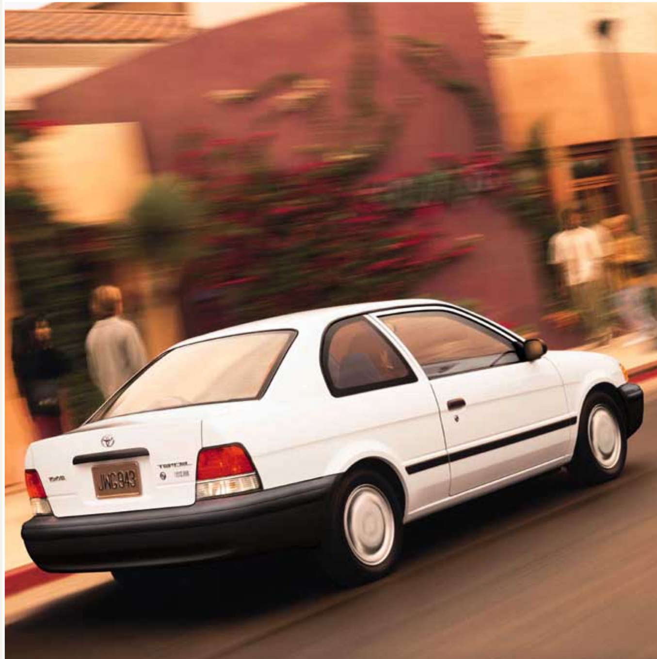
Tercel 2-Door CE shown in Alpine White with optional equipment