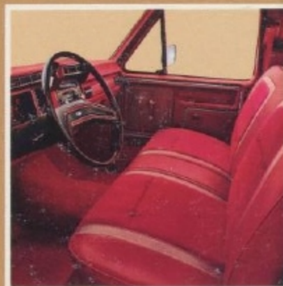
RANGER LARIAT INTERIOR with optional AM/FM stereo radio and air conditioning.