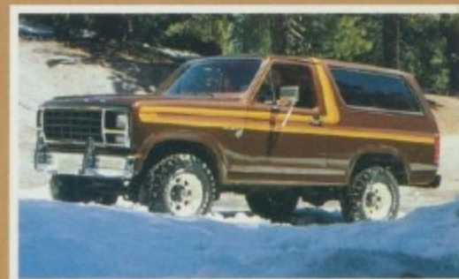
TRICOLOR TAPE STRIPE