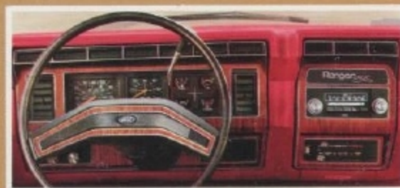
RANGER LARIAT INSTRUMENT PANEL with optional Sports Instrumentation (including tachometer, trip odometer and gauges), AM/FM stereo and air conditioning.

(The Ranger Lariat shown above is an F-150 4x4 with optional Protection Group, low-mount western mirrors, 5-slot aluminum wheels, RWL on/off road tires, rear bumper and Deluxe Tu-Tone—that deletes Lariat tape stripe.)