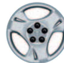
15" Custom-painted wheel covers. Standard on 1SV, 1SA, 1SB.