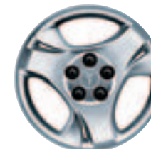
15" Custom wheel covers with bright chrome finish. Available on 1SB.