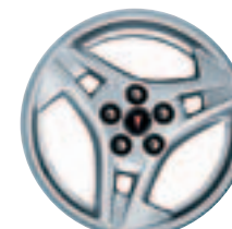
15" Cast-aluminum. Standard on 1SC. Available on 1SB.