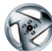
16" Chrome Tech aluminum with bright chrome finish. Included and only available with Sport Appearance Package. Available on 1SB, 1SC.