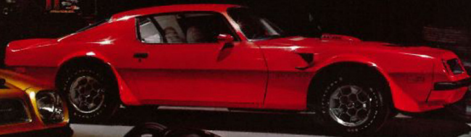
Firebird Trans Am in Buccaneer Red.