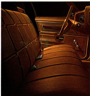
Morrokide upholstered full bench seat. Shown in saddle—also available in blue, green and burgundy.