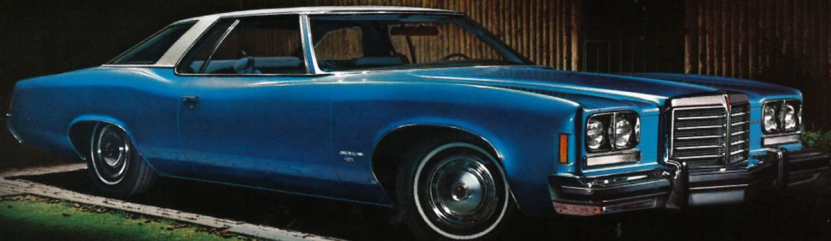
Catalina Hardtop Coupe in Regatta Blue.