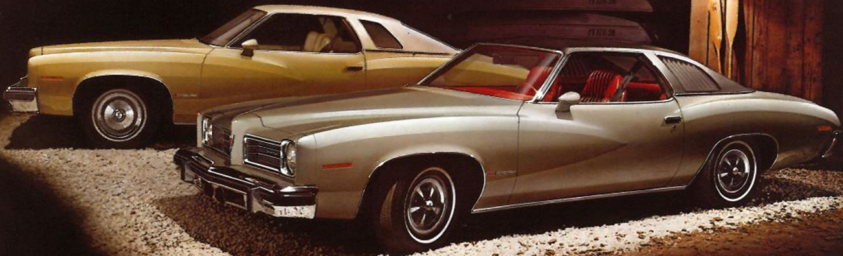
LeMans Sport Coupe 2-Door Colonnade Hardtop in Colonial Gold. Shown with available formal window and Cordova top.