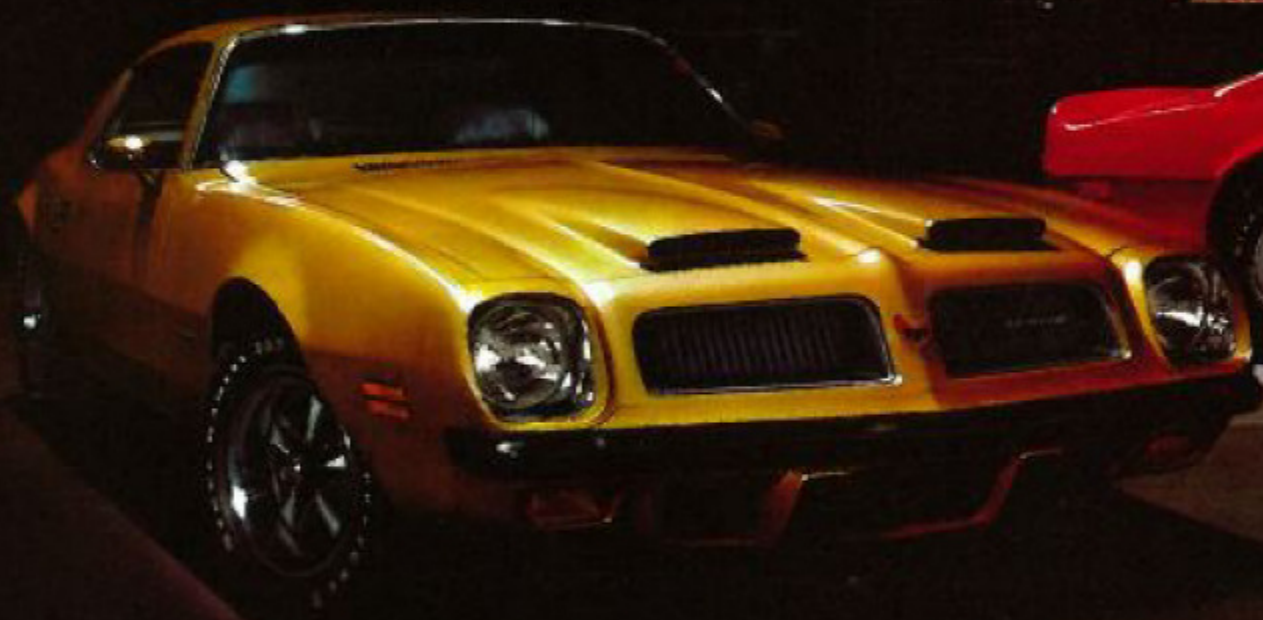
Formula Firebird in Denver Gold.