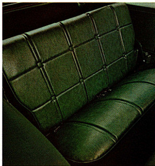
Catalina Safari's forward-facing third seat. Shown in green—also available in blue, saddle and burgundy.

The '74 Catalina Safari is our lowest priced, full-sized wagon. But that doesn't mean you're getting anything less than you'd expect in a Pontiac.