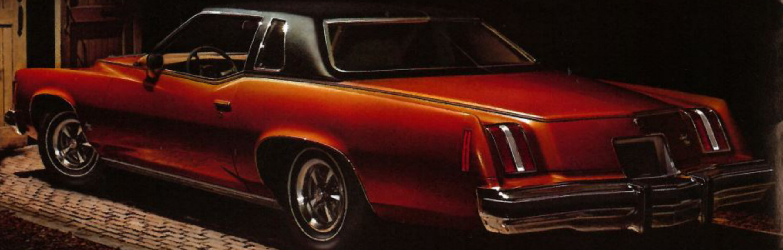
Grand Prix Hardtop Coupe in Fire Coral Bronze.