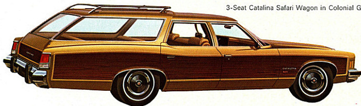
3-Seat Catalina Safari Wagon in Colonial Gold.

Since our 2- and 3-Seat Safaris already come with so many standard features, you can afford to add a few available options. Like trailer-towing equipment. Air conditioning. Or stereo equipment. To help make your Catalina Safari everything you've ever wanted in a wagon.