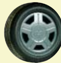
15" Steel with cover

EVERY WINDSTAR COMES WITH A 3.8L SPI V6. PLENTY OF POWER TO HAUL YOUR STUFF AROUND AND PLENTY OF ZIP TO GET AROUND SLUGGISH TRAFFIC.