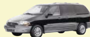
WINDSTAR LIMITED IN BLACK CLEARCOAT