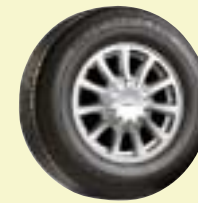
15" 11-Spoke Aluminum