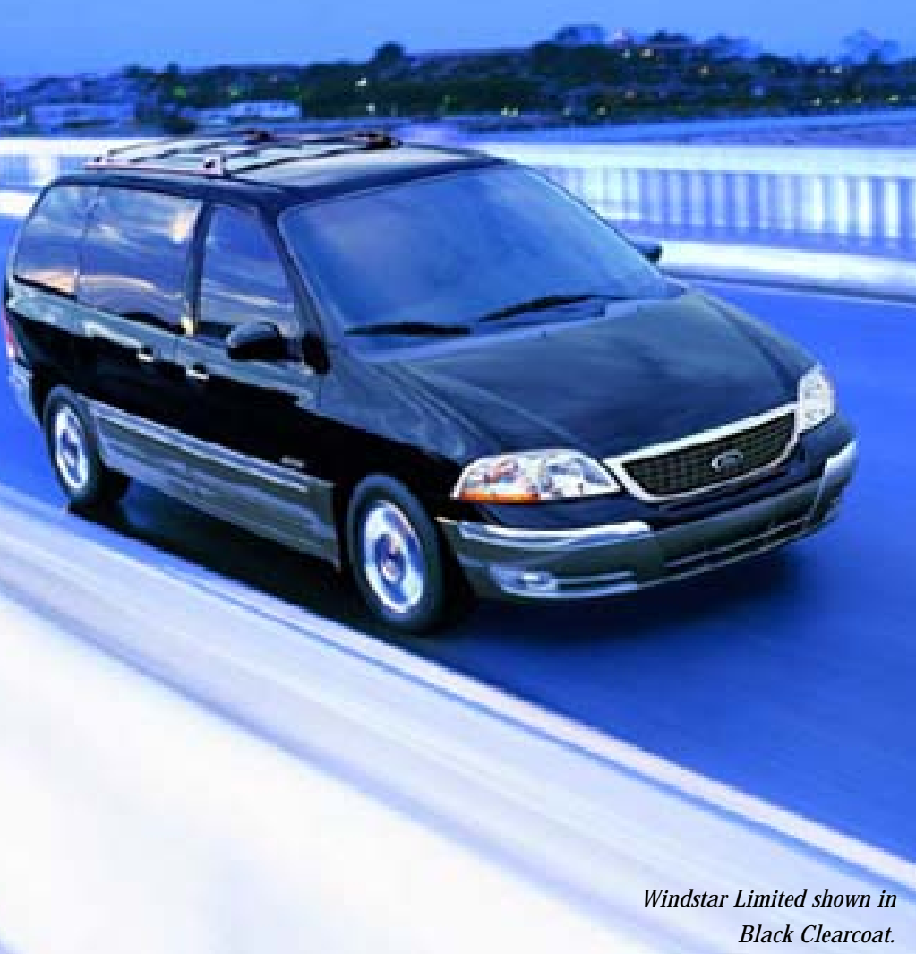
Windstar Limited shown in Black Clearcoat.

Much like you, it manages to pack more in a day.