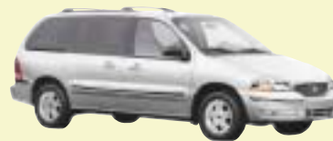
WINDSTAR SE IN VIBRANT WHITE CLEARCOAT METALLIC

*See your Ford dealer for two-tone color combinations and interior trim selection. Vehicles shown may include optional equipment.