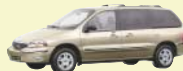
WINDSTAR SE IN HARVEST GOLD CLEARCOAT METALLIC