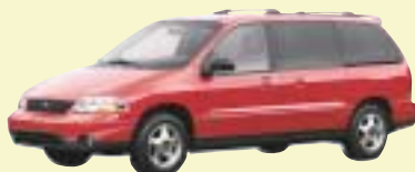
WINDSTAR SE SPORT IN BRIGHT RED CLEARCOAT