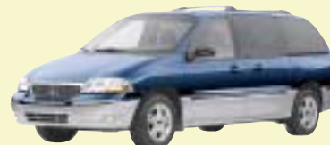
WINDSTAR SEL IN MEDIUM ROYAL BLUE CLEARCOAT METALLIC