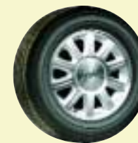
16" 10-Spoke Brushed Aluminum