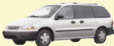
WINDSTAR LX 4-DOOR IN SILVER FROST CLEARCOAT METALLIC