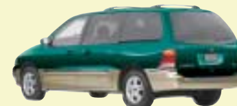
WINDSTAR SEL IN DEEP EMERALD GREEN CLEARCOAT METALLIC