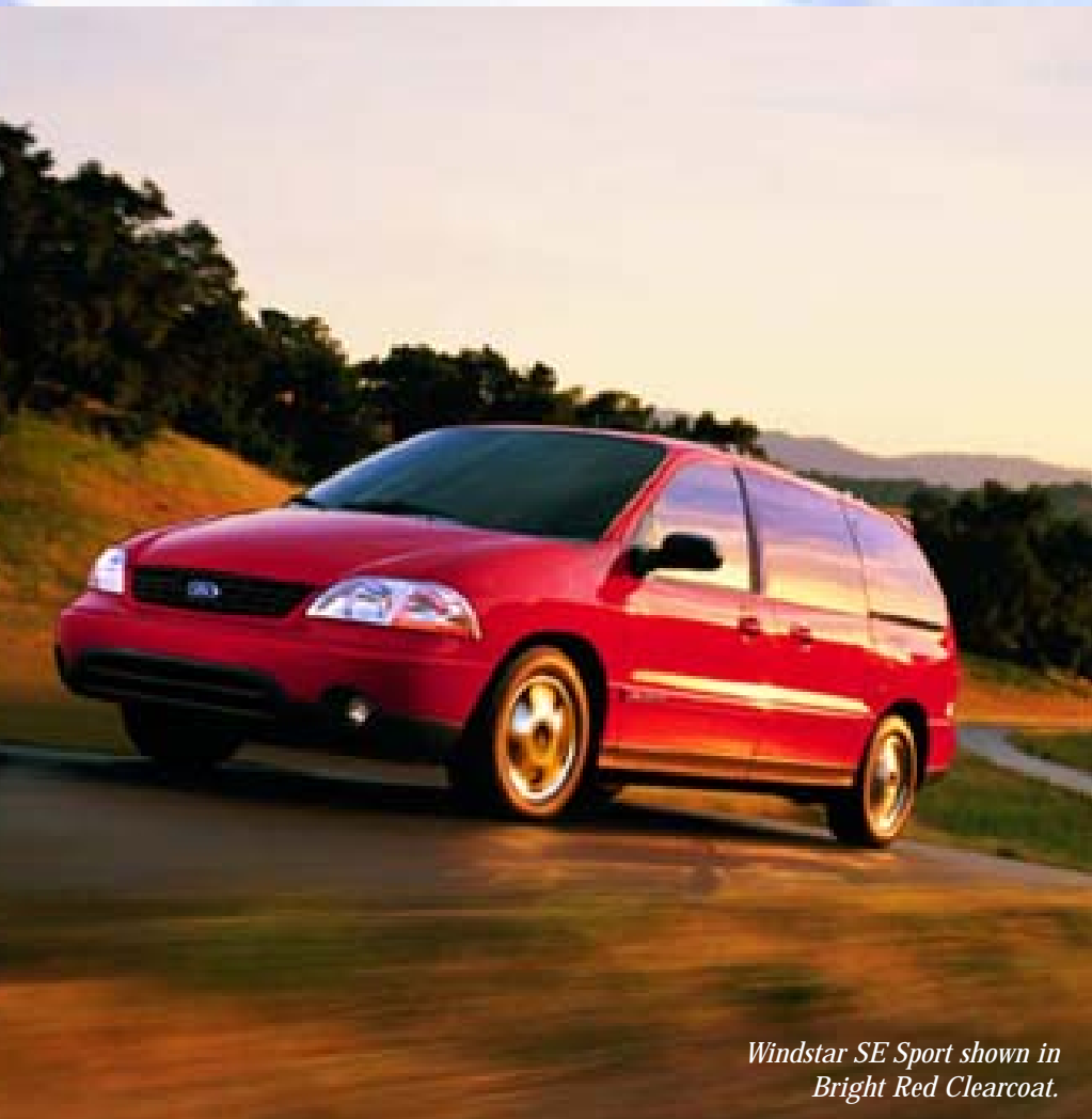
Windstar SE Sport shown in Bright Red Clearcoat.

Windstar SE Sport, for its athletic feats alone, it deserves to have a long-term contract