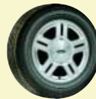
16" 5-Spoke Painted Aluminum