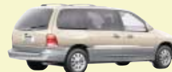
WINDSTAR LIMITED IN LIGHT PARCHMENT GOLD CLEARCOAT METALLIC (AVAILABLE ONLY ON LIMITED)