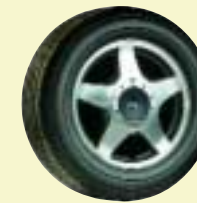
16" 5-Spoke Machined Aluminum