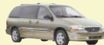
WINDSTAR SEL IN SPRUCE GREEN CLEARCOAT METALLIC