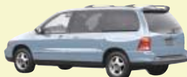
WINDSTAR SE SPORT IN LIGHT SAPPHIRE BLUE CLEARCOAT METALLIC