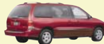
WINDSTAR SE IN CABERNET RED CLEARCOAT METALLIC