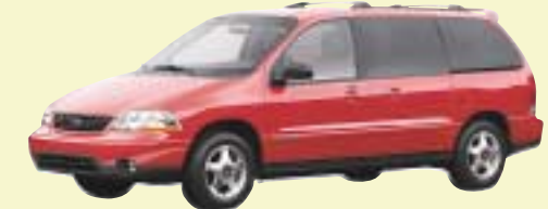
WINDSTAR SE SPORT