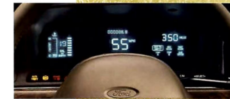
Electronic digital instrumentation is included in the LX Comfort Plus Group.

C rown Victoria is a "full-size" car providing generous room for six adult passengers with space to spare. There are comfort features such as solar tinted glass that helps the air conditioner keep the interior cooler, as well as power windows, power door locks and speed control, to name a few of the many features for your convenience.