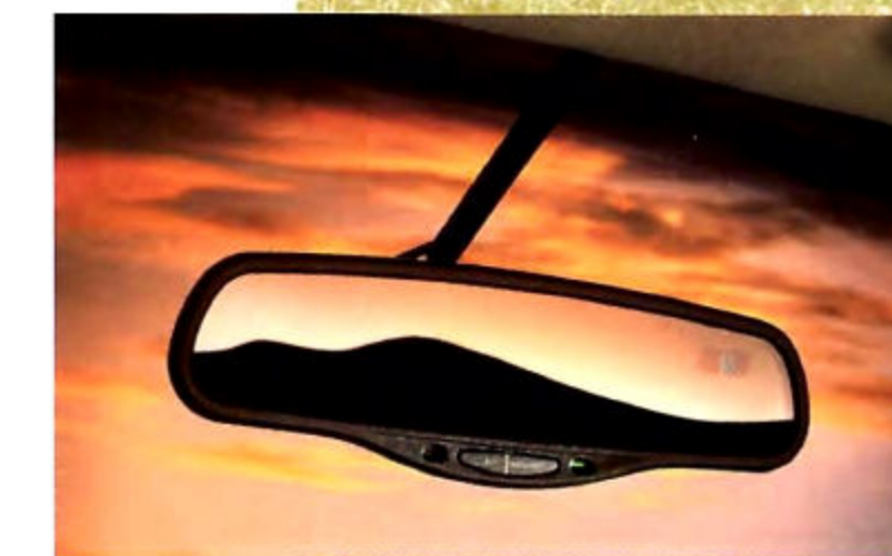
An electronic auto-dim rearview mirror with compass is included in the LX Comfort Group.