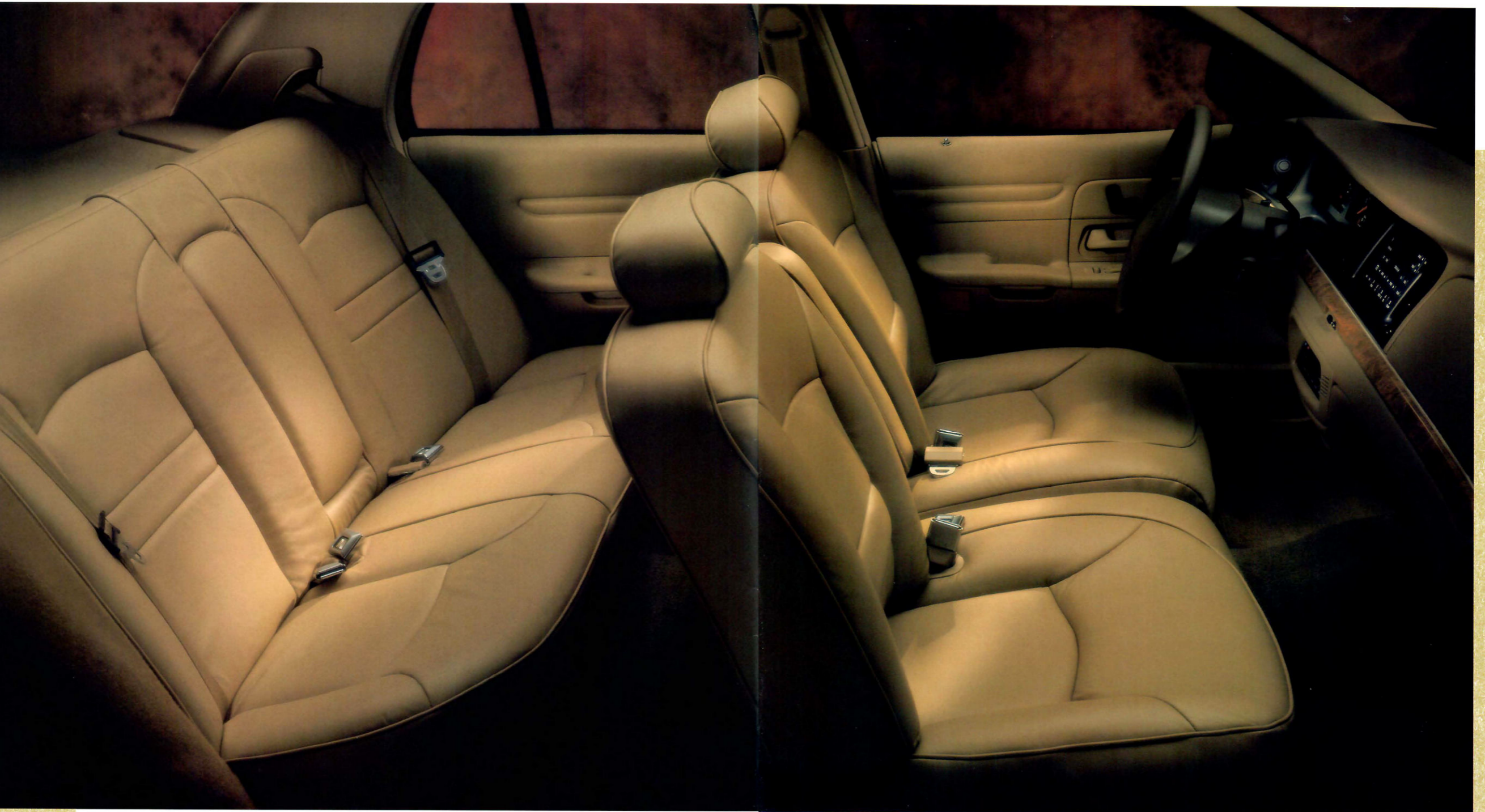
Crown Victoria LX with Comfort Group and optional leather seating surfaces in Prairie Tan.