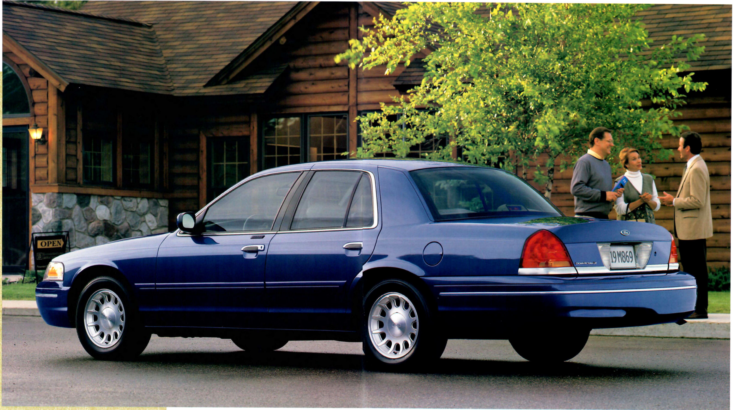
Crown Victoria LX with Comfort Group in Medium Wedgewood Blue Clearcoat Metallic.