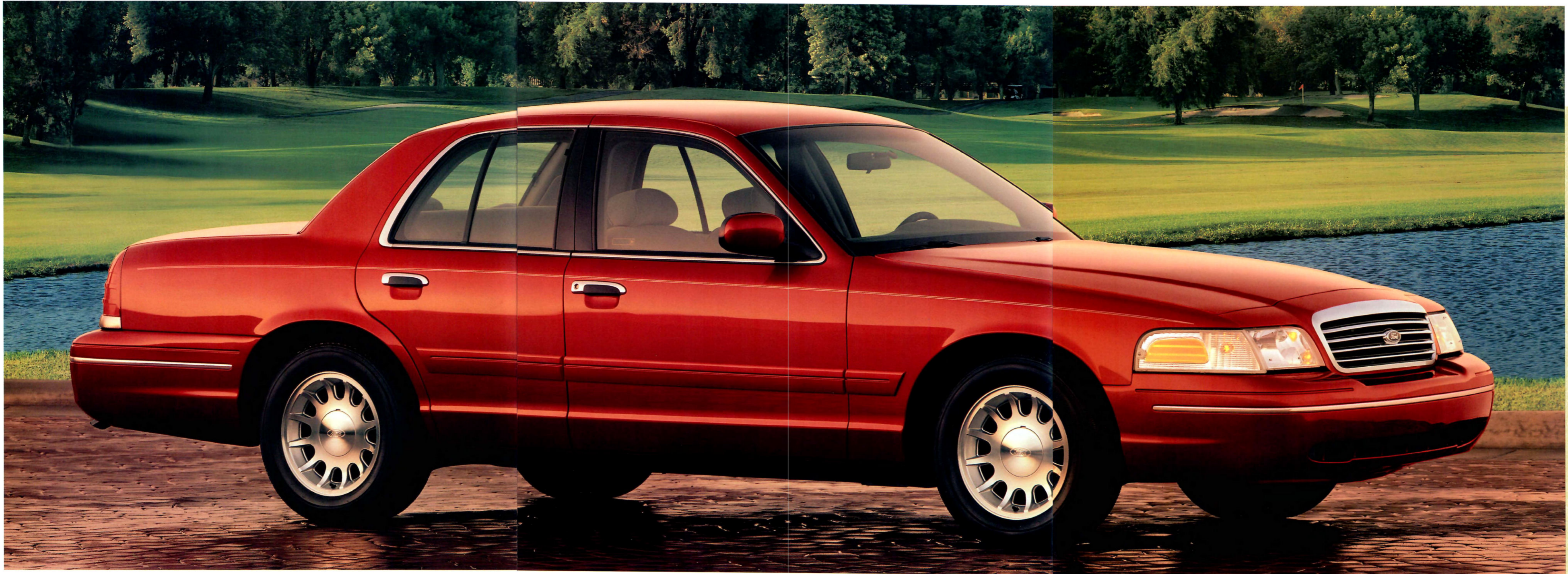
Crown Victoria LX with Comfort Group in Toreador Red Clearcoat Metallic.