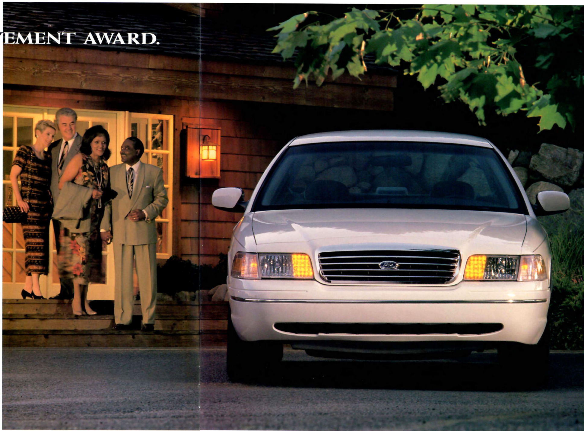
Crown Victoria LX in Vibrant White Clearcoat.

A nnouncing the Ford Crown Victoria for 1998, restyled with a contemporary new look, re-engineered for improved handling and braking performance. You have worked long and hard attending to life's practical necessities. Now is the time to get that full-size car you've always wanted, and it's more affordable than you might think. The 1998 Ford Crown Victoria. You deserve it.