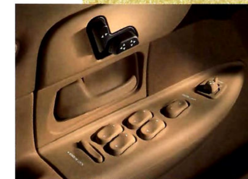
Power windows and door locks are standard. The "express-down" feature allows the driver's window to be lowered completely with just one touch of the button.

Crown Victoria features a spacious 20.6-cu.-ft. "deep-well" trunk and a low lift-over height for easy loading and unloading.