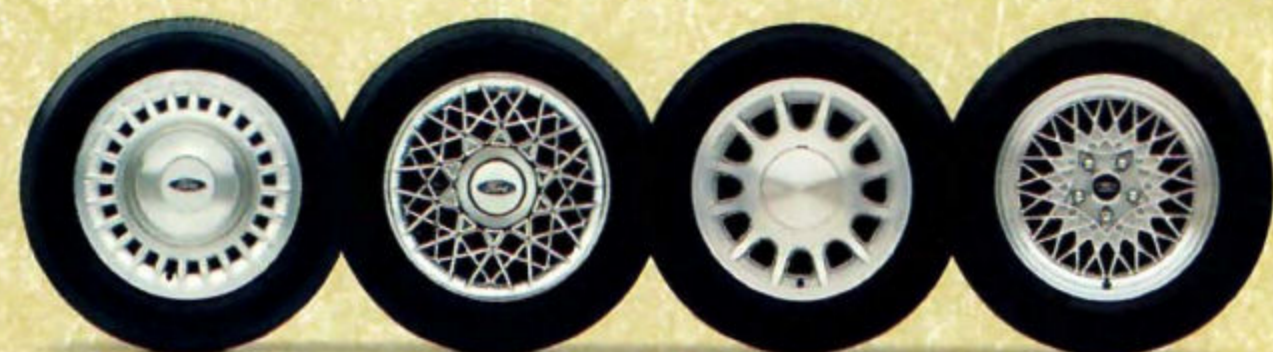
Wheel trim, from left to right: deluxe wheel covers (std. on Crown Victoria); cross-spoke chrome locking wheel covers (std. on LX); 12-spoke aluminum wheels (incl. in LX Comfort Group and Comfort Plus Group); cast aluminum wheels (incl. in Performance and Handling Package).