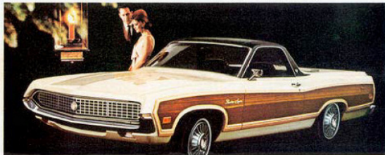
RANCHERO. A personal pickup, a performance pickup, a luxury pickup.