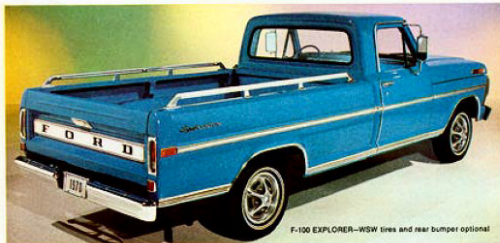
F-100 EXPLORER—WSW tires and rear bumper optional

A specially equipped pickup... at a special low price... for a limited time only!