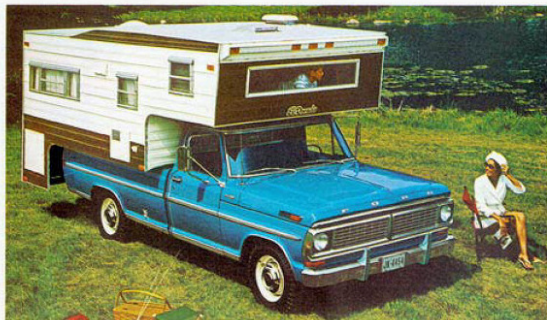
F-250 EXPLORER CAMPER SPECIAL. Brings great mobility to the outdoor lover.