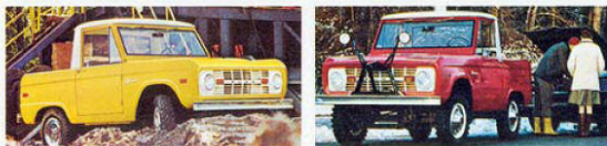
BRONCO. Ford's rugged 4-wheeler—the go-anywhere, all-purpose vehicle.