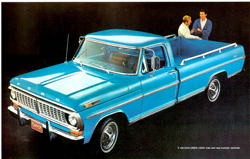
F-100 EXPLORER—WSW tires and rear bumper optional.