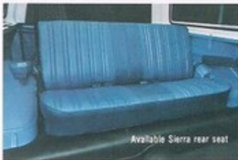
Available Sierra rear seat

Sierra Classic exterior has bright lower body side and rear moldings, bright wheel-opening moldings, and bright windshield and removable top window trim. Also included are two-note electric horn, bright tailgate applique, and deluxe front-end appearance with stacked dual rectangular headlamps.