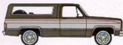
Available Exterior Decor Package