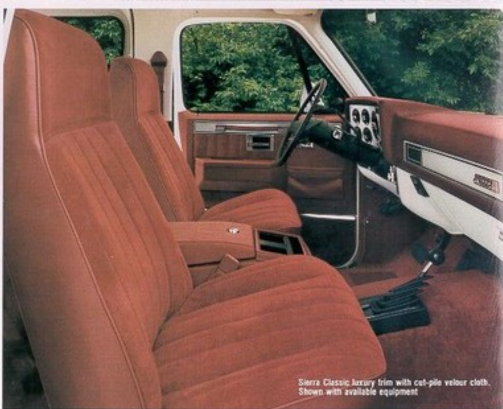
Sierra Classic luxury trim with cut-pile velour cloth. Shown with available equipment