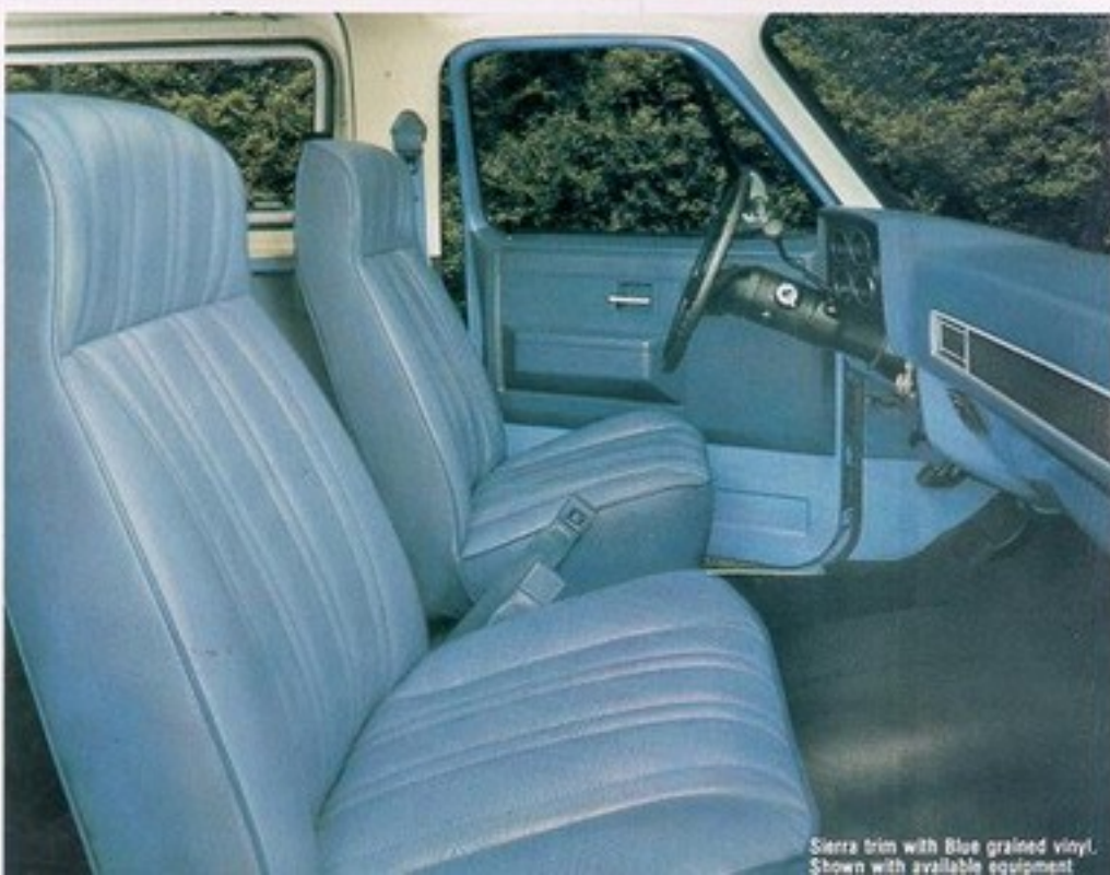
Sierra trim with Blue grained vinyl. Shown with available equipment