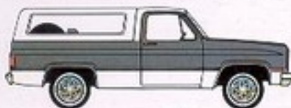
Available Special Two-Tone Scheme with White Top