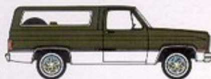
Available Special Two-Tone Scheme with Black Top