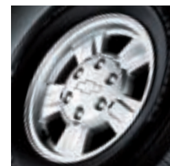
ALUMINUM WHEEL 15" x 6.5" INCLUDED ON REGULAR CAB AND EXTENDED CAB Z85 LS MODELS AND ALL CREW CAB Z85 MODELS (2WD AND 4x4)