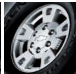
Z71 CAST-ALUMINUM WHEEL 15" x 7" INCLUDED ON ALL Z71 MODELS (2WD AND 4x4)