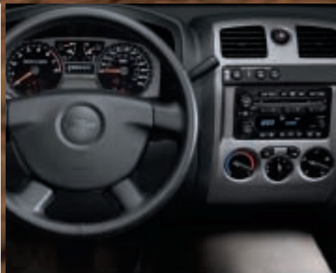
Colorado LS interior in Medium Pewter with available features.