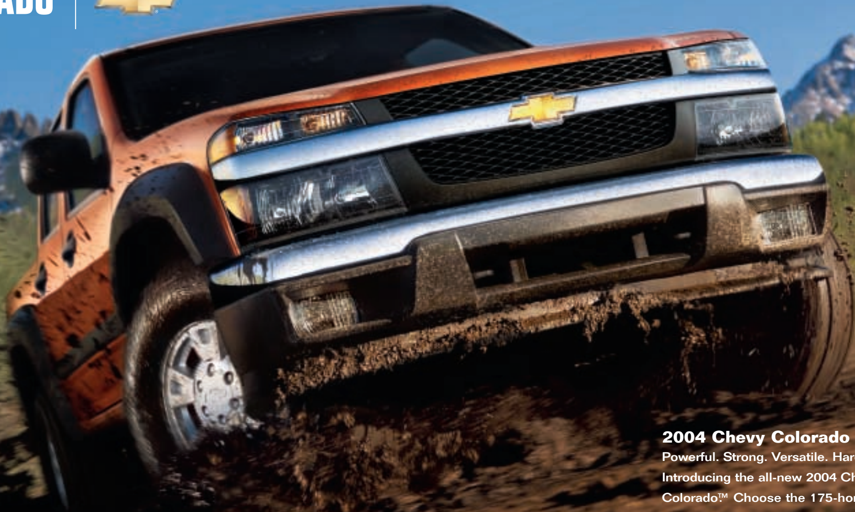
Colorado Crew Cab® Z71® 4x4 shown in Sunburst Orange Metallic.