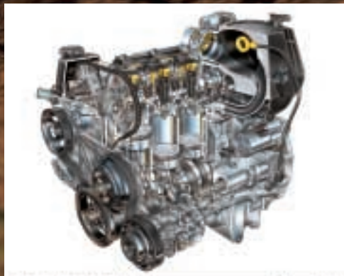
All-new Vortec 3500 3.5L I-5 engine.