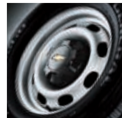
BASE STEEL WHEEL 15" x 6" INCLUDED ON REGULAR AND EXTENDED CAB Z85 BASE MODELS (2WD AND 4x4)