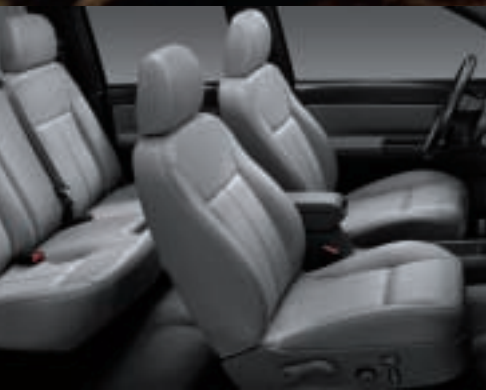
Colorado Crew Cab Z71 LS in Medium Pewter with available Deluxe Leather seating surfaces and other optional equipment.

Powerful. Strong. Versatile. Hardworking. Introducing the all-new 2004 Chevy™ Colorado™. Choose the 175-horsepower Vortec™ 2800 2.8L in-line four-cylinder (I-4) engine (available early 2004) or the Vortec 3500 3.5L in-line five-cylinder (I-5) engine that has 220 horsepower, more than any V6 engine in its class.* Colorado can be tailored to your needs by offering all available suspensions with any cab configuration. The 2004 Chevy Colorado. It's the new state of midsize pickups — from the family of the most dependable, longest-lasting trucks on the road.†