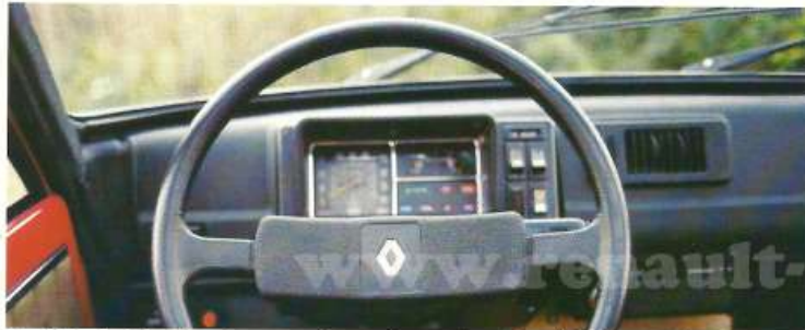
Le Flight Deck: Convenient, functional, with fingertip control.