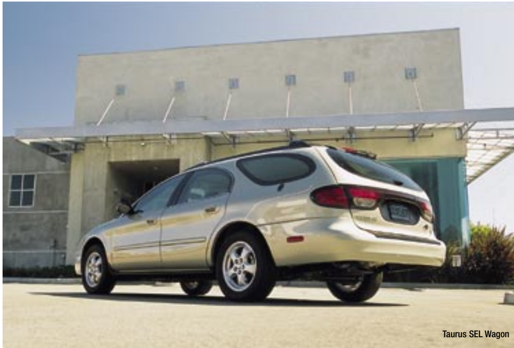
Taurus SEL Wagon