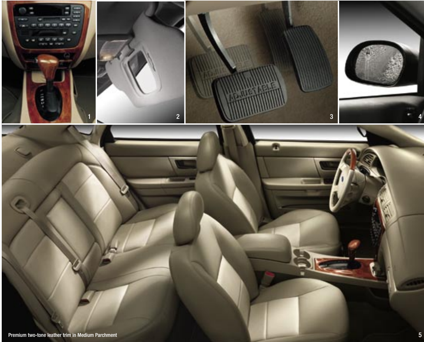
Premium two-tone leather trim in Medium Parchment

1 The available Wood Package on Taurus SES/SEL adds woodgrain accents throughout. 2 Dual illuminated visor vanity mirrors come standard on SES and SEL. 3 Available power adjustable accelerator and brake pedals allow you to find the most comfortable position for your height. 4 Heated sideview mirrors, part of the optional Luxury and Convenience