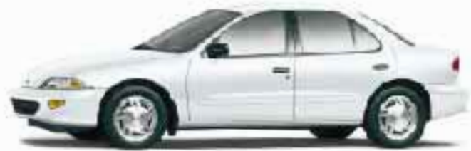
16 –Bright White

Colours may not be exactly as illustrated due to restrictions of printing process. Please see your sales consultant for specific colour and model availability.