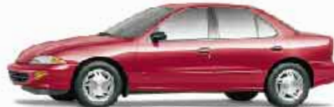
81 –Bright Red