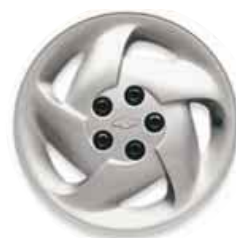
A - 14" bolt-on wheel cover