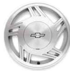
C - 15" styled cast-aluminum