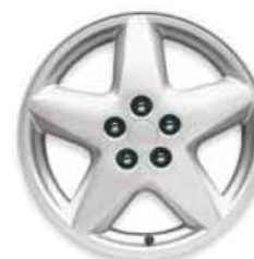
E - 16" 5-spoke cast-aluminum