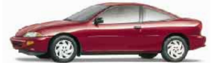
96 –Cayenne Red Metallic