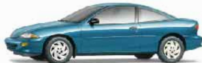
43 –Bright Aqua Metallic