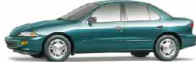
37 –Green Metallic