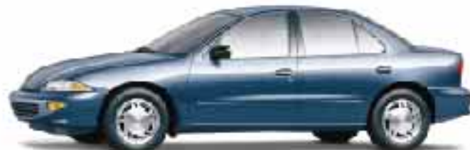
24 –Medium Opal Blue Metallic