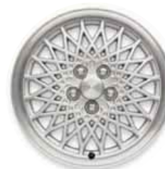
D - 15" crosslace cast-aluminum