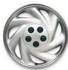
B - 15" bolt-on wheel cover