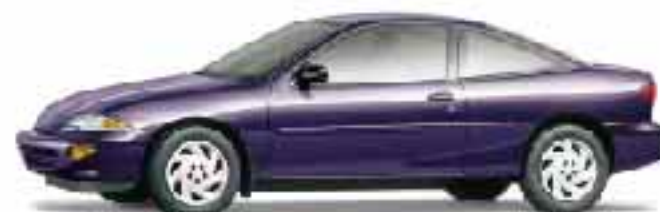
89 –Deep Purple Metallic