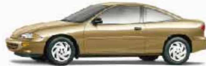
60 –Gold Metallic