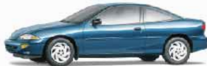
22 –Aquamarine Blue Metallic