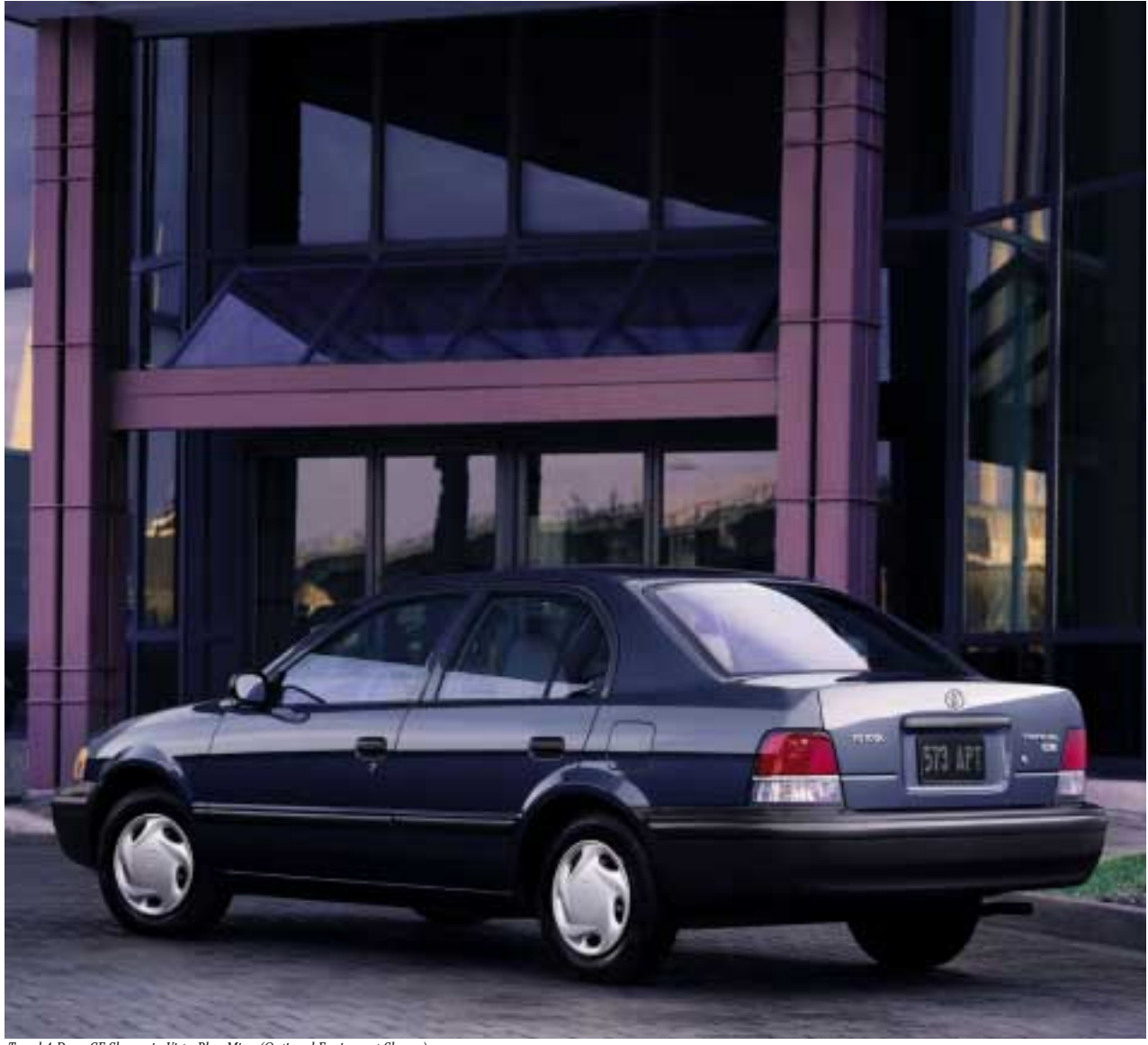
Tercel 4-Door CE Shown in Vista Blue Mica (Optional Equipment Shown)