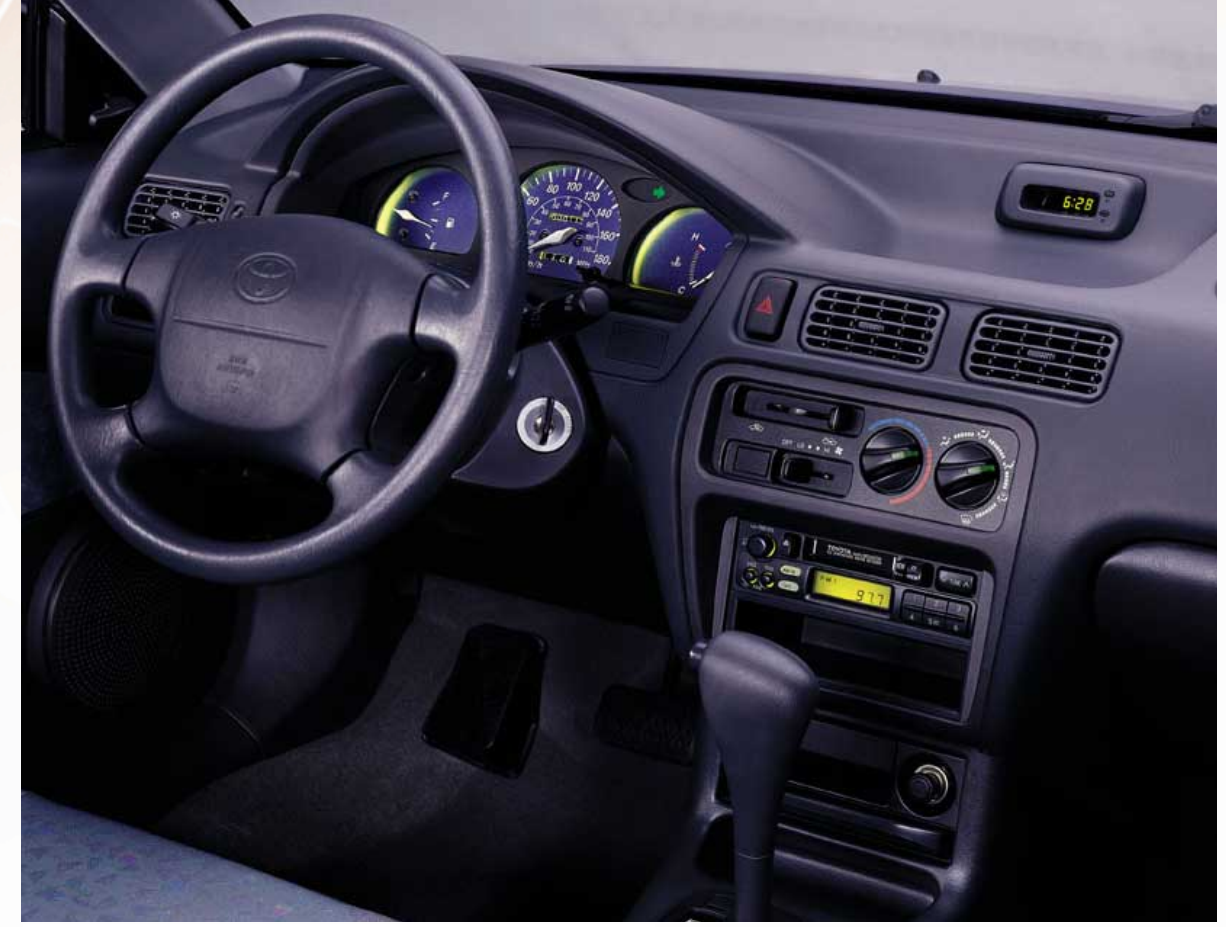
4-Door CE interior shown in Grey (Optional Equipment Shown)