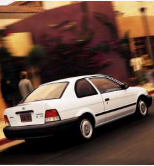
Tercel 2-Door CE Shown in Alpine White (Optional Equipment Shown)