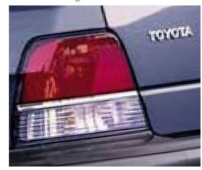
The 1998 Tercel is our most affordable sedan and its performance and practicality make this Toyota an exceptional value. But you can expect and deserve a lot for your money.