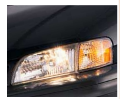
Tercel dramatic styling starts with the sweep of the new reflector headlamps and wraps around to the bold new taillights