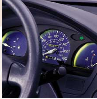
Tercel's newly refined instrumentation allows for easy viewing and fingertip control