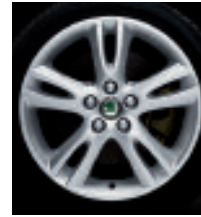
16" 'Atria' alloys