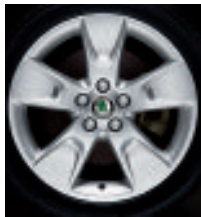
16" 'Bear' alloys