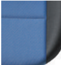
Stone blue upholstery Onyx/onyx dash