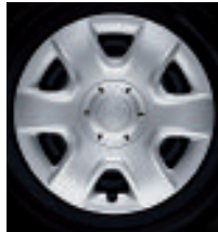
15" 'Hermes' steel wheel