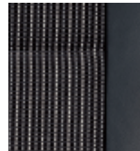
Partial leather upholstery