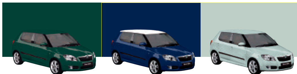
Amazonian Green metallic** 7R7R