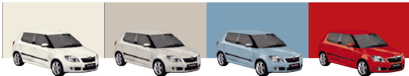
Candy White 9P9P