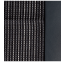
Partial leather upholstery