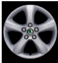
15" 'Antares' alloys