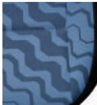
Blue wave upholstery Onyx/silver dash or onyx/onyx dash