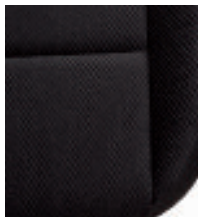
Onyx cloth upholstery Onyx/onyx dash