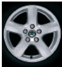
14" 'Fun' alloys