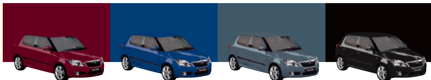
Rosso Brunello metallic †† X7X7