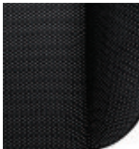
Sport upholstery Onyx/onyx dash