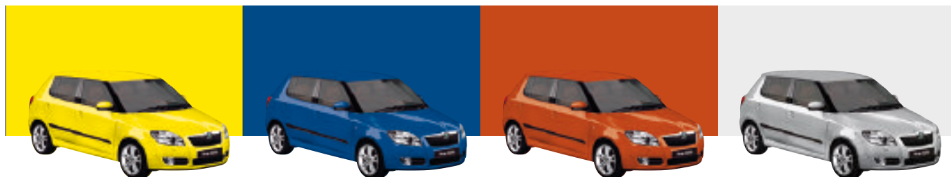
Sprint Yellow*** F2F2