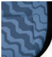
Blue wave upholstery Onyx/silver dash or onyx/onyx dash