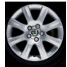
15" 'Line' alloys