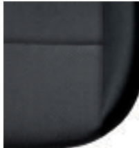
Stone grey upholstery Onyx/onyx dash