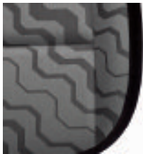
Grey wave upholstery Onyx/silver dash or onyx/onyx dash