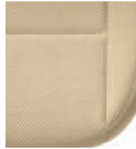
Ivory cloth upholstery Onyx/ivory dash