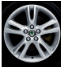
16" 'Atria' alloys