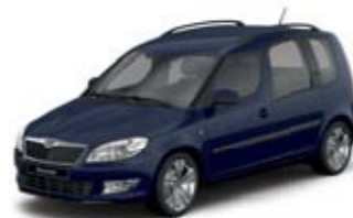
Pacific Blue uni