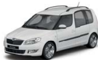
Candy White uni