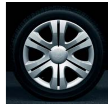
6.0J x 15" steel wheels for 195/55 R15 tyres with Satellite hub covers.