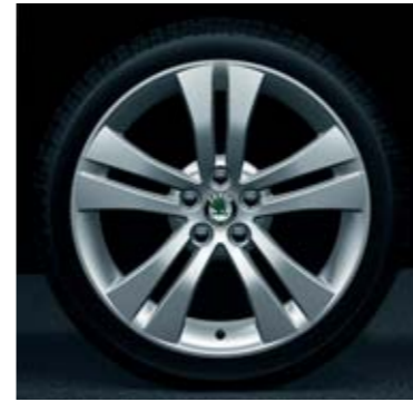
7.0J x 17" Trinity alloy wheels for 205/40 R17 tyres.