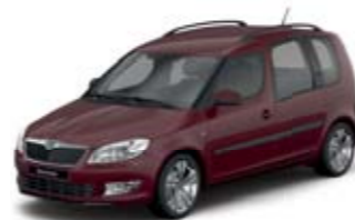
Rosso Brunello metallic