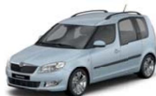
Aqua Blue metallic