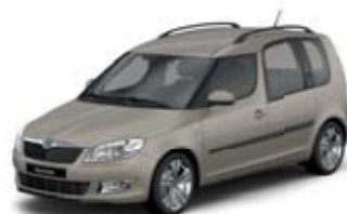
Cappuccino Beige metallic