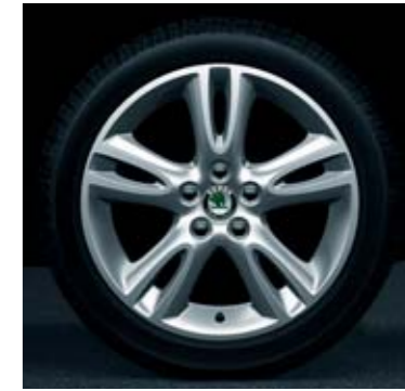
6.5J x 16" Atria alloy wheels for 205/45 R16 tyres.