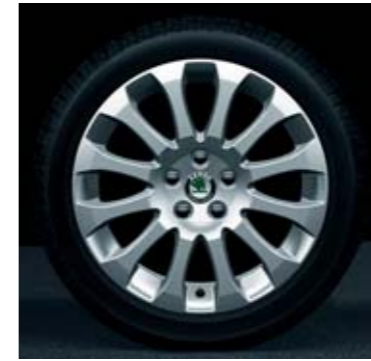
6.5J x 16" Comet alloy wheels for 205/45 R16 tyres.