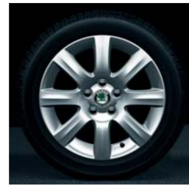
6.0J x 15" Line alloy wheels for 195/55 R15 tyres.