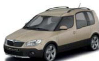
Safari Beige metallic** (Exclusively for Roomster Scout)

* Available during 1st half of 2012. ** Expires during 1st half of 2012.