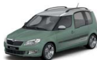
Malachite Green metallic with roof, external mirrors and self-adhesive foil in silver colour