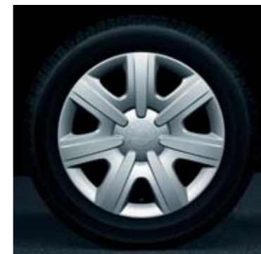
5.0J x 14" steel wheels for 175/70 R14 tyres with Comoros hub covers.