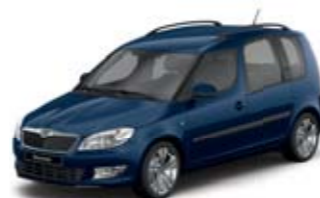
Storm Blue metallic*