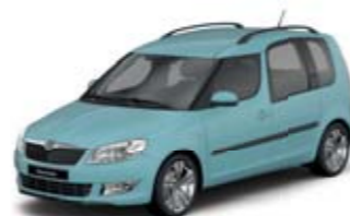
Miami Blue metallic