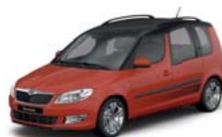
Corrida Red uni with roof and self-adhesive foil in black colour