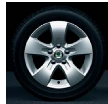
6.0J x 14" Atik alloy wheels for 185/65 R14 tyres.