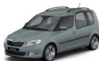
Platin Grey metallic