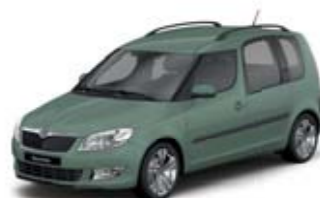
Malachite Green metallic