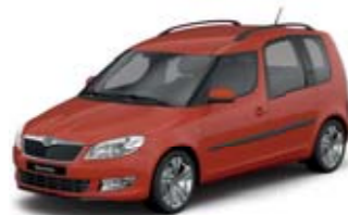
Corrida Red uni