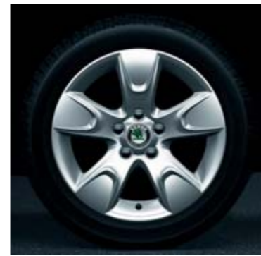
6.0J x 15" Avior alloy wheels for 195/55 R15 tyres.