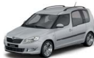
Brilliant Silver metallic