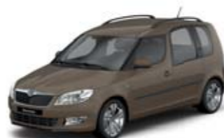
Mato Brown metallic