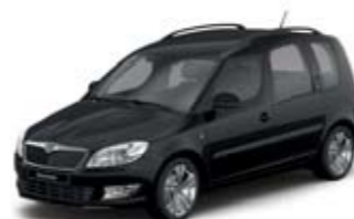
Black Magic pearl effect