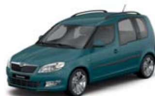
Lava Blue metallic