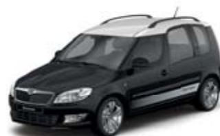
Black Magic pearl effect with roof and self-adhesive foil in white colour