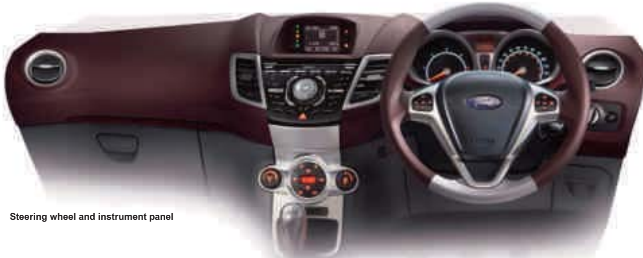
Steering wheel and instrument panel

Scuff plates and premium velour floor mats Elegant additions that welcome and protect. Scuff plates are also available without illumination. (Option as part of interior pack)