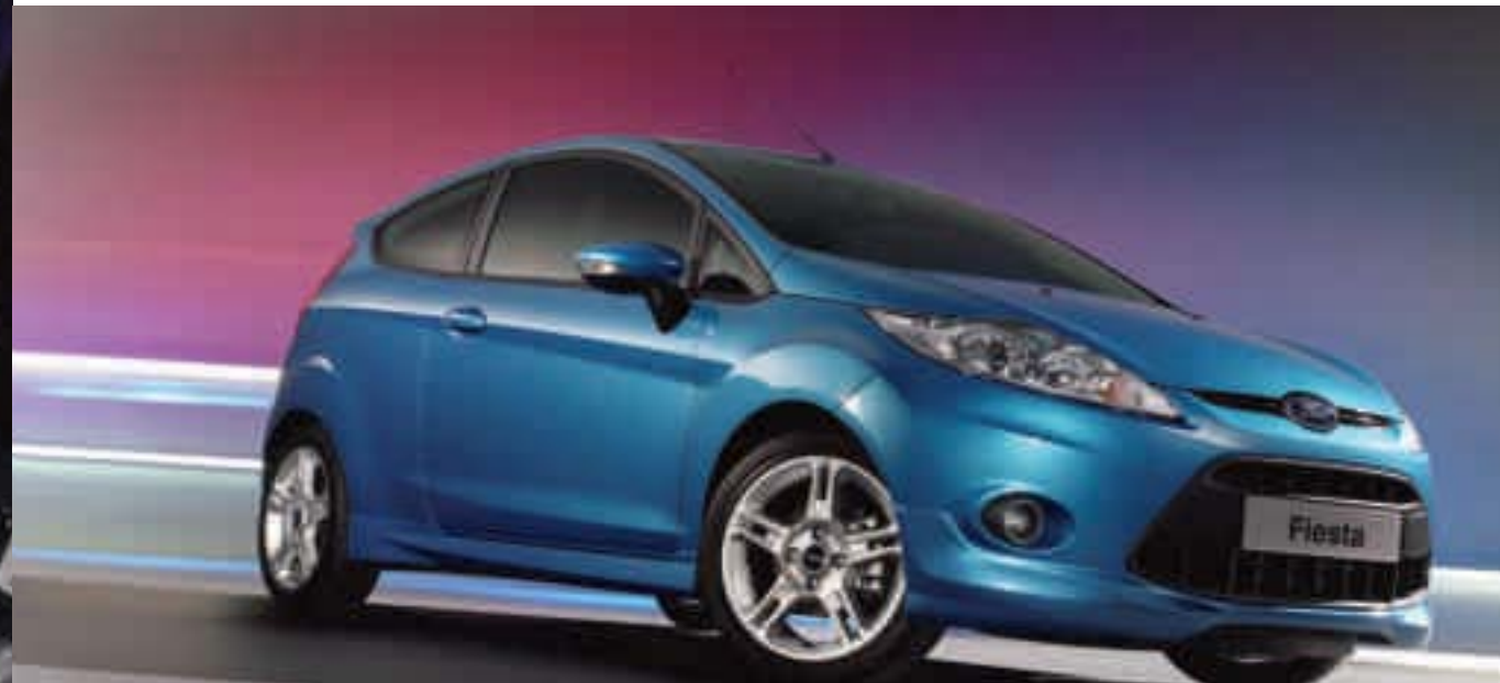
Model shown is finished in Vision metallic paint (option) with 16" 5-spoke alloy wheels (standard).

The Ford Fiesta Zetec S demands attention with its dynamic stance and powerful lines.