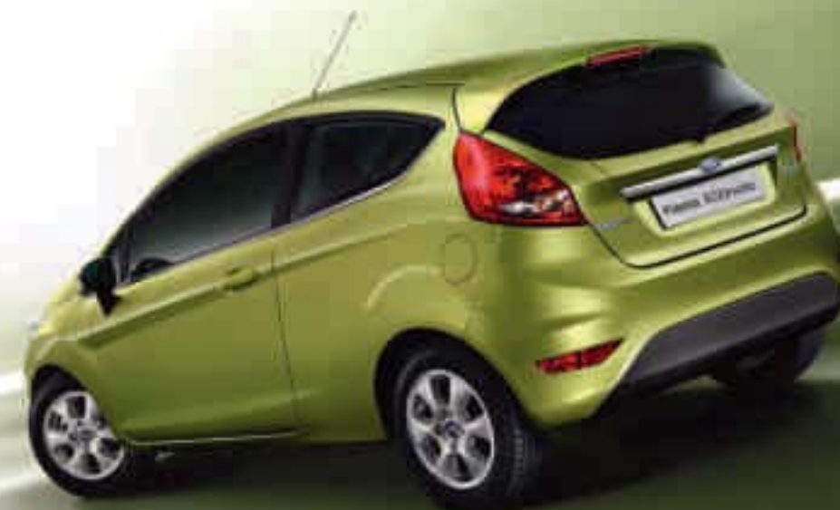
Left Model shown is a Fiesta Titanium ECOnetic finished in Squeeze metallic paint (option) with 14" 6-spoke alloy wheels and 175/65 low rolling resistance tyres.