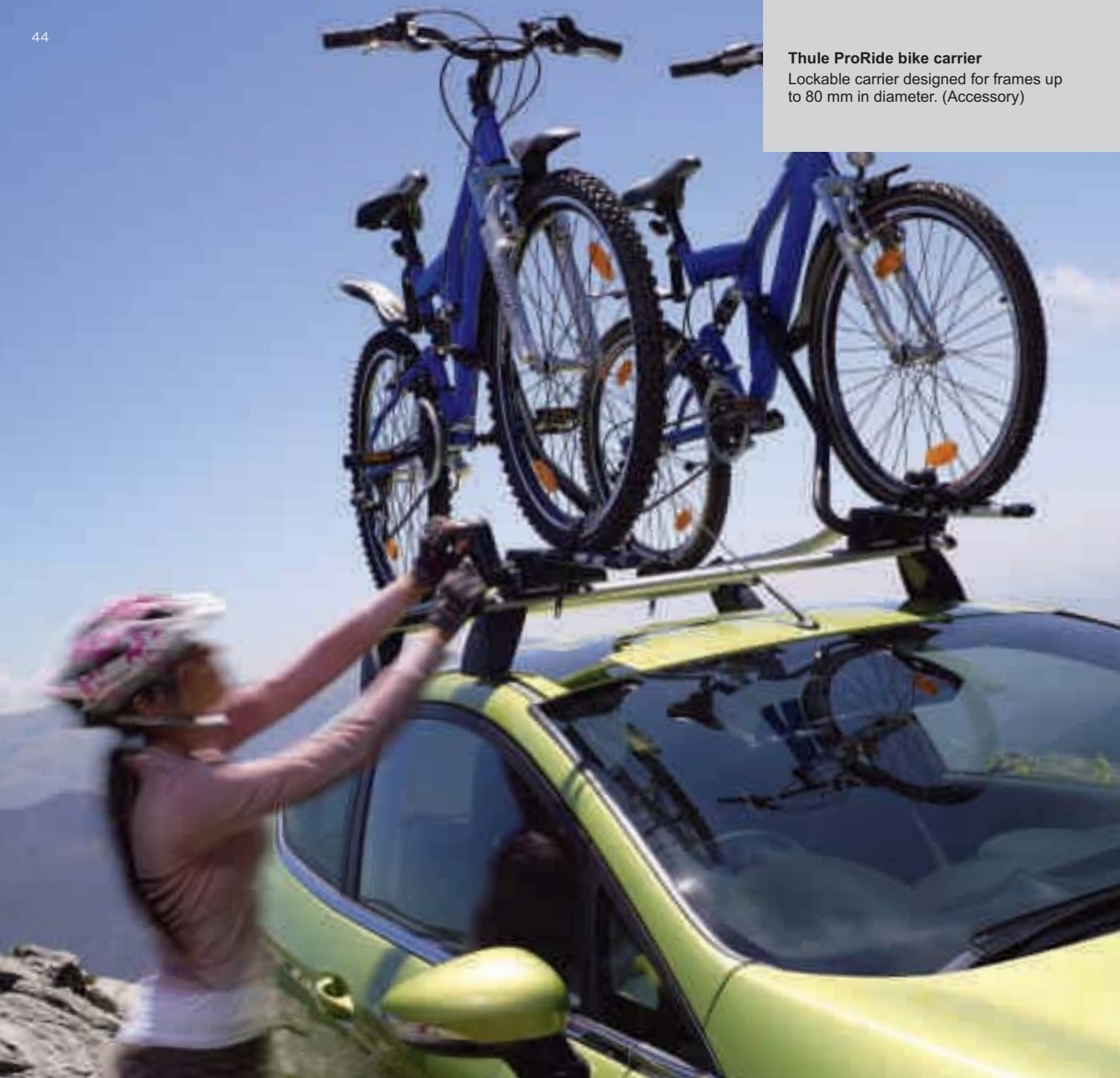
Thule ProRide bike carrier Lockable carrier designed for frames up to 80 mm in diameter. (Accessory)