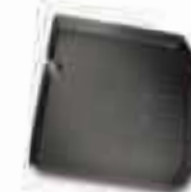
Anti-slip boot mat Waterproof mat protects luggage compartment from dirt, wear and tear.