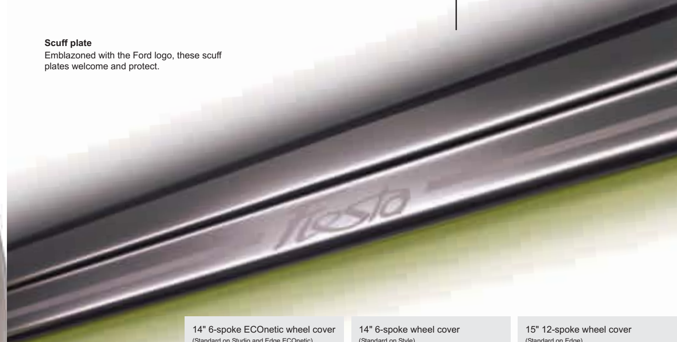
14" 6-spoke ECONetic wheel cover (Standard on Studio and Edge ECONetic)

Emblazoned with the Ford logo, these scuff plates welcome and protect.