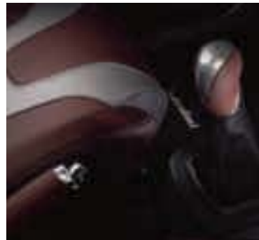
Leather gearshift knob