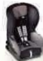
Britax Römer child seat Various seats available for all ages, also with ISOFIX.