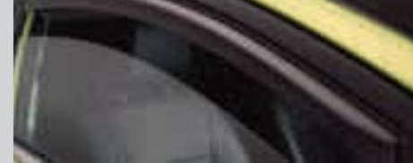
ClimAir® wind deflector Reduces turbulence and noise for a more enjoyable drive with the windows down, even when it's raining. (Accessory)

Make the most of the great outdoors with a wide range of travel accessories, all available from your local Ford Dealer.