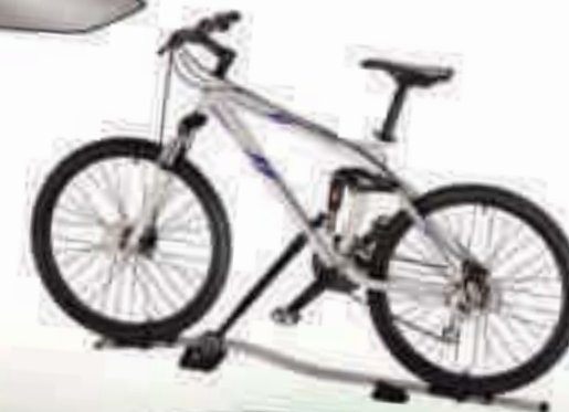
Base roof load carrier Lockable base load carrier compatible with a range of attachments.