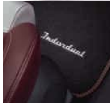
Premium velour mat

Leather seat trim Beautifully-stitched red and silver leather embossed with the 'Individual' logo.