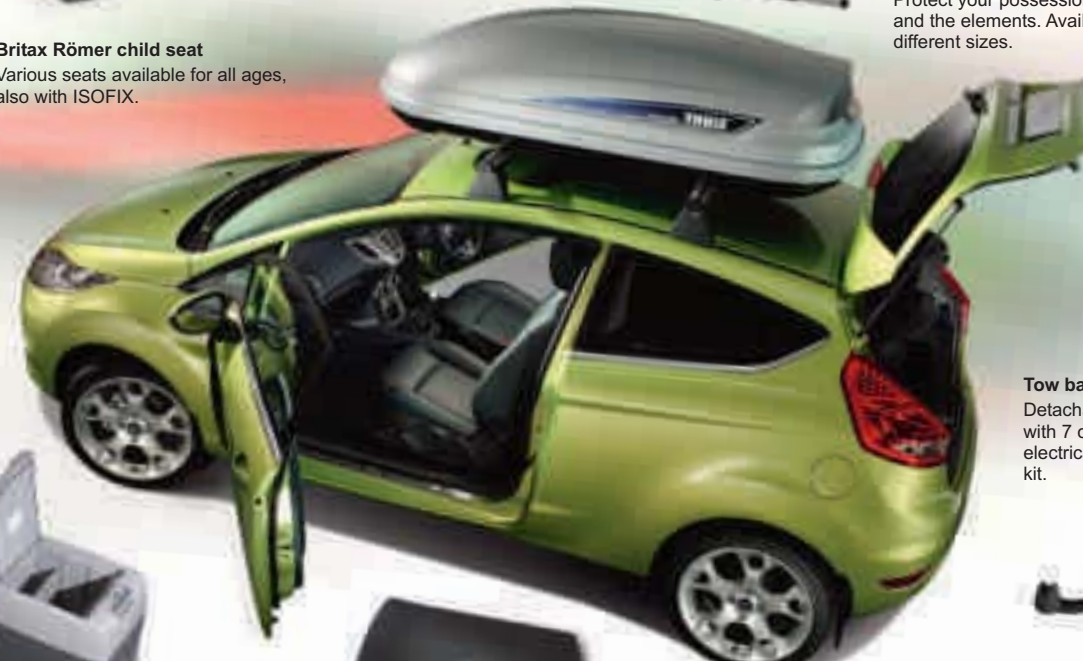
Tow bar* Detachable tow bar with 7 or 13 pin electrical connector kit.