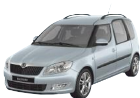
6. Aqua Blue metallic