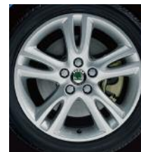
16" 'Atria' alloys