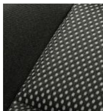
'Scout' Onyx cloth & Onyx dash