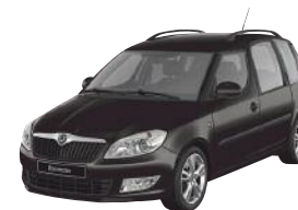
5. Black Magic pearl effect