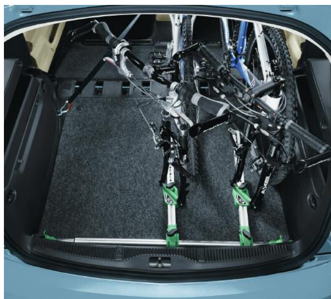
Bicycle holder in luggage compartment