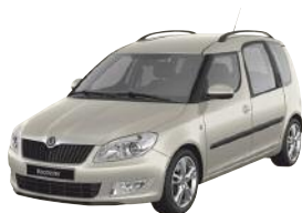
7. Cappuccino metallic