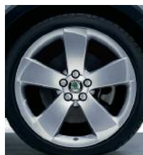
16" 'Scout' alloys