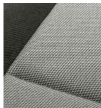
Stone Grey & Onyx dash or Stone Grey & Silver dash