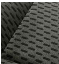
Domino Grey & Onyx dash or Domino Grey & Silver dash