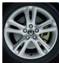
16" Atria alloys