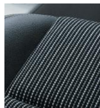
Partial leather upholstery with Onyx dash or Silver dash