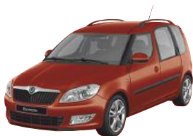
2. Corrida Red