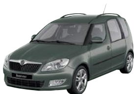
12. Regency Green metallic