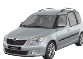
8. Steel Grey metallic