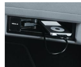
MDI (Mobile Device Interface)