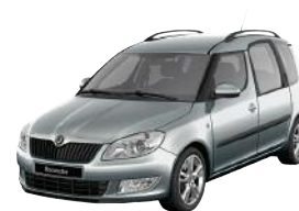
4. Brilliant Silver metallic