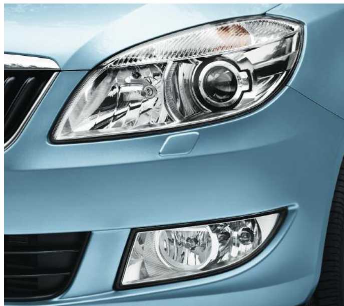
Curve projector headlights including cornering front fog lights