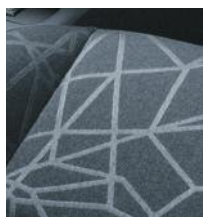
Kristal upholstery & Onyx dash