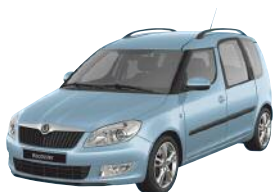
11. Miami Blue metallic