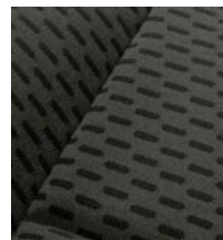
Domino Black & Onyx dash or Domino Black & Silver dash