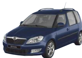
3. Pacific Blue