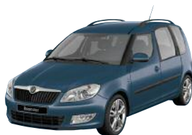
13. Petrol Blue metallic