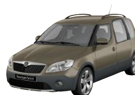
14. Muscovado metallic*