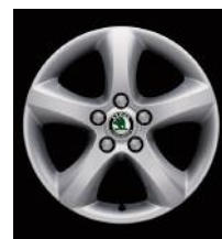
15" 'Antares' alloys