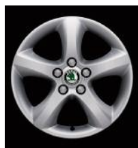
15" 'Antares' alloys