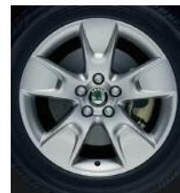
15" 'Avior' alloys