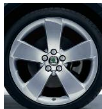
17" 'Scout' alloys