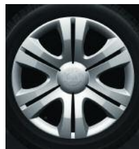
15" 'Satellite' Steel wheel covers