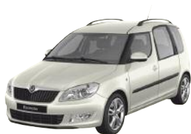
1. Candy White