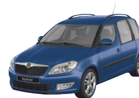
10. Storm Blue metallic*