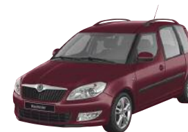
9. Rosso Brunello metallic *