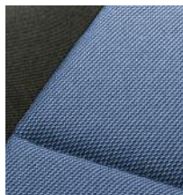
Stone Blue & Onyx dash or Stone Blue & Silver dash