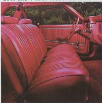
Mercury Monarch standard bench seat in all-vinyl.

covers. And the new Monarch 2-door and 4-door sedans have been