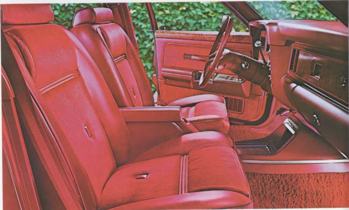
Above: Grand Monarch Ghia interior in dark red velour