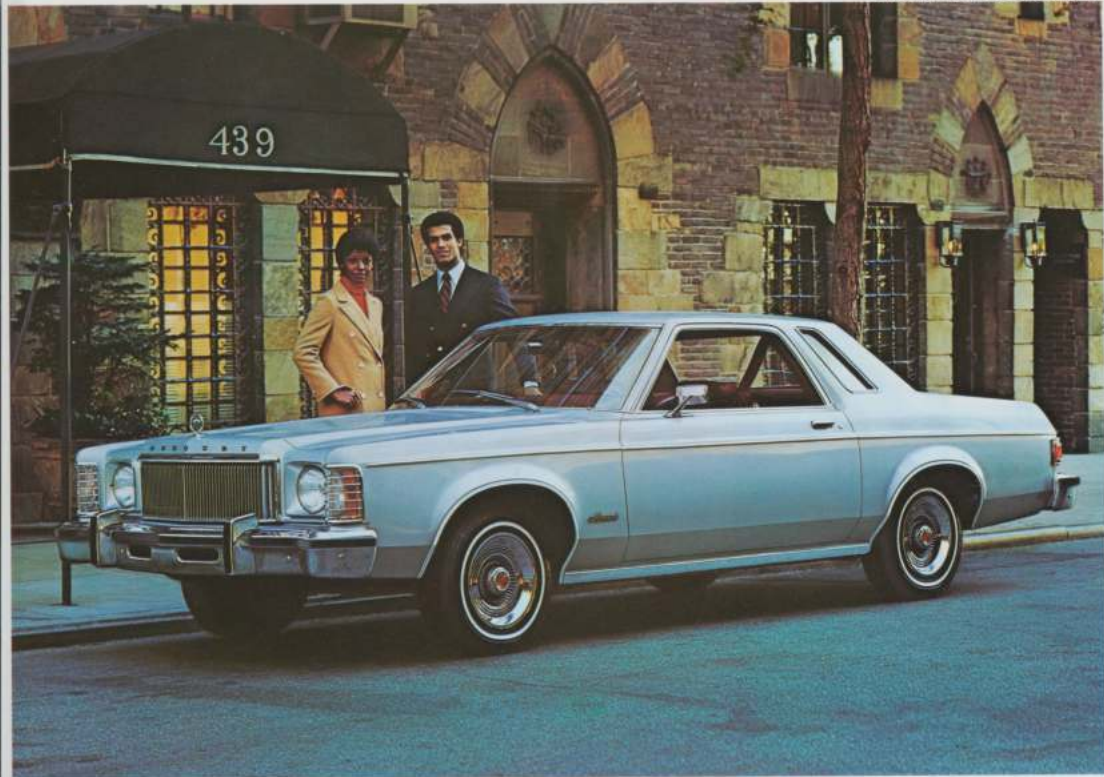
Mercury Monarch 2-door Sedan

When it comes to the combination of crisp handling, roominess and economy, look to the precision-size Mercury Monarch.