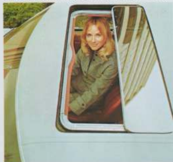
Optional MoonRoof has electrically powered sliding panel of one-way glass.

such standard features as a 250-1V six-cylinder engine, solid-state ignition, high level ventilation and inside hood release. Monarch Ghia