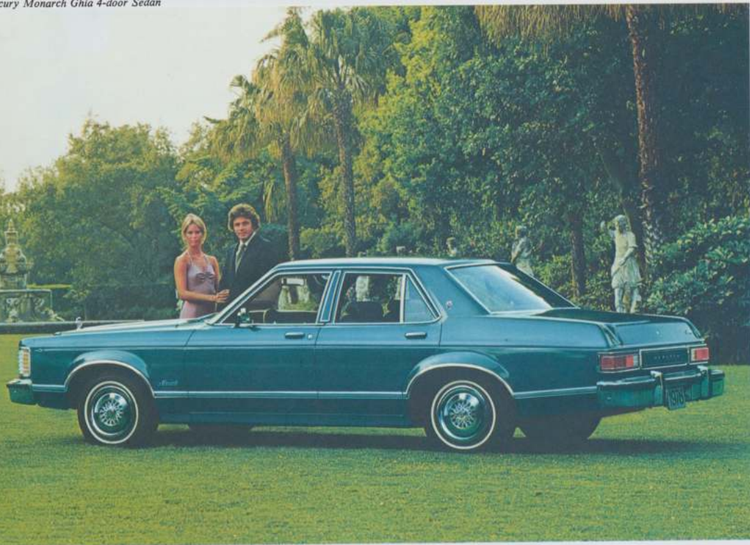
Mercury Monarch Ghia 4-door Sedan

The long list of Ghia options permits unprecedented individual distinction. Few personal luxury cars offer such refinements . . . power MoonRoof, rear window defroster, AM/FM/MPX radio and tilt steering wheel. The Monarch Ghia is the luxury car that is precisely designed to accommodate your individual preferences for performance and style.