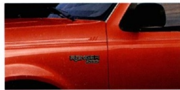
Bright Red Clearcoat