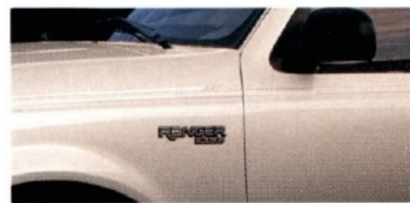
Mocha Frost Clearcoat Metallic

Note: See your dealer for deluxe two-tone color combinations available for Ranger XLT. Also see your dealer about availability of colors for Ranger XL and XLT models with the flareside box option.