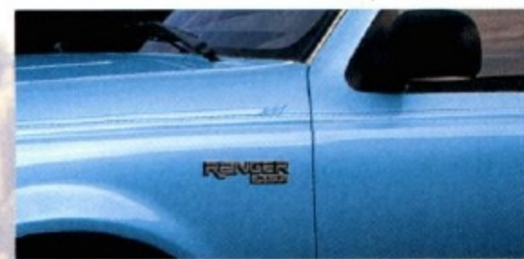
Brilliant Blue Clearcoat Metallic