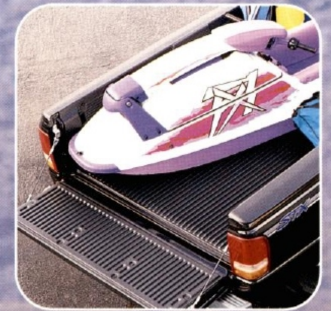
▲ The high-density bedliner helps guard against damage and includes a protective tailgate panel.