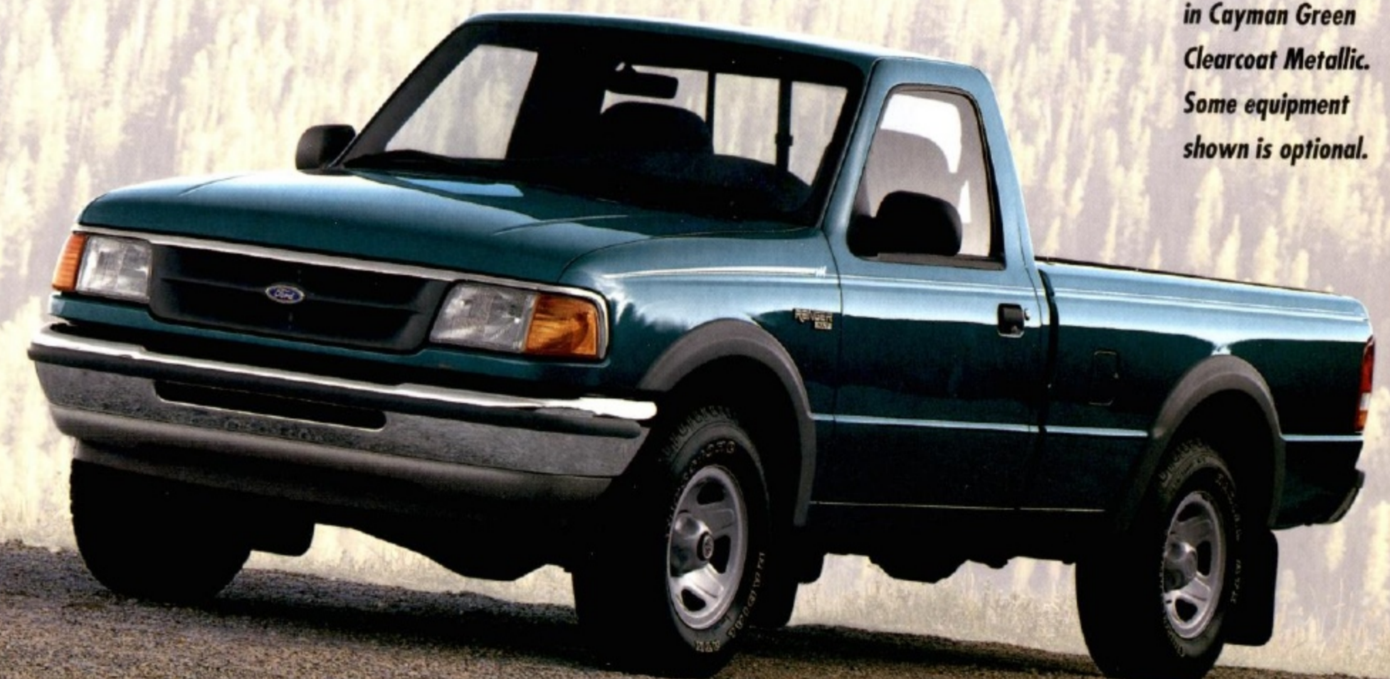
▼ The Ranger XLT Regular Cab 4x4 in Cayman Green Clearcoat Metallic. Some equipment shown is optional.

Your Ford Dealer offers a variety of quality Ford-brand accessories that meet or exceed our strict specifications.