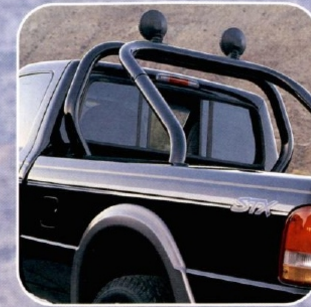
▲ Rally bars (not for occupant safety) are stylish and sporty. Shown also are off-road lights, available separately.