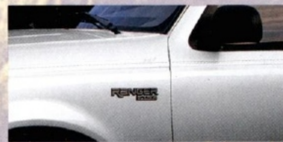
Silver Clearcoat Metallic