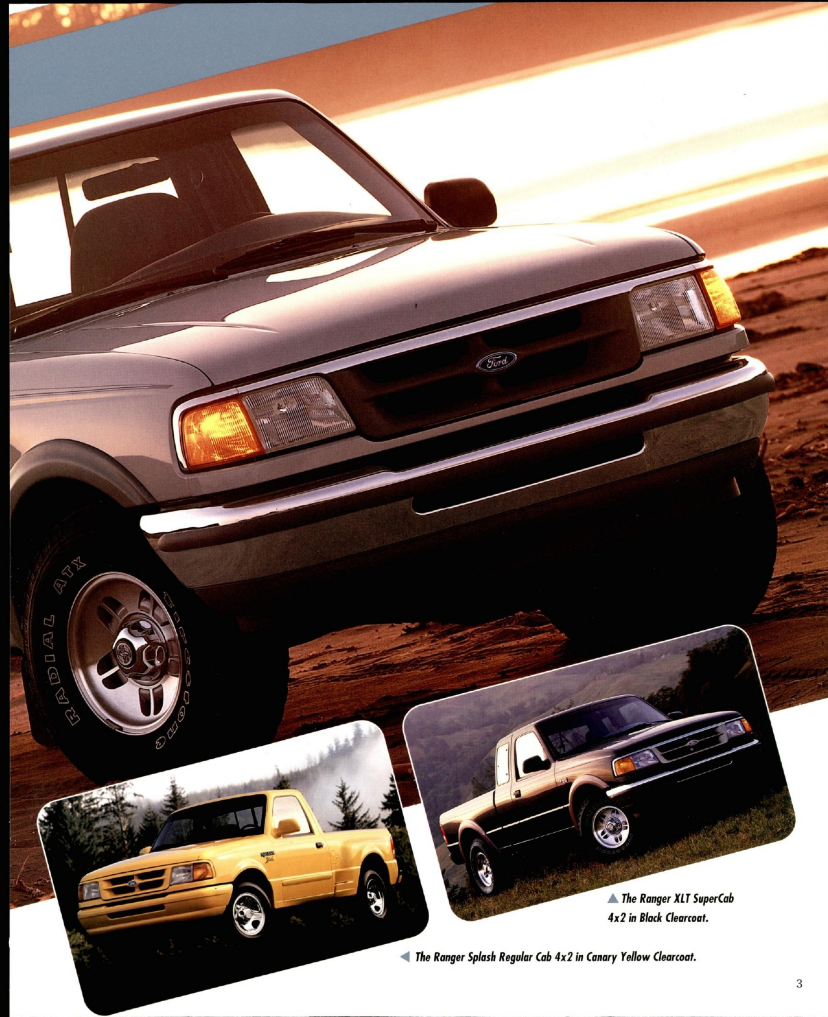
▲ The Ranger XLT SuperCab 4x2 in Black Clearcoat.