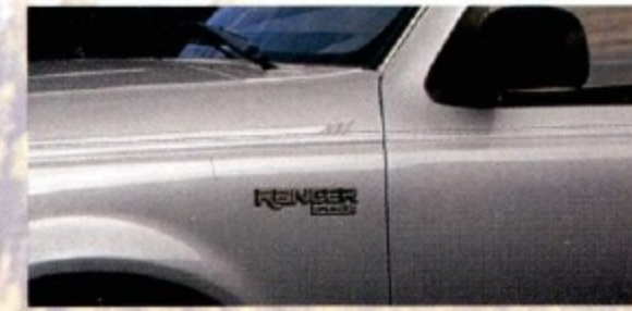
Charcoal Grey Clearcoat Metallic