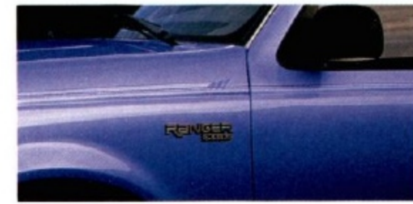
Sapphire Blue Clearcoat Metallic