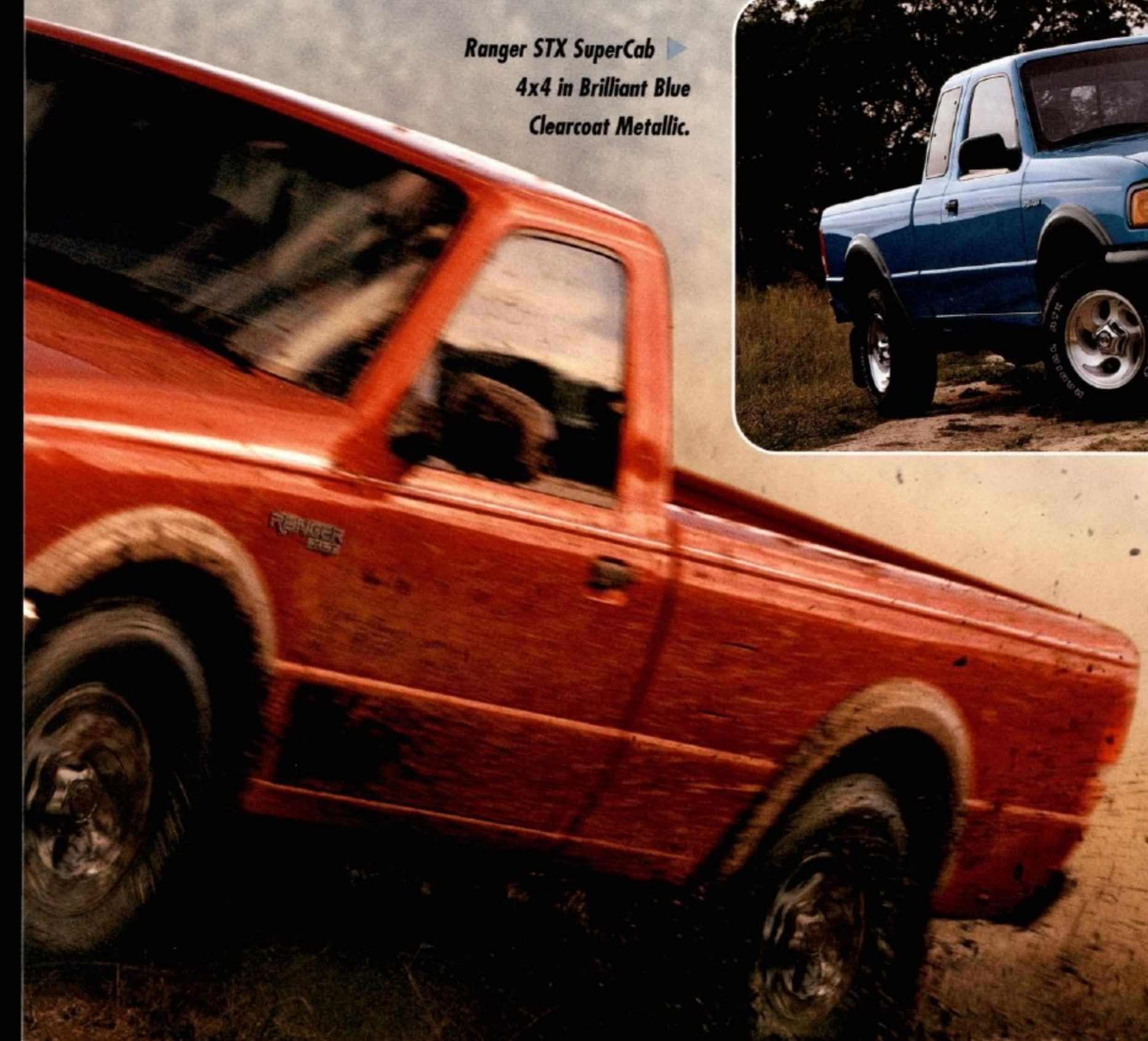
Ranger Splash SuperCab 4x4 ▶ in Electric Red Clearcoat Metallic.