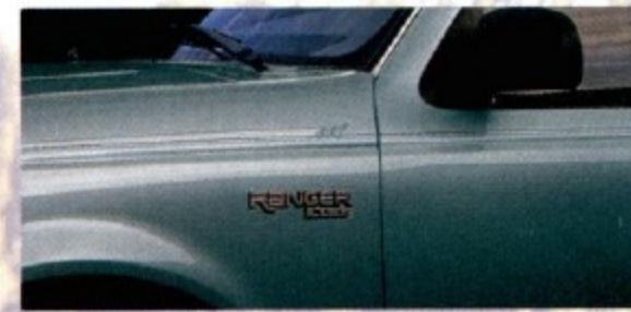
Medium Willow Green Clearcoat Metallic