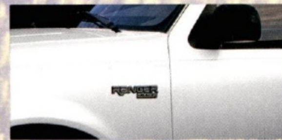
Oxford White Clearcoat