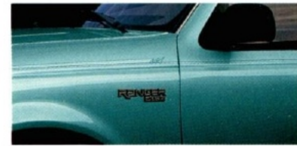
Cayman Green Clearcoat Metallic