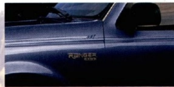
Dark Blue Clearcoat Metallic