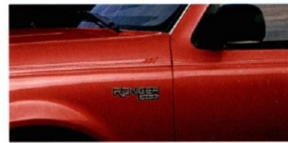
Electric Red Clearcoat Metallic