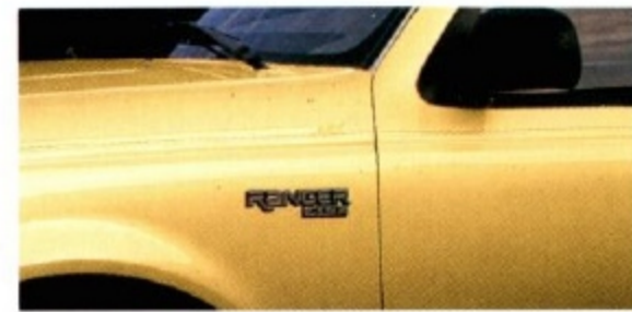
Canary Yellow Clearcoat (Splash only)