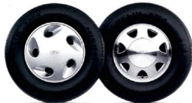
Left to right: standard full-face wheel cover; optional forged aluminum wheel.