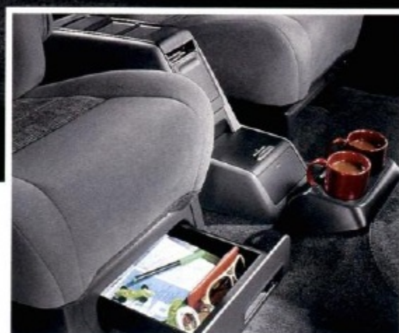
A handy storage bin, conveniently located under the front passenger seat, is standard in all models.