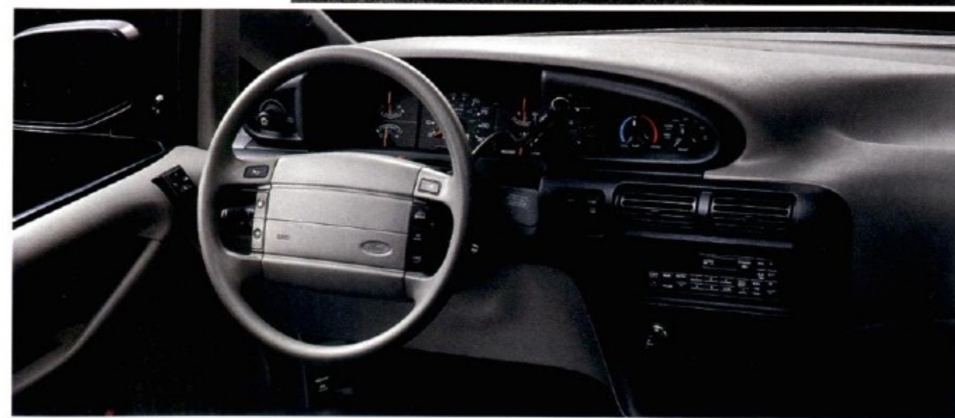
Aerostar's instrument panel with ergonomic instruments and controls is carefully designed for operating convenience. Major photo: Aerostar's standard 7-passenger seating in Medium Grey. The extended-length model has a generous maximum cargo capacity of 167.7 cubic feet.