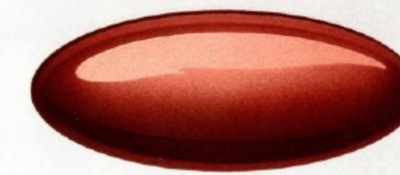
Toreador Red Clearcoat Metallic