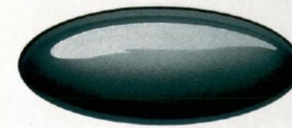
Medium Willow Green Clearcoat Metallic