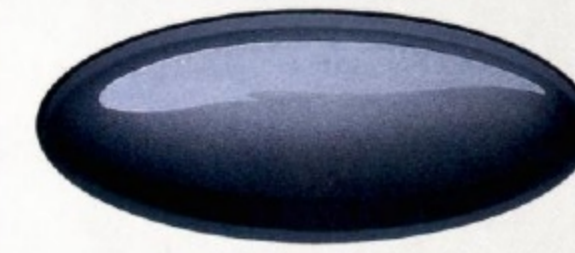
Dark Blue Clearcoat Metallic