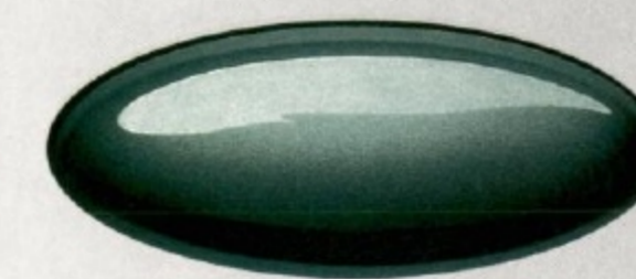
Deep Emerald Green Clearcoat Metallic