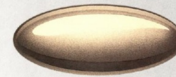
Light Prairie Tan Clearcoat Metallic