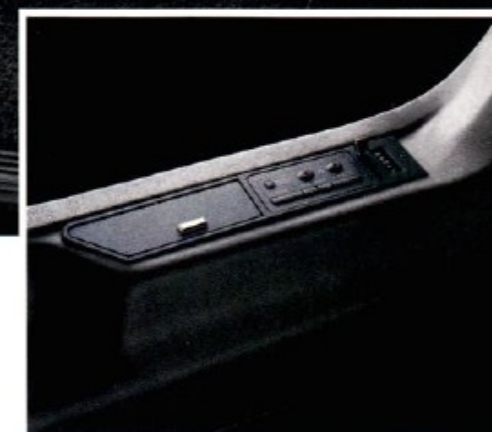
Rear controls for sound systems are provided, and a high-capacity air conditioning system is available.