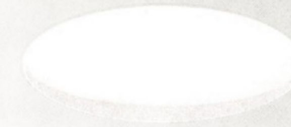
Oxford White Clearcoat