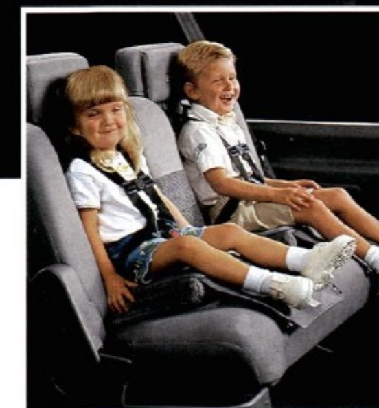
Optional integrated child safety seats are available with the rear bench seat.