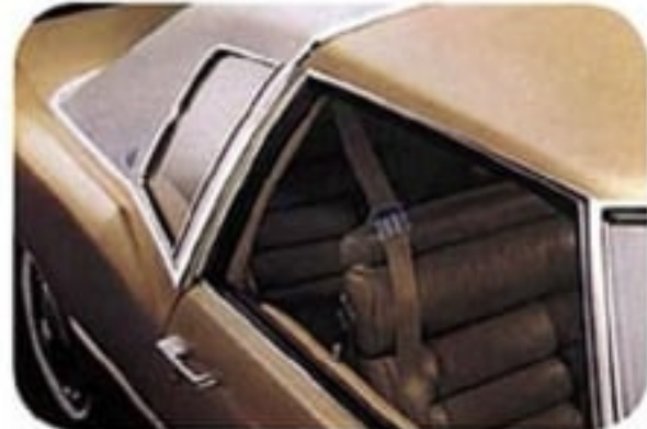
Pictured is the Eldorado Coupe with Custom Cabriolet roof—available with or without an electrically operated sunroof or the new Astrorooft.

Special Editions of DeVille. Coupe deVille d'Elegance. Combines Coupe deVille exterior styling with special striping, standup crest and interior luxury such as Manhattan velour trim and deep pile carpeting. Sedan deVille d'Elegance. Here is the four-door roominess of America's favorite luxury sedan mated with the exclusiveness and luxury of d'Elegance. Coupe deVille Cabriolet. It features a dramatic vinyl roof design with a sheer chrome accent strip that halos the entire back top section. A new Astrorooft or conventional sunroof is available to give it even more spirit. Interior remains the same as the standard Coupe deVille. Coupe deVille d'Elegance with Cabriolet roof. This version blends all the luxury of d'Elegance with the flair of Cabriolet styling. Electrically-operated sunroof or new Astrorooft may also be specified.