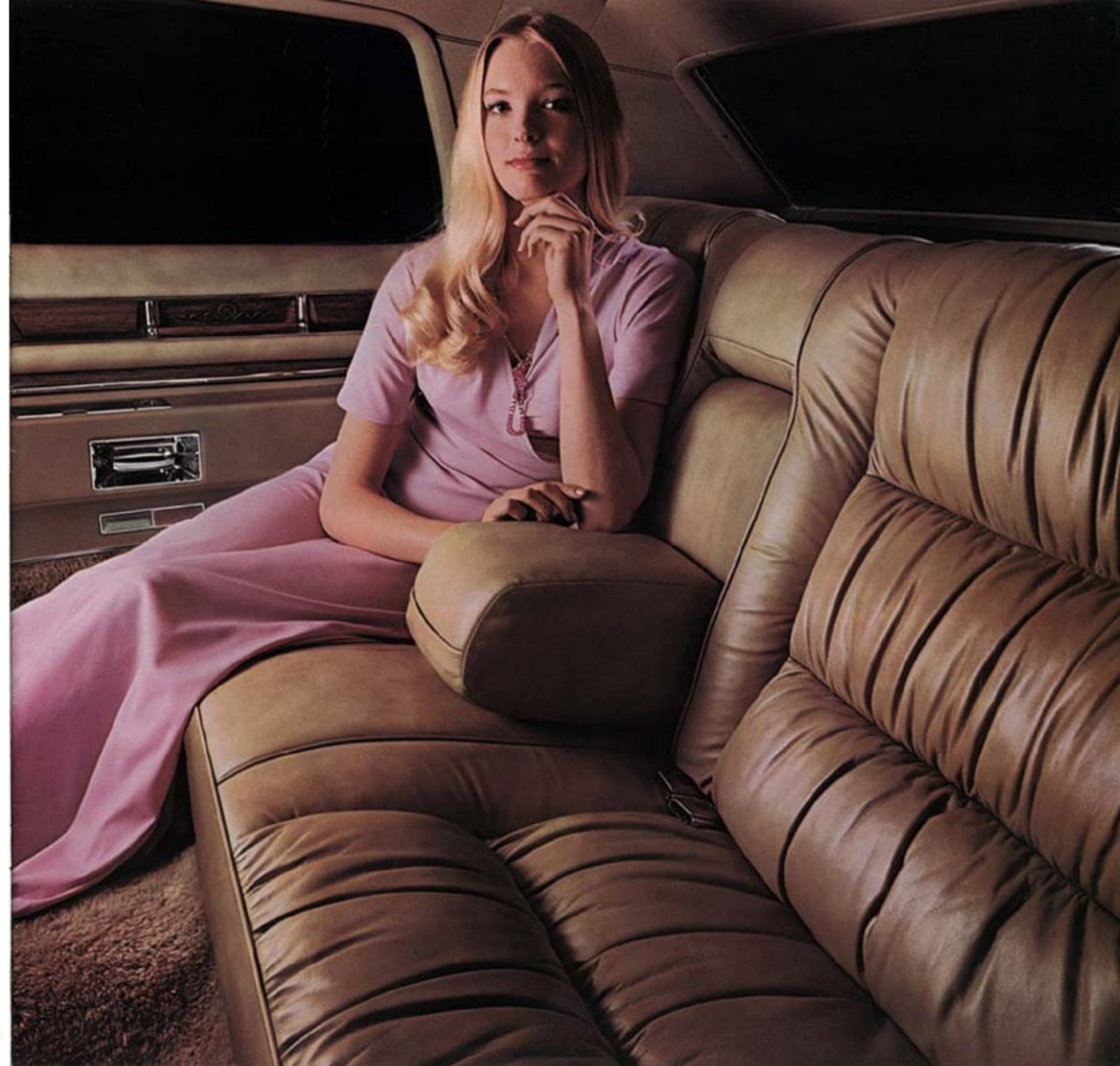
New softer leather interior of the Fleetwood Brougham

... the long-lasting value of Cadillac 1975 becomes increasingly apparent.