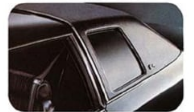
The Coupe deVille Cabriolet features a dramatic vinyl roof design with a sheer chrome accent strip, as well as a stand-up see-through crest on the hood.