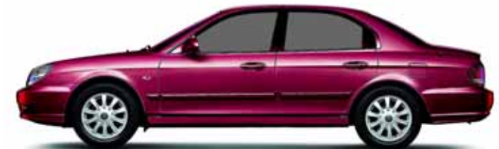
Canton Cherry (Mica)

Current as at 01/12/2004. Part No: SN0704S Note: Car colours are indicative only and may vary due to the printing process. Sonata V6 model shown.