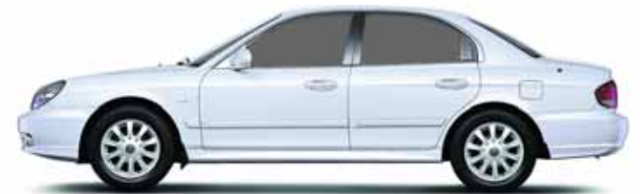
Noble White (Solid)