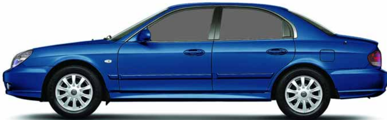
Ardor Blue (Metallic)