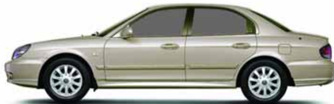
Grace Beige (Metallic)