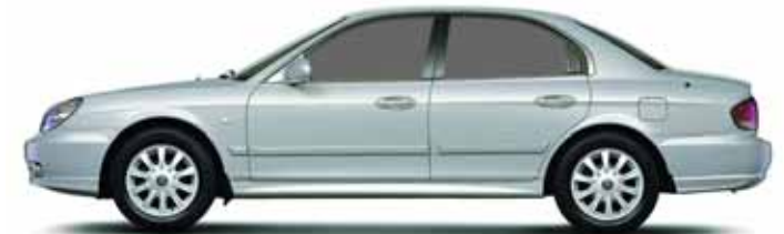
Sleek Silver (Metallic)