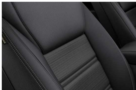
Black One-Tone Cloth Trim