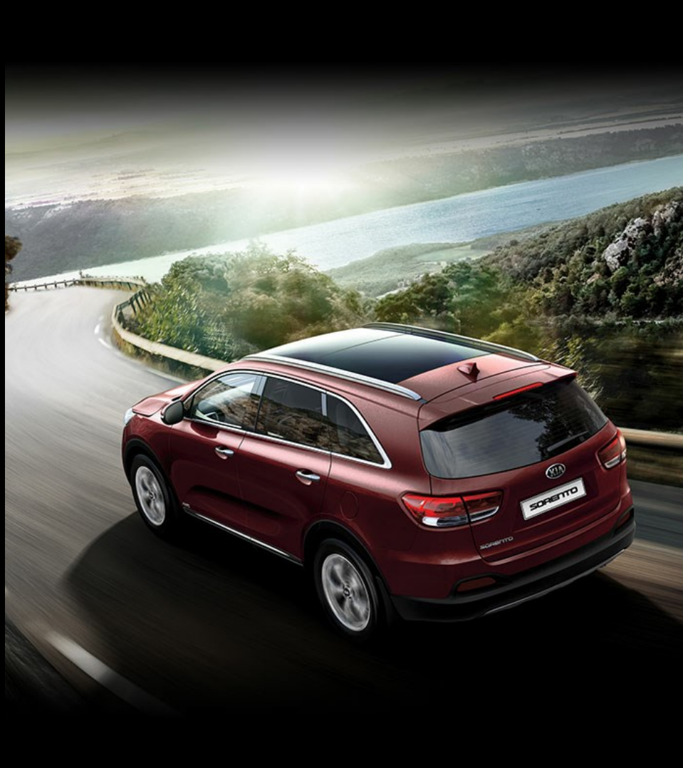
Platinum model shown