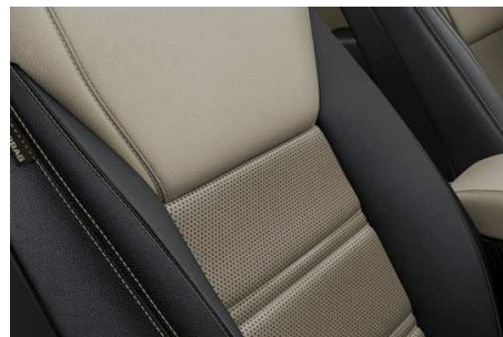
Black & Stone Two-Tone Leather* Trim †