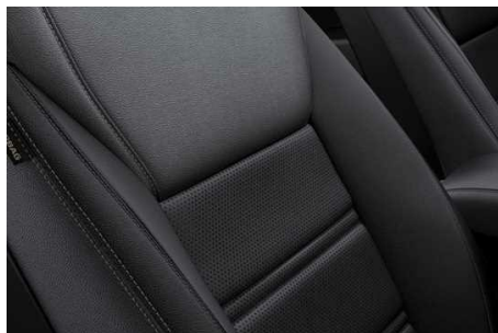
Black One-Tone Leather* Trim