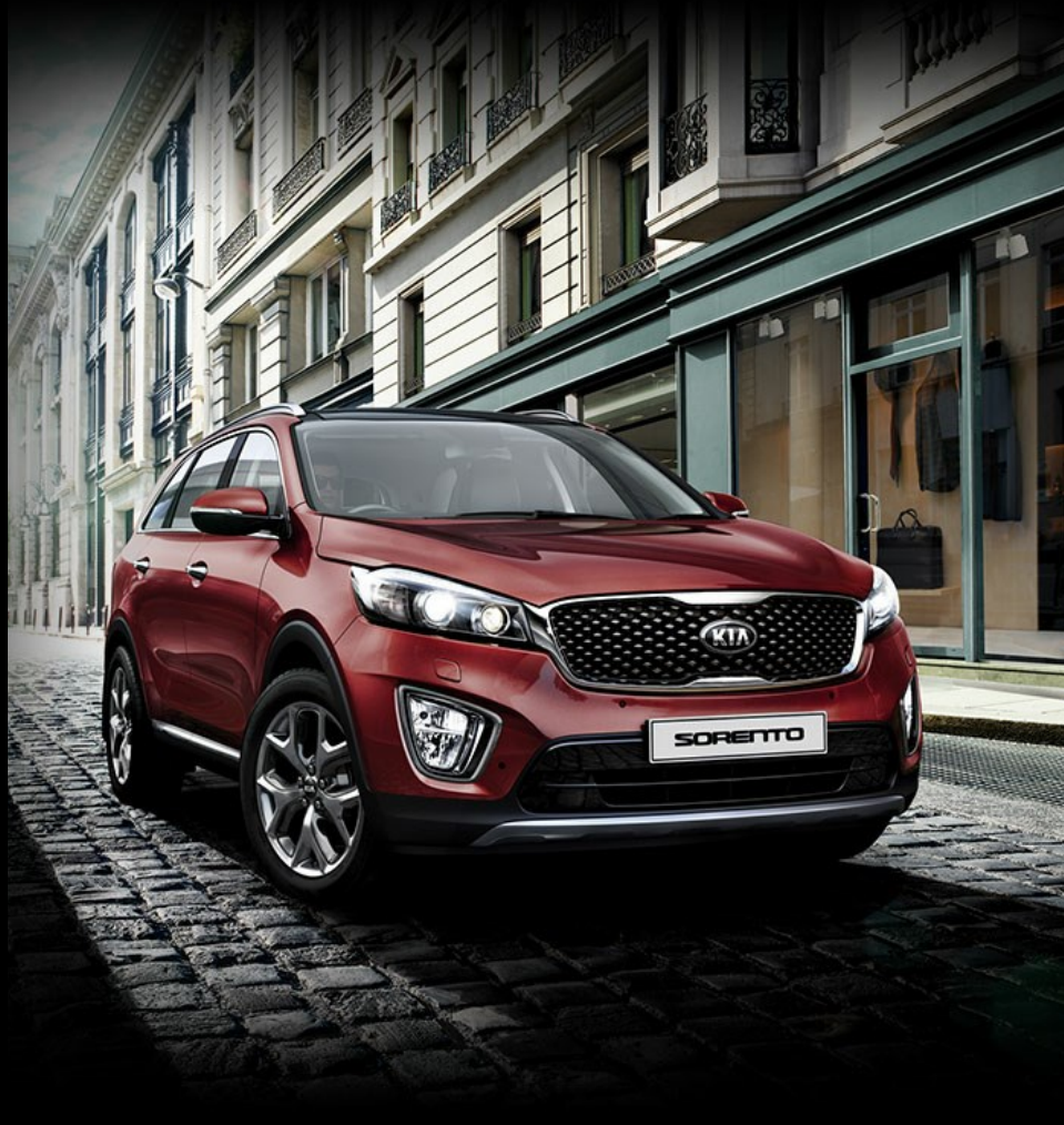
Platinum model shown